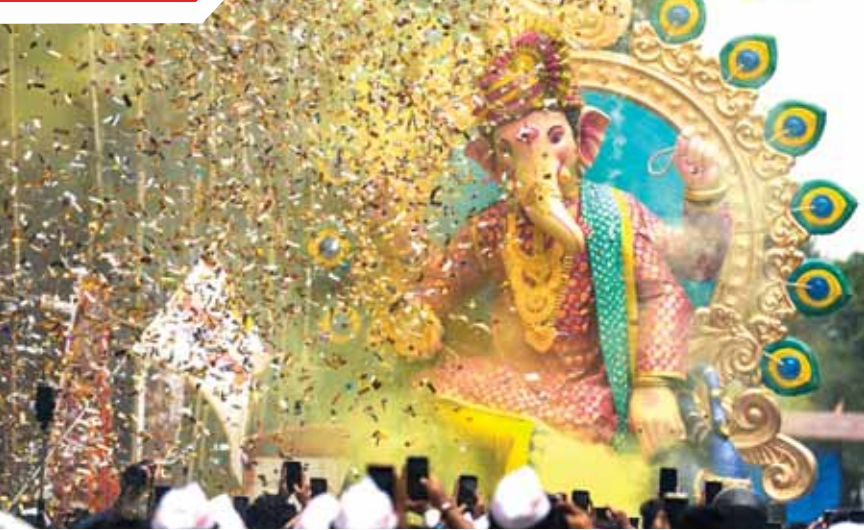
Devotees carry an idol of Lord Ganesha ahead of the Ganesh Chaturthi festival, in Mumbai