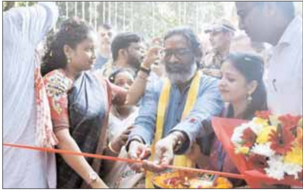
Chief Minister Hemant Soren inaugurates New Jharkhand Bhawan in New Delhi on Tuesday. JMM MLA Kalpana Soren is also present on the occasion.

is known that the building of Jharkhand Government is already located in Basant Vihar, Delhi. Connaught Place is considered the most popular due to being the center. On this occasion, Soren said that this building was awaited for a long time. Today its inauguration is a matter of pride for us. In our new building, special attention has been given to new state-of-the-art technology, in which special facilities of gym, dining hall, conference hall and parking have been taken care of. Our building is equipped with special technology. In which special attention has also been given to rain water harvesting and energy efficiency. Its location in