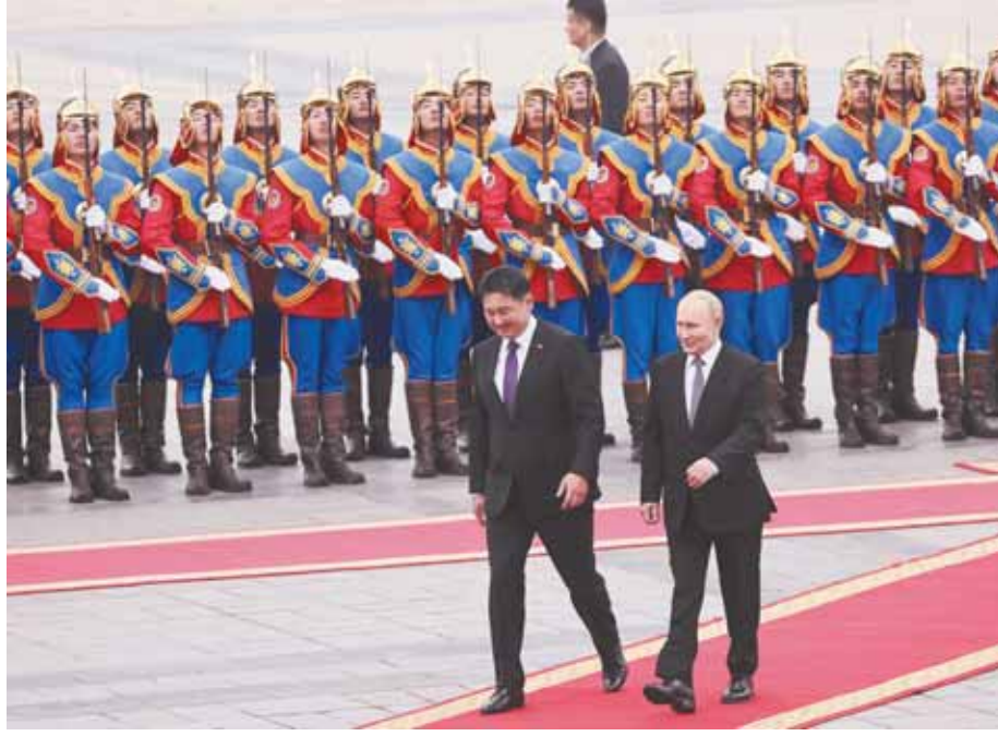
Russian President Vladimir Putin, right, walks with Mongolian President Ukhnaagiin Khurelsukh, left, during welcoming ceremony at Sukhbaatar Square in Ulaanbaatar, Mongolia, Tuesday.

A spokesperson for Putin said last week that the Kremlin wasn't worried. The warrant puts the Mongolian government in a difficult position. After decades under communism with close ties to the Soviet Union, it transitioned to democracy in the 1990s and has built relations with the United States, Japan and other new partners. But it remains economically dependent on its two much larger and more powerful neighbours, Russia and China. Russia supplies the landlocked country with most of its fuel and a sizeable amount of its electricity. The ICC has accused Putin of being responsible for the abductions of children from Ukraine, where the fighting has raged for 2½ years. Member countries are required by the court's founding treaty, the Rome Statute, to detain suspects if an