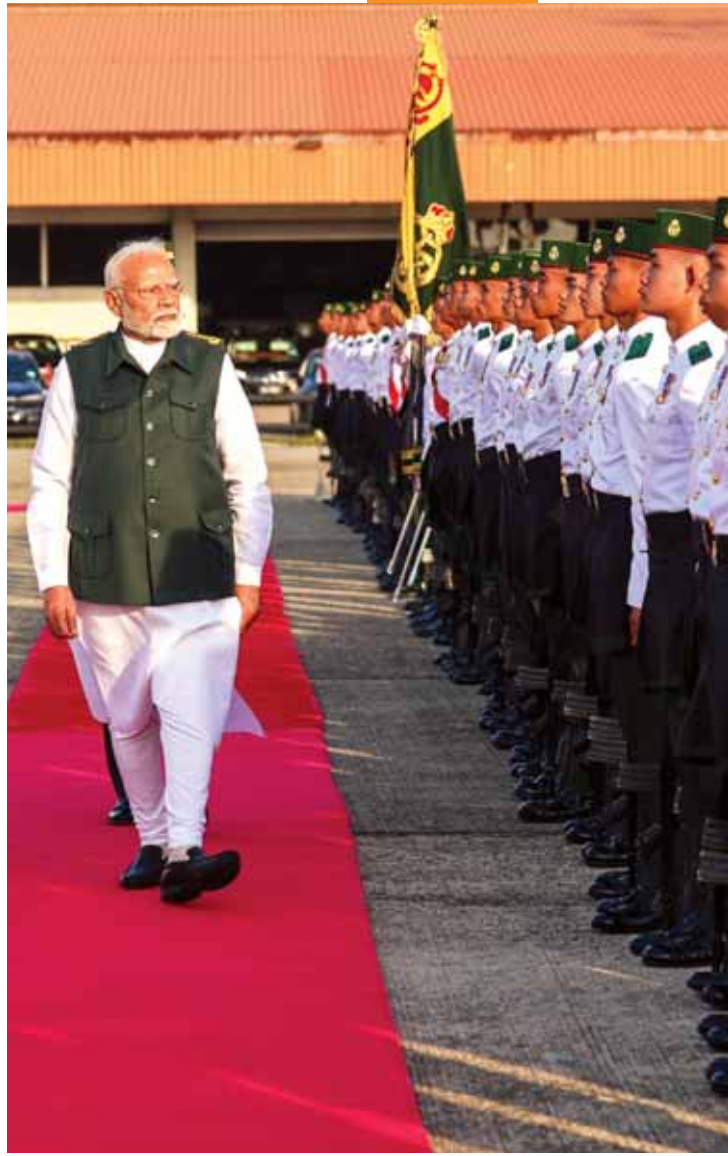
PM receives a ceremonial welcome in Brunei on Tuesday