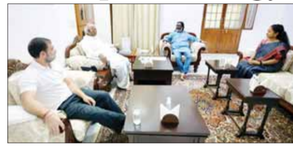
Chief Minister Hemant Soren with his wife and JMM MLA Kalpana Soren during a meeting with Congress President Mallikarjun Kharge and Opposition leader of Lok Sabha Rahul Gandhi in New Delhi on Tuesday.

RANCHI With the Assembly elections in Jharkhand just a few months away, Chief Minister Hemant Soren met Congress President Mallikarjun Kharge and Leader of Opposition in Lok Sabha Rahul Gandhi in New Delhi on Tuesday. The Chief Minister was accompanied by his wife, Kalpana Soren. The Chief Minister was in the national capital for the inauguration of a new building of Jharkhand Bhawan.