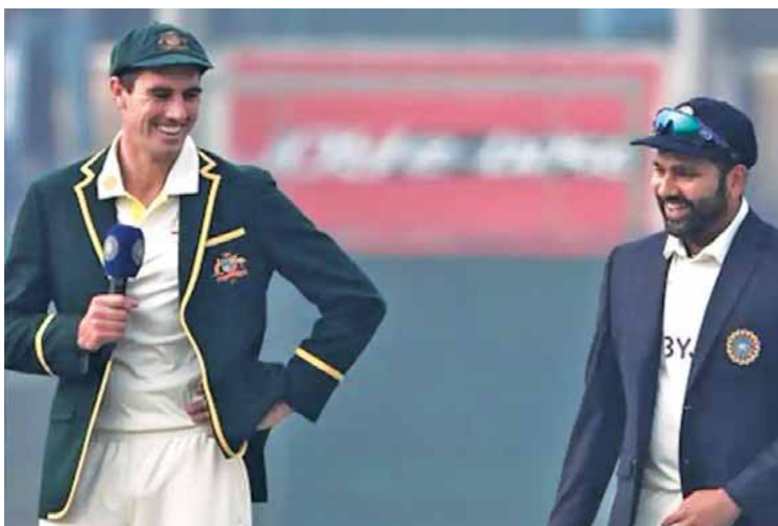
Gavaskar Trophy," he added. Senior batter Steve Smith agreed with the skipper and said it will be a "big summer" for Australia against a "well-balanced" Indian team. "...You know, it's going to be a great series. You know, India have been playing outstanding cricket. We've been playing really good cricket the last couple of years. You know, we haven't beaten India in the last two times they've come out here," he said. "Obviously got a terrific side, very well-balanced team, all bases covered. So, you know, they've played really good cricket out here. They've played good cricket when we've been over in India as well, where we know they're very, very difficult to beat. So it's going to be a big summer. It's going to be an exciting one." Pacer Mitchell Starc highlighted the importance of the rivalry by keeping it at par with the Ashes.

Australian captain Pat Cummins is looking at the upcoming five-match rubber against India as a chance to "make amends" for the successive Test series defeats at home against their fierce rivals. He said the next Border-Gavaskar Trophy, which will start on November 22 in Perth, promises to be a 50-50 affair. India retained the trophy in the last four series, from 2016-17 to 2022-23. India had defeated Australia in their own backyard in the last two series in 2018-19 and 2020-21. Cummins said Australia are hoping to draw confidence from their win over India in the World Test Championships Final at London last year. "The last two series here in Australia, we haven't been successful, so it's been a long time. Hopefully, it's time to make amends," Cummins told Star Sports. "You know, we've played them (India) plenty of times where they've beaten us, but we've also had plenty of wins against them as well, which we'll draw confidence from. The most recent Test match was, of course, the World Test Championship in neutral conditions, and we came out on top in that match. "It's always fiercely competitive, and it always feels like it's 50-50. I'm 10 out of 10 excited for the Border-