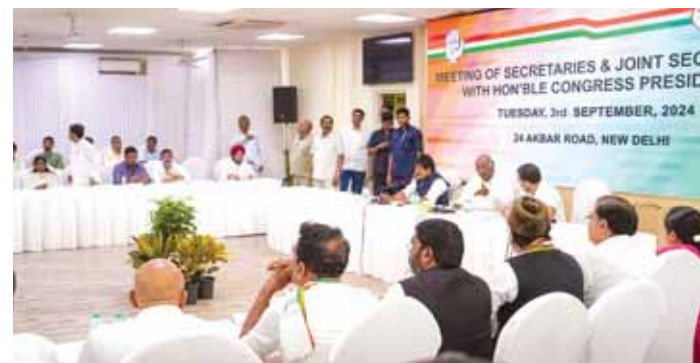
Leader of Opposition in Lok Sabha and Congress MP Rahul Gandhi with party president Mallikarjun Kharge and party MP KC Venugopal during meeting with party secretaries and joint secretaries, in New Delhi, on Tuesday

The Congress and the Aam Aadmi Party have reached an 'in-principle understanding' to fight next month's Haryana Assembly election together against the wishes of its State unit, though nothing has been finalised yet. Sources said two rounds of talks between AAP MP Raghav Chadha and Congress's KC Venugopal have already been held. The third round of meeting can be held on Wednesday. Sources said the AAP is reported to have demanded 10 seats, while the Congress is willing to give between five and seven only. The Congress is reportedly also willing to give one seat to the Samajwadi Party. The deadline for nominations is October 4 with voting on October 5. Against the wishes of its State unit, the Congress on Tuesday said it is in talks with the Aam Aadmi Party (AAP) for an alliance in Haryana though nothing has been finalised yet. According to sources, in its Central Election Committee (CEC) meeting on Monday evening, party leader Rahul Gandhi expressed interest in exploring the possibility of alliance with AAP for Assembly elections in Haryana. Ironically, the State Congress leaders in Haryana have rejected the possibility of any alliance with