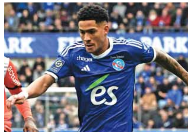
permanent deal to Al Nassr - where Cristiano Ronaldo where Cristiano Ronaldo the move was announced a day after the Saudi transfer window shut and will help