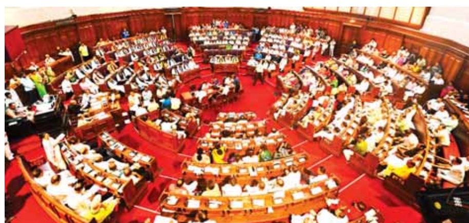
West Bengal Chief Minister Mamata Banerjee speaks during a Session of the State Legislative Assembly, in Kolkata, on Tuesday. The Aparajita Woman and Child (West Bengal Criminal Laws and Amendment) Bill 2024 was passed during the Session

In the backdrop of a Statewide agitation for justice for the Kolkata lady doctor who was raped and murdered early this month while on duty turning fast into a movement for "change of the system that harbours rapists and the corrupt," the Mamata Banerjee Government of Bengal on Tuesday got an anti-rape "Aparajita" Bill passed unanimously. This makes West Bengal first State to bring in amendments to Central laws dealing with such offences. The Opposition parties, however, called it a diversionary tactics in order to contain the Statewide unrest and assuage peoples' anti-Government feelings. Notwithstanding stringent remarks from the Opposition Bench, Chief Minister Mamata Banerjee asked Opposition leader Suwendu Adhikari to help get the Bill signed by Governor CV Ananda Bose and President Droupadi Murmu. Apart from prescribing life imprisonment until death, the Bill, christened 'Aparajita Woman and Child Bill (West Bengal Criminal Laws and Amendment) 2024, provides for death penalty for a repeat