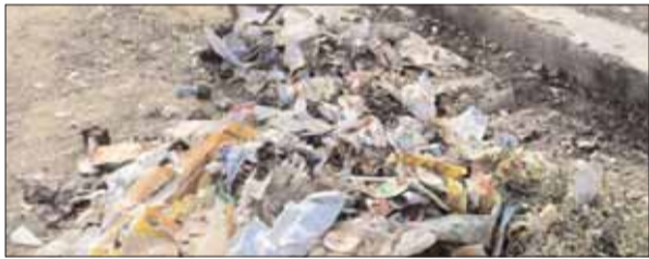
Garbage stacks near Kadru Railway station in Ranchi on Tuesday.

lifting vehicle drivers were involved in the agitation which started on Monday morning at Naga Baba Khatal in Ranchi. The umbrella body of the protestors- RMC Safai Karamchari Sangh initiated the strike to urge the civic body to accept its five major demands including regularisation of workers who have been working with the body for over a decade, raise and clearance of DA and equal pay for similar category of workers. "Some of us have not received salaries for work done during the pandemic while some other are due to receive their DA. Workers who have completed 10 years with the body should be regularised. Equal pay should be given for equal work. After a meeting with the