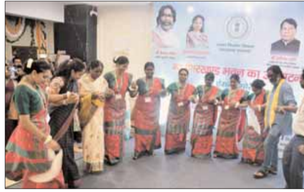
Chief Minister Hemant Soren, his wife MLA Kalpana Soren dance with artists during inauguration of New Jharkhand Bhawan in New Delhi on Tuesday.

Connaught Place and proximity to railway, bus stop, metro, hospital etc. makes it even more impressive. Its opening will bring convenience to the residents of