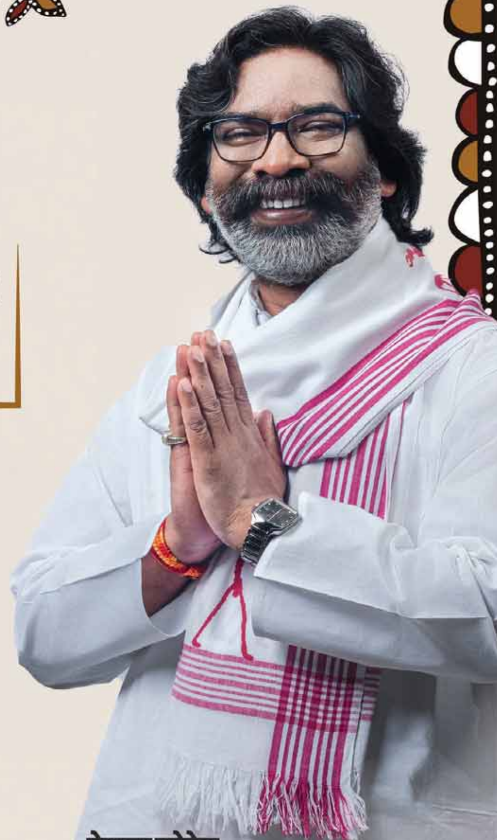
हेमन्त सोरेन मुख्यमंत्री, झारखण्ड

सितंबर से हर महीने की 15 तारीख को हर बहन के खाते में पहुँचेगी सम्मान राशि