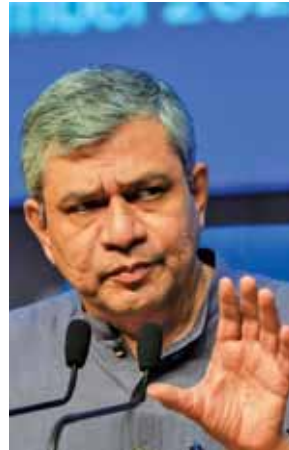
Union Minister Ashwini Vaishnaw briefs the media over cabinet decisions, in New Delhi, Monday

In an effort to improve the lives of farmers and increasing their income, the Union Cabinet chaired by Prime Minister Narendra Modi on Monday approved around ₹13,966 crore outlay for seven big-ticket programmes related to the farming sector, including a ₹2,817-crore digital agriculture mission and a ₹3,979-crore scheme for crop science.