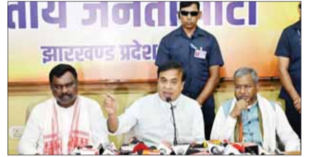
Assam Chief Minister cum BJP Jharkhand co-in-charge Himanta Bishwa Sarma addresses a press conference at party HQ in Ranchi on Monday. State BJP President Babul Marandi and Opposition Party Leader Amar Kumar Bauri are also seen in the picture.

He said that all these youths come from poor fami-