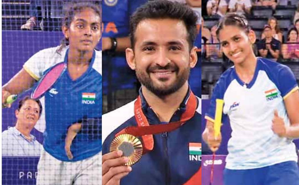
(From left to right) Indian para-badminton players Thulasimathi Murugesan wins silver medal, Kumar Nitesh gold and Manisha Ramadass bronze at the Paralympics 2024, in France, on Monday