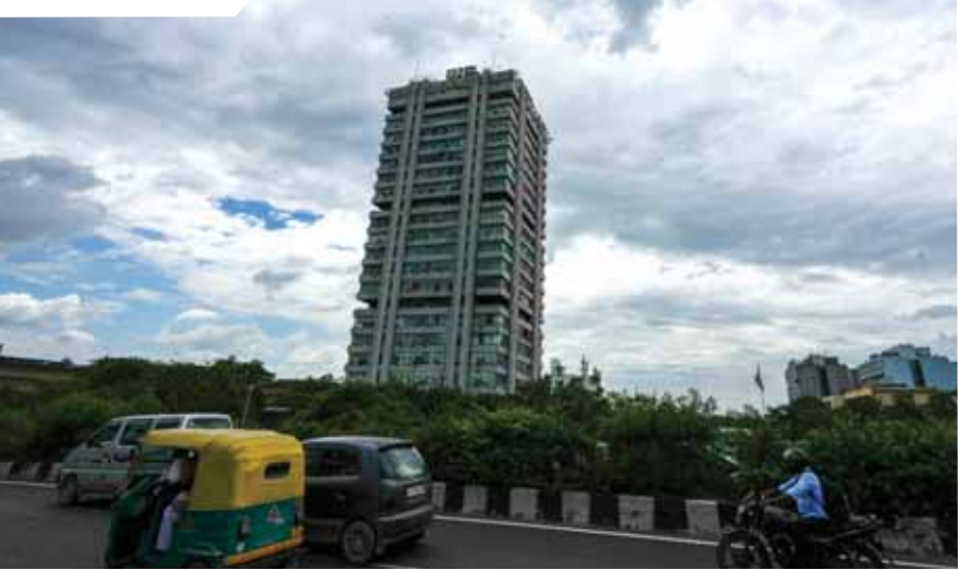
Clouds hover over the Delhi as vehicles pass by the Vikas Minar, in New Delhi