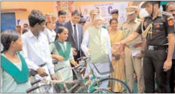
Governor Santosh Gangwar interacts with students at the Hurlung Panchayat Bhawan in Birsanagar as part of a direct dialogue program aimed at understanding the needs and concerns of the residents in Jamshedpur on Monday.

attention to their concerns. Several women from the village took the opportunity to present their grievances to the Governor. They highlighted issues such as the need for improvements under the Pradhan Mantri Awas Yojana and the challenges faced by Self-Help Groups (SHGs) in the area. They also raised concerns about basic infrastructure, healthcare, and educational facilities. Gangwar responded empathetically, acknowledging the problems shared by the community members. He reiterated that the development work undertaken by both the central and state governments is meant to