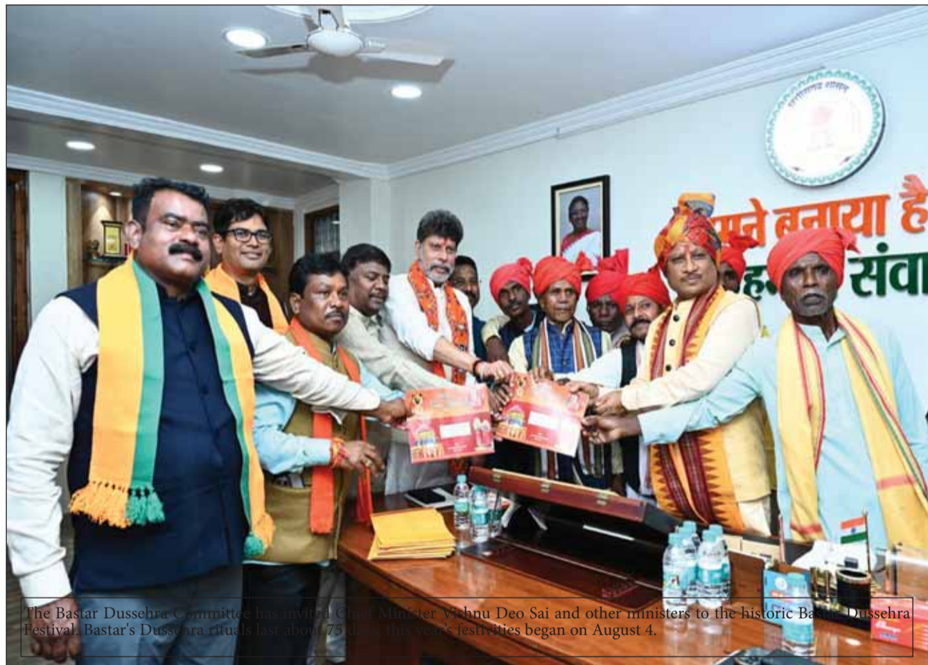
The Bastar Dussehra Committee on Friday presented a letter to Chief Minister Vishnu Deo Sai and other ministers to the historic Bastar Dussehra Festival. Bastar's Dussehra rituals began on August 7. The festival's activities began on August 4.

Raipur on the birth anniversary of Mahatma Gandhi on October 2 with a public meeting.