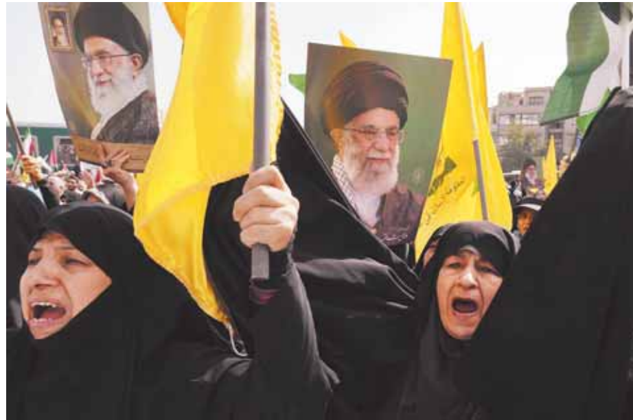
Iranian worshippers chant slogans as they hold up posters of Supreme leader Ayatollah Ali Khamenei and Lebanon's militant Hezbollah group flags during an anti-Israeli rally after Friday prayers in Tehran, Iran, Friday.

AP ■ DEIR-AL-BALAH An Israeli airstrike hit a school sheltering thousands of displaced Palestinians in northern Gaza on Thursday, killing at least 11 people and wounding 22, including women and children, the territory's Health Ministry said. The Israeli military confirmed it struck the school in the Jabalia refugee camp, saying it was targeting Hamas militants inside who were planning attacks on Israeli troops. The claim couldn't be independently confirmed. Footage from the al-Falouja School showed rescue workers rushing casualties out of the school compound amid widespread debris and crowds of people. One video showed men wrapping a mangled, severed torso in a plastic sheet and putting body parts into a cooler. Gaza's Health Ministry didn't immediately say how many of the casualties were women and children.