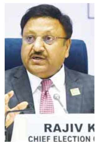
Chief Election Commissioner Rajiv Kumar expressed his displeasure over the state administration's non-compliance, stating that the delay undermined efforts to ensure a free and fair electoral process.

PIONEER NEWS SERVICE ■ NEW DELHI Sending out a stern Smessage, the Election Commission on Friday sought an explanation from the Maharashtra chief secretary and the state's police chief for failing to fully implement its orders on the transfer of officials ahead of the upcoming assembly polls. In a strongly-worded letter, the poll body said despite a directive issued on July 31 to relocate officials who had served in their home districts or current posting for over three years, the state administration had not completed the process. According to the Election Commission's (EC) mandate, the compliance report was due by August 31. While the additional director general of police submitted a partial report, the chief secretary is yet to provide a full response. Sources noted that more than 100 inspector-level officers in Mumbai and revenue officials, many holding key positions in the state, had not been transferred as required.