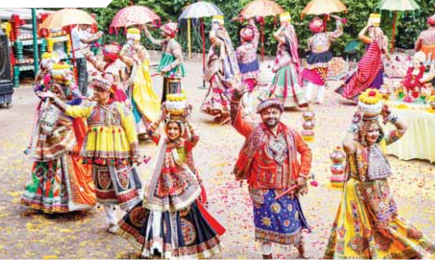
Performers dressed in traditional attire rehearse for Garba, ahead of Navratri festival, in Ahmedabad