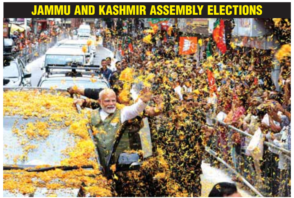
Prime Minister Narendra Modi during a roadshow for J and K Assembly elections, at Katra in Reasi district, Jammu and Kashmir, Thursday