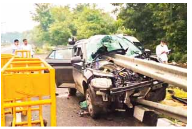
A damaged SUV after it crashed into a guardrail, in New Delhi, Thursday, September 19, 2024. At least two people suffered injuries in the accident, according to officials

watchdog FATF has given high rating to India on parameters, including financial intelligence, anti money laundering and terror financing risks, as well as disclosure of beneficial ownership.