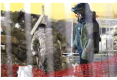
A Lebanese army bomb disposal specialist wearing a protective gear prepares, with his comrade, to detonate a walkie-talkie that was found at the parking of the American University Hospital, in Beirut, Lebanon

"Pakistan itself has exposed the Congress and the National Conference. They wanted to implement Pakistan's agenda here... We will not allow the implementation of Pakistan's agenda in Jammu and Kashmir. No power in the world can bring back Article 370 in Jammu and Kashmir." PM Modi also sounded a note of caution saying that a vote for Congress would lead to the reinstatement of Article 370, which he said would pave the way for violence to return to the Valley.