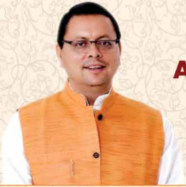
Pushkar Singh Dhama Chief Minister, Uttarakhand