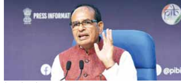
Shivraj Singh Chouhan at a press conference on 100 days achievements of the ministry at National Media Centre, in New Delhi on Thursday.

Agriculture Minister Shivraj Singh Chouhan on Thursday announced that the government will soon release the report of the committee on Minimum Support Price (MSP) for crops, which was established following the withdrawal of the three controversial farm laws. The minister also unveiled new initiatives aimed at modernizing agriculture and improving farmer engagement during a press briefing on the achievements of the Modi 3.0 government's first 100 days. 'Adhunik Krishi Choupal', a new programme featuring scientists sharing agricultural innovations with farmers, will be aired on Doordarshan and All India Radio from October. The minister will hold weekly interactions with farmers and agricultural leaders at the