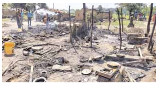
Charred remains are seen after multiple houses were allegedly set on fire, in Nawada district, Bihar, Thursday

Twenty-one houses were set on fire in Bihar's Nawada district near the Capital city Patna. Preliminary investigation suggested that a land dispute could be the cause behind the incident that happened in Manjhi Tola in Mufassil police station area on Wednesday late evening.