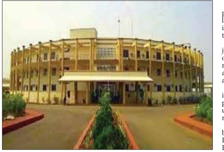
Human Rights Commission, adding greater significance to this year's event.

The Hidayatullah National Law University (HNLU), Raipur, in partnership with the National Human Rights Commission (NHRC), will host the HNLU-NHRC National Moot Court Competition from September 20 to 22.