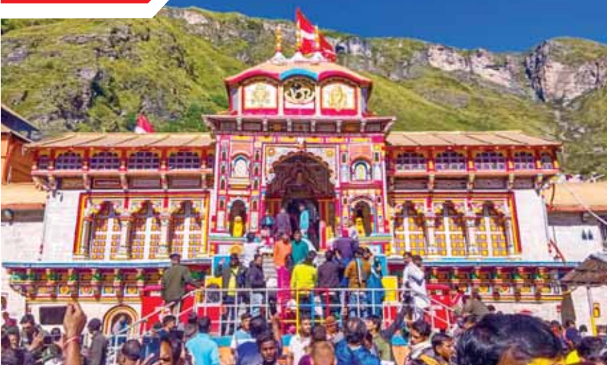
Pilgrims arrive at the Shri Badrinath Dham in Chamoli district