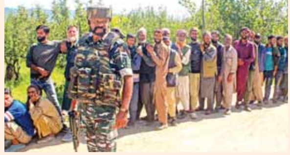
Shopian: Voters wait in a queue at a polling station during the first phase of Assembly elections, in Shopian district of south Kashmir, Wednesday

Close to 14 lakh electorate (around 60 per cent), belonging to different age groups and political beliefs, dressed in their traditional attire, demonstrated the superiority and priority of 'ballot over the bullet' on Wednesday as they queued up outside the polling stations.