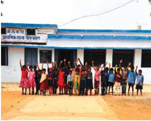
to improve their quality of life. One such story is from Gram Panchayat Peepalbhara in Manendragarh-Chirmiri-

The scheme aims not only to provide employment to the poor in rural areas but also