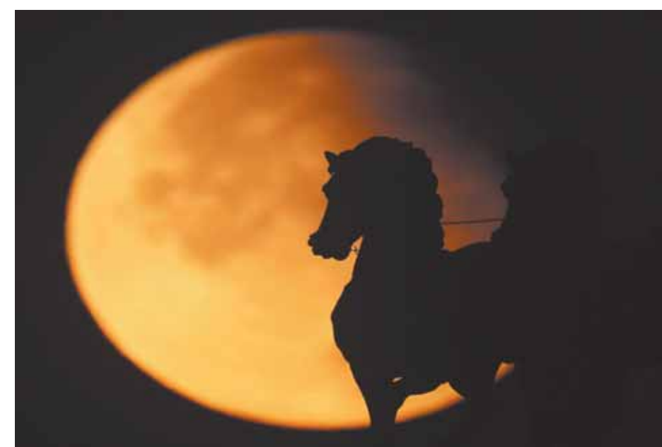
A supermoon rises behind a horse statue atop of Triumphal Arc during a partial lunar eclipse in Moscow, Russia, Wednesday.

port of call. "PNC revealed that the primary objective of the trip is to seek the strategies utilised by China, to achieve its current economic development, all while enhancing the bilateral ties between the two countries," the PSM News said.