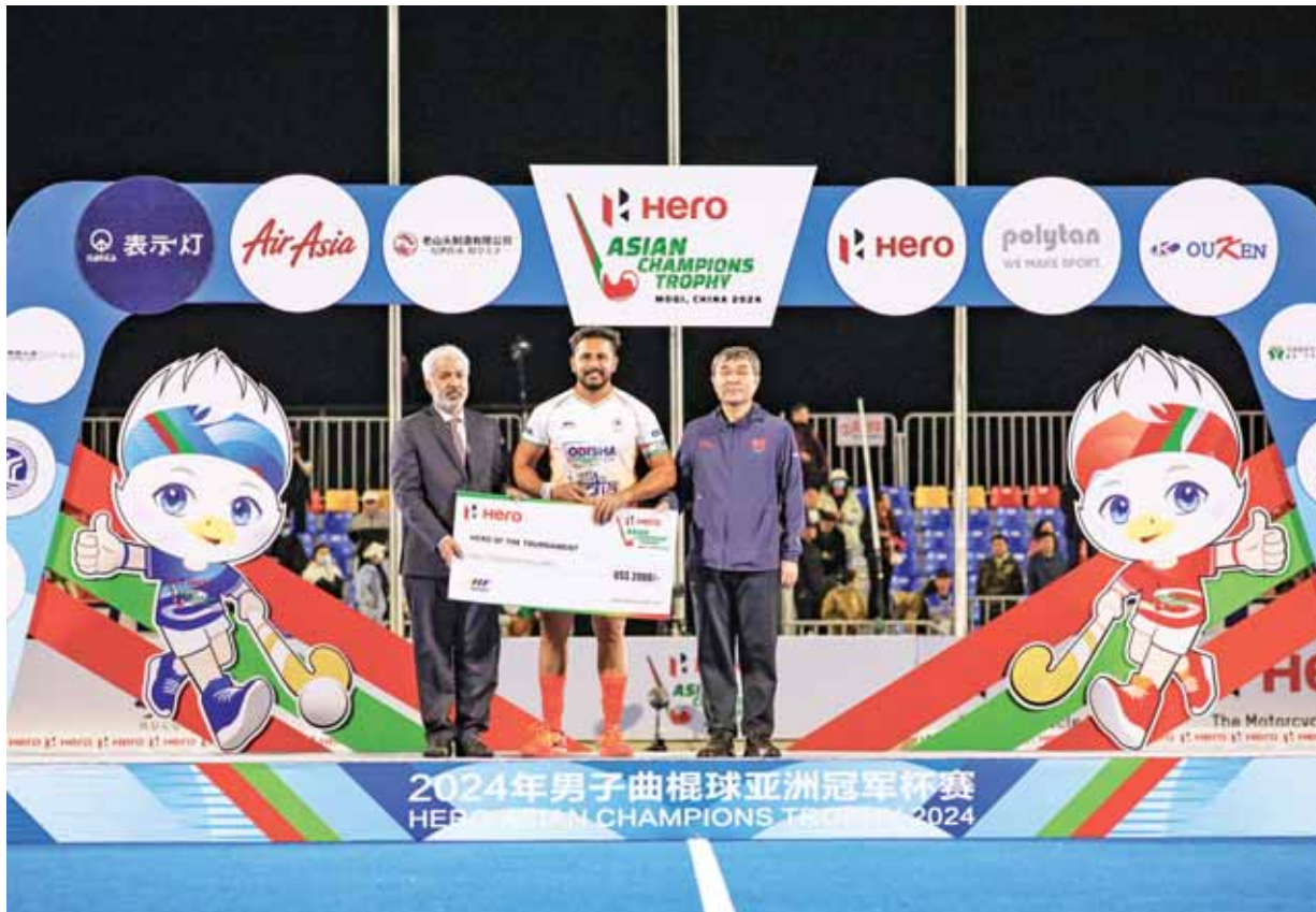
Chennai, the gold medal in the Hangzhou Asian Games and the bronze from the Paris 2024 Olympics have instilled a deep camaraderie within the team.