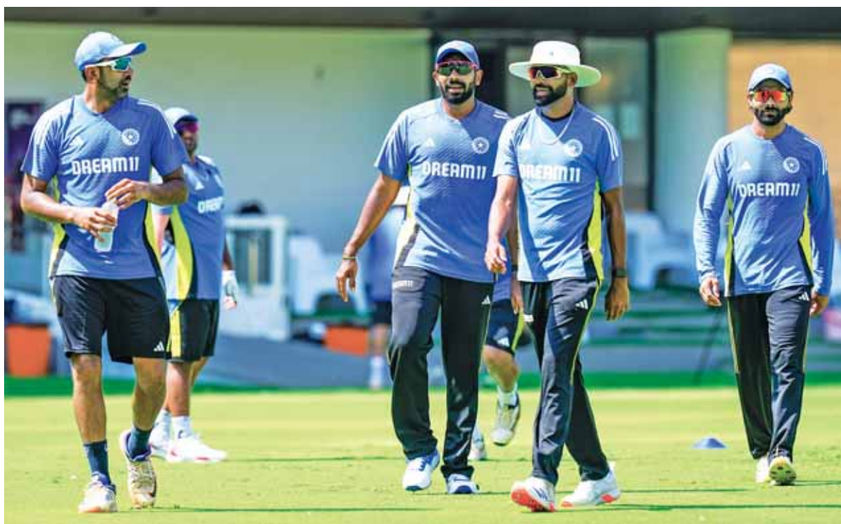
spinners in a three-match ODI series which they lost 0-2. There are bright points too in Rishabh Pant (five matches, average 70), Shubman Gill (10

Kohli's extraordinary qualities as a batter, but it's an area that the champion cricketer himself will certainly want to improve upon. Skipper Rohit Sharma has also been prolific in dismantling spin, especially since his promotion as an opener in 2017 against South Africa. He averaged over 90 against twerkers. But since 2021, it has come down to a less flashy 44 in 15 matches. KL Rahul, a batter who is backed by Rohit as equally proficient against spin and pace, offers a slightly bleaker picture. In the last three years, he has played five Tests at home but against the slower kind, the elegant right-hander's average has taken a beating and stands at 23.40. Collectively, these stats need to be taken as an indication of waning skills but, perhaps, also as a reminder to refocus on perfecting the art of playing spin, often the core strength of batters from this part of the world. Assistant coach Ryan ten Doeschate had stressed on this point recently after India's debacle against Sri Lankan