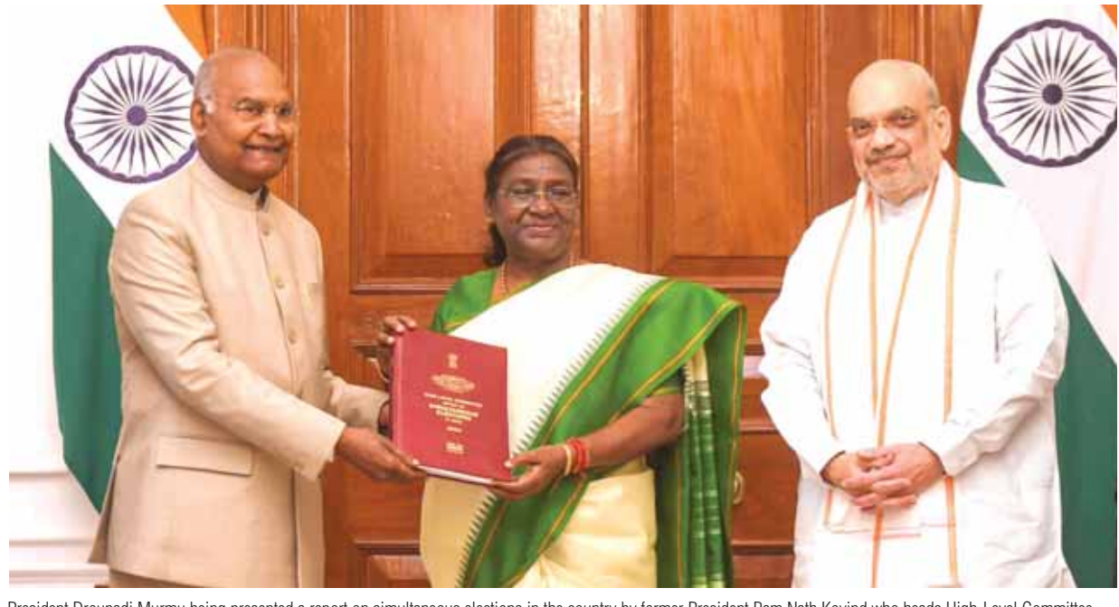
President Droupadi Murmu being presented a report on simultaneous elections in the country by former President Ram Nath Kovind who heads High-Level Committee (HLC) on 'One Nation, One Election', and Home Minister Amit Shah, at Rashtrapati Bhavan in New Delhi

The Centre has geared up to realise the dreams of having simultaneous polls as it went ahead in approving the high-level panel's recommendations on 'one nation, one election' plan for holding for the Lok Sabha, State Assemblies and Local Bodies elections simultaneously in a phased manner after a countrywide consensus-building exercise.