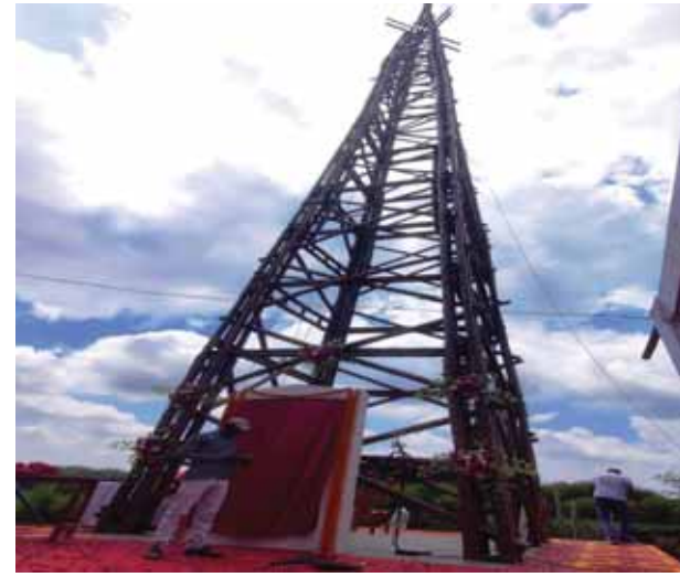
design centres are set up to manufacture new designs of furniture and other materials from bamboo as per utility, then exportable products will also be prepared in the state.

Addressing the event, Gadkari suggested a policy to encourage the use of bamboo to improve the lives of tribals. He emphasised that if