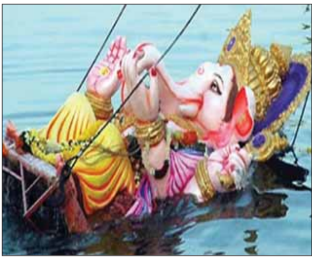
through Jaistambh Chowk, Kotwali Chowk, Sadar Bazaar, Satti Bazaar, Kankali Talab Road, Purani Basti Thana Chowk, Lili Chowk, Lakhenagar and Sundar Nagar Chowk to Ring Road Chowk. The idols will be immersed at the immersion kund near Mahadev Ghat. During the procession of Ganesha idols, the police will maintain one-way traffic from Lakhenagar to Mahadev Ghat via Ring Road Chowk. He said the immersion should be done strictly in the immersion kunds and the items used in pooja rituals must be kept in a separate