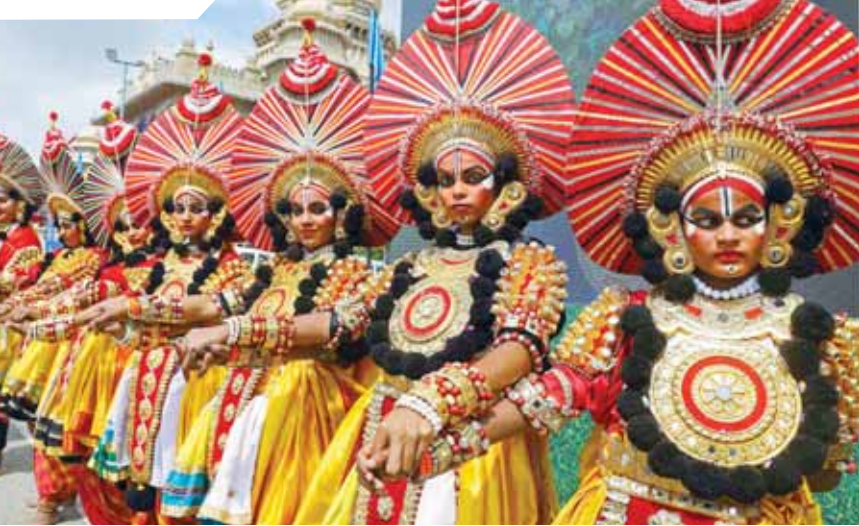
Folk artists take part in a human chain organised as part of 'International Democracy Day' celebrations, in Bengaluru.