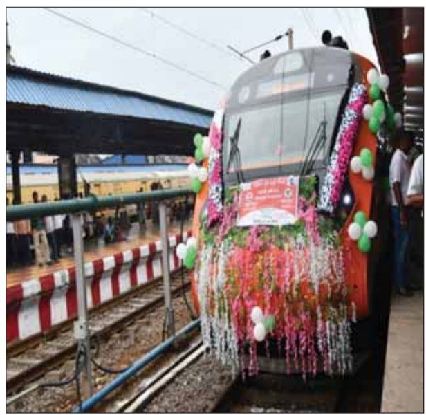
from Raipur railway station for Vizag. It is the second Vande Bharat train for Chhattisgarh. The first was the Bilaspur-Nagpur Vande Bharat train launched in December 2022. The event was attended by

Chhattisgarh on Monday got its second Vande Bharat train as Prime Minister Narendra Modi virtually flagged off the Durg-Visakhapatnam-Durg Vande Bharat Express train. Modi also virtually flagged off several Vande Bharat trains on routes - Nagpur to Secunderabad, Kolhapur to Pune, Agra Cantt to Banaras, Pune to Hubballi, and the first 20-coach Vande Bharat train from Varanasi to Delhi at a function in Ahmedabad. He too inaugurated India's first Namo Bharat Rapid Rail between Ahmedabad and Bhuj. Union Railway Minister Ashwani Vaishnav joined the event via video conference. The second Vande Bharat train between Durg and Visakhapatnam departed