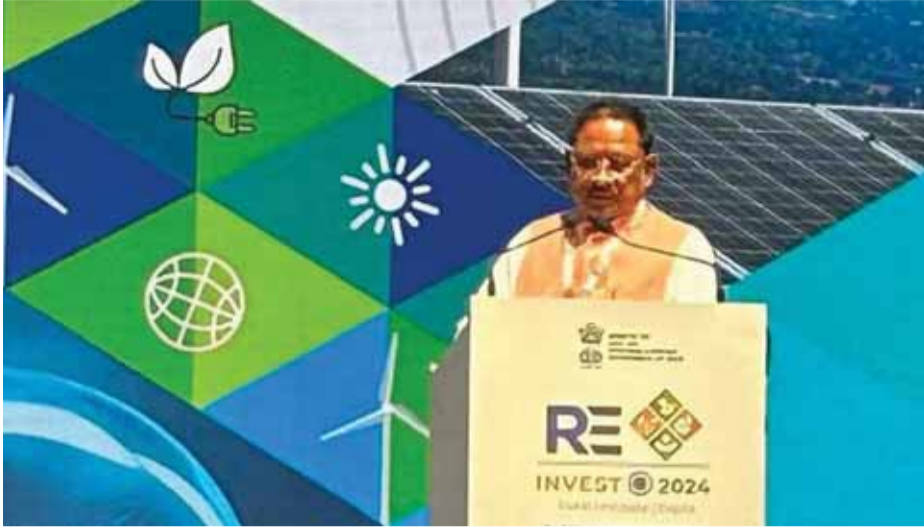
The Chhattisgarh Renewable Energy Development Authority is striving hard to achieve the target of 45 per cent dependency on the renewable source, he said. Sai also said that Chhattisgarh will play a key

Chief Minister Vishnu Deo Sai on Monday said Chhattisgarh will soon increase its dependency on renewable energy to 45 per cent, a hike of 30 per cent from the present dependency of 15 per cent. Sai said this while talking to reporters at the RE Invest: Global Renewable Energy Investor's meet and expo in Gandhi Nagar in Gujarat. Citing that there was a need of 5,500 mega watt power in Chhattisgarh, the Chief Minister announced that the state will promote renewable energy to combat the problem of climate change.