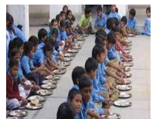
Workshops are held at school level on women's health, nutrition and cleanliness. Panchayats too are ensuring that prenatal and postnatal checkup is conducted among women to check anemia. traditional diet for women and children of tribal areas. The Anganwadi workers and Mitandin in villages are recording the weight and height of children. They are discussing with villagers the importance of nutritional care.

The annual National Nutrition Month is underway in Chhattisgarh from September 1 to create awareness among the public the importance of nutrition and to teach healthy behavior with a balanced diet. The event will end on September 30. The active participation of public representatives, representatives of Panchayati Raj Institutions and local bodies as well as women self-help groups are spreading the message of a balanced diet, an official communication said on Monday. In the current year, the focus is on women and health, child and education, child and nutrition, gender sensitivity, water conservation and management, and