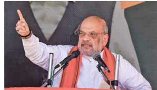
Union Home Minister Amit Shah speaks during a public meeting ahead of J&K Assembly elections, in Kishtwar district, Jammu & Kashmir, Monday

Launching a frontal attack on the pre-poll alliance partners, Congress and the National Conference on the last day of campaigning in Kishtwar, Union Home Minister Amit Shah on Monday appealed to the voters in the region to punish these parties by voting in favour of the BJP as they (Congress-National Conference) have always "nurtured and nourished" terrorism. Shah vowed to "bury terrorism deep into the earth so that it would not be able to rear its head again." Addressing three back-to-back election rallies in the region Shah said there is a clear fight between the Congress-National Conference alliance and the BJP — one wanting to bring back Article 370, and the other committed to stopping it. Shah reiterated the Constitution's Article 370, which gave special status to J and K, is history and will never come back. The Home Minister also paid tributes to all those who have been killed in terror-related incidents, and specially referred to the deaths of BJP leaders Anil Parihar, Ajit Parihar and RSS leader