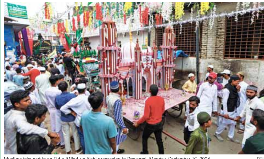
Muslims take part in an Eid-e-Milad-un-Nabi procession in Prayagraj, Monday, September 16, 2024