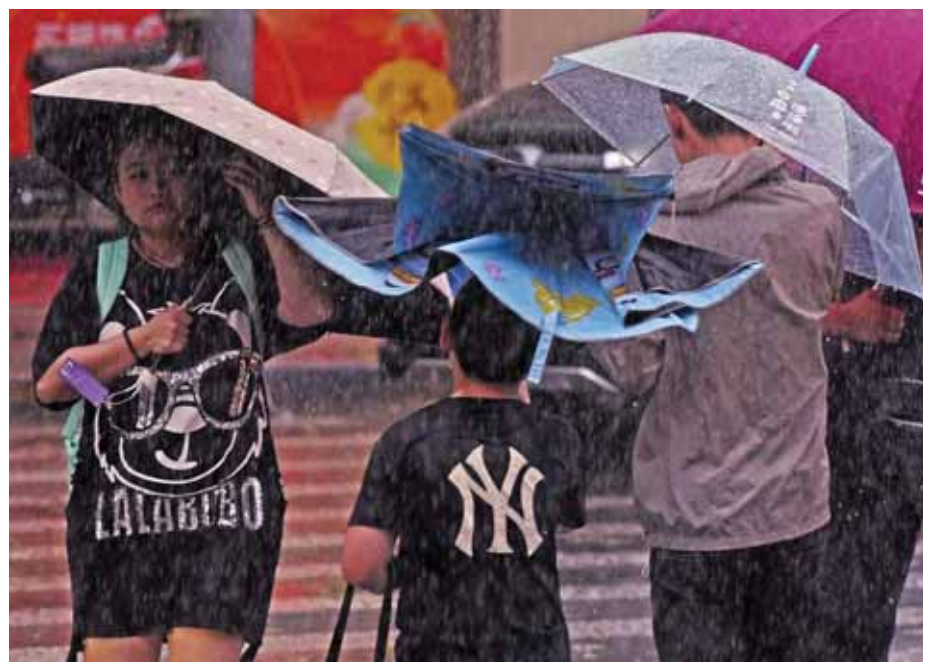
In this photo released by Xinhua News Agency, people brace for rain on a street as Typhoon Bebinca made landfall in Shanghai, China, Monday.

Long-time Jewish Chronicle columnist Jonathan Freedland resigned in protest on Sunday, saying "the latest scandal brings great disgrace on the paper" and that it has "departed from the traditions that built its reputation as the world's oldest Jewish newspaper". "Too often, the JC (Jewish Chronicle) reads like a partisan, ideological instrument, its judgements political rather than journalistic," Freedland wrote on the social media platform X.