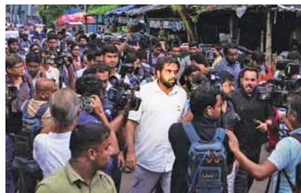
A delegation of junior doctors moves to board a bus from their dhama site near Swasthya Bhawan for a meeting with West Bengal Chief Minister Mamata Banerjee at her Kalighat residence, in Kolkata, West Bengal, Monday