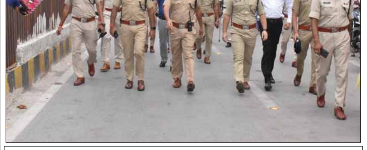
Chhattisgarh Police in Raipur city on Sunday took out a flag march in the main thoroughfare of the city ahead of immersion of idols of Lord Ganesha and Eid-Ul-Milad festival.

diabetes in a randomised controlled cross-over study. The interventions were five and five weeks of ready-made food box deliveries of isocaloric diets in random