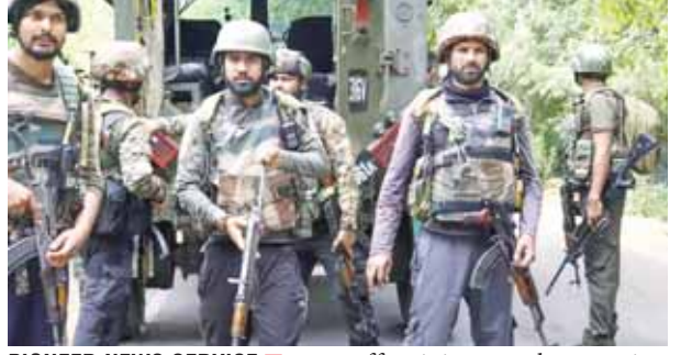
PIONEER NEWS SERVICE JAMMU

Massive crackdown against hiding foreign terrorists in Jammu