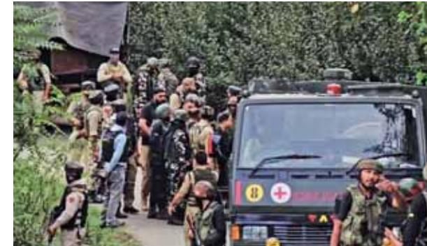
Security personnel during an encounter with militants at Chak Tapper Kreeeri Pattan area, in Baramulla district, Jammu and Kashmir, Saturday

Ahead of the maiden visit of Prime Minister Narendra Modi to address an election rally in the land-locked Doda district on Saturday, two soldiers of the Indian army sacrificed their lives while two others received injuries during a counter-terrorism operation in the Chatroo area of Kishtwar on Friday. In another overnight operation launched in the Kreeeri area of North Kashmir's Baramulla district, three terrorists were gunned down by the joint team of security forces on Saturday. The security forces were able to neutralise a group of hiding terrorists after identifying their exact locations inside the building with the help of drone cameras. With this, the number of terrorists eliminated in the last three anti terrorist operations have gone up to seven. Chinar Corps of the Indian army in a post on X confirmed, "Three terrorists have been neutralised by the security forces in the ongoing Operation. Weapons and warlike stores have been recovered. The Chinarcops has dealt some crippling blows to the terror network in North Kashmir over the past few days with significant recoveries and elimination of terrorists, inspiring confidence and assurance for upcoming events scheduled in the region." Before the day ended, another