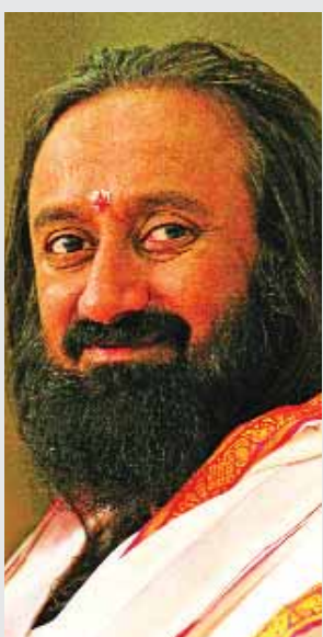
Sri Sri Ravi Shankar Spiritual Guru

Prayer is a vital tool to improve your life. Wherever you can put your effort, put it. Where you cannot, pray for it! Whatever you do, know that a Higher Power has the final say and you can tap that power through your prayers.