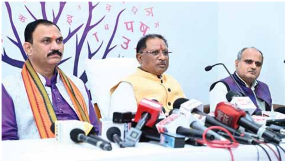
English based education system imposed by Lord Macaulay and the British," he said. Chhattisgarh has decided to completely follow

The Chhattisgarh government has decided to impart medical education in government medical colleges across the state in Hindi too. This was decided by Chief Minister Vishnu Deo Sai on the occasion of Hindi Day on Saturday. Briefing newsmen, Sai said the decision will help the students of Hindi medium coming from rural background. On the occasion of Hindi Day we have decided to introduce Hindi medium education of medical science in the state instead of the