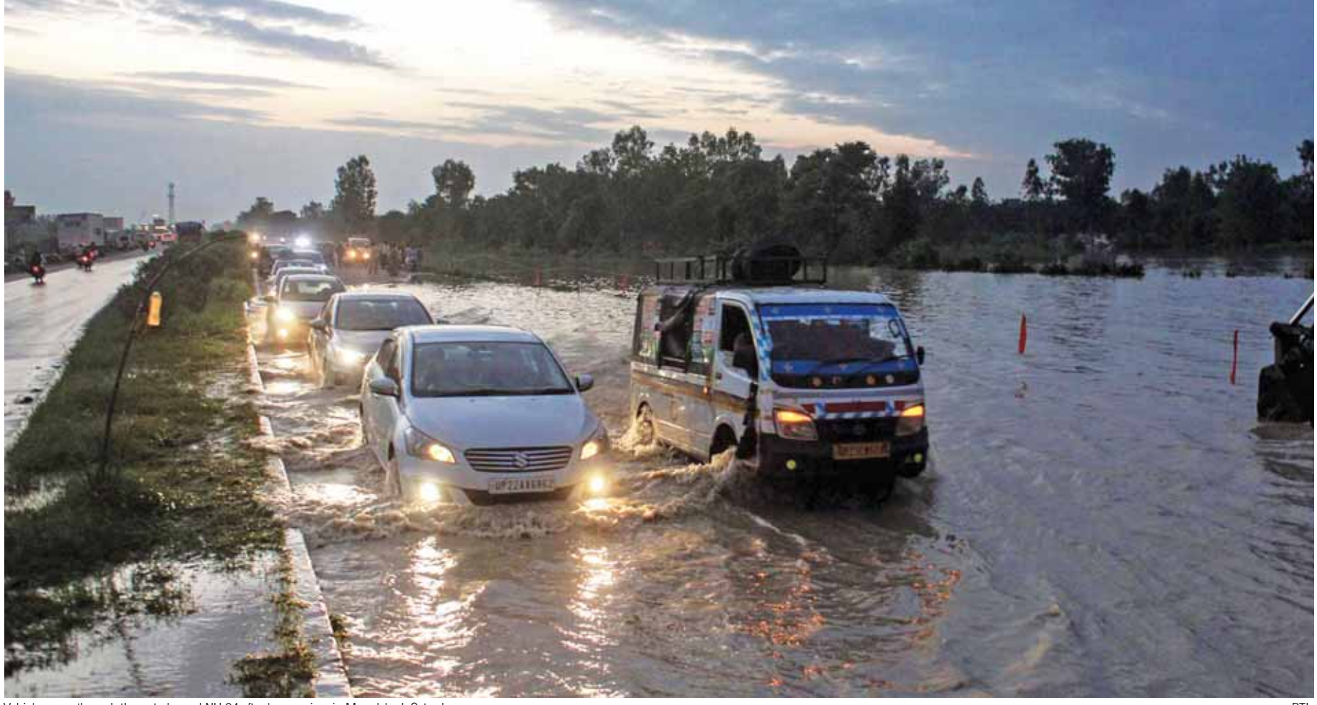
Vehicles pass through the waterlogged NH 24 after heavy rains, in Moradabad, Saturday