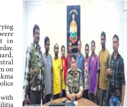
four gelatin rods, 200 gm of gunpowder, four detonators and Maoist-related materials from them.