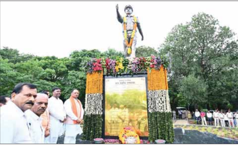
STAFF REPORTER RAIPUR

To mark the occasion of the National Forest Martyrs Day, Chhattisgarh Chief Minister Vishnu Deo Sai on Wednesday unveiled a Forest Martyrs memorial at Rajiv Smriti Van in Raipur.