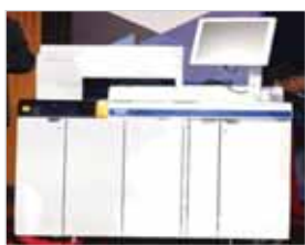
stages of Alzheimer's.

One of the key advantages of early detection is the ability to begin treatment when the brain is still relatively healthy. Current medications, while not a cure, work best when started early. They can help manage symptoms like memory loss and confusion. Additionally, lifestyle changes such as regular exercise, cognitive therapy, and a healthy diet can have a more significant impact when implemented during the early