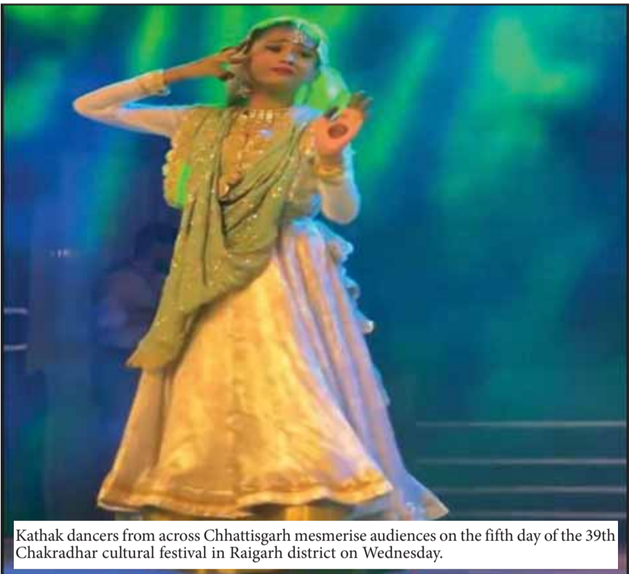
Kathak dancers from across Chhattisgarh mesmerise audiences on the fifth day of the 39th Chakradhar cultural festival in Raigarh district on Wednesday.

deaf from birth. Both families are financially weak, and could not afford the treatment, he said. The operation on both children was performed free of charge under this scheme. They are recovering well.