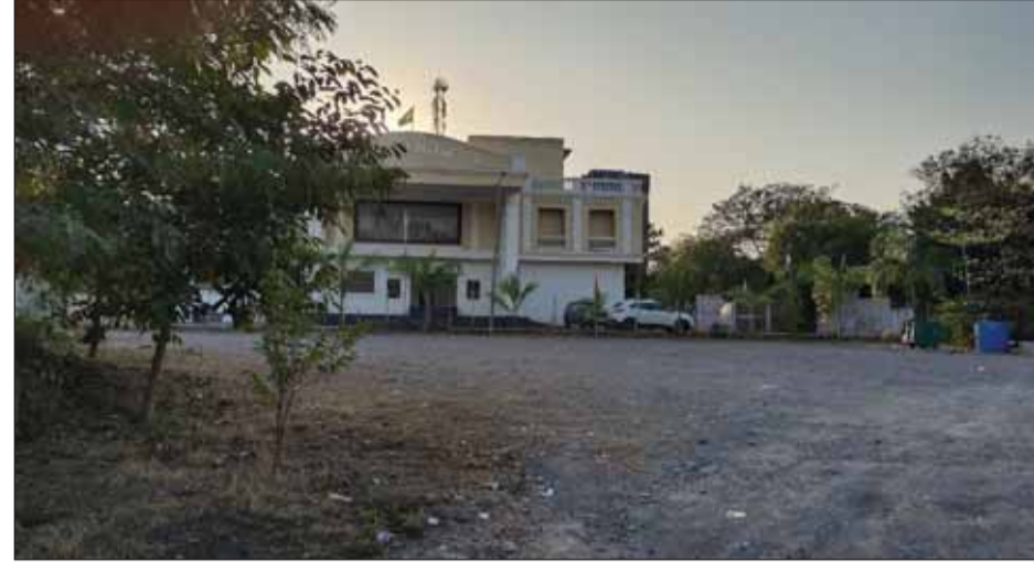
STAFF REPORTER RAIPUR

Deteriorated law and order situation in the state