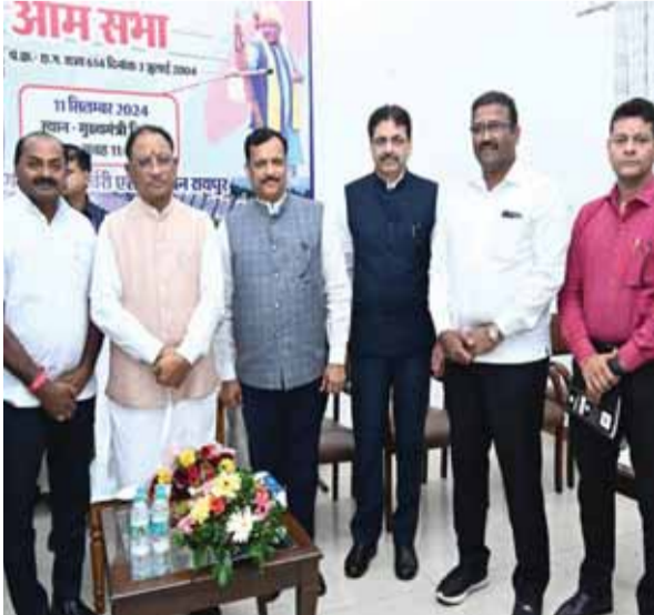
STAFF REPORTER RAIPUR

The Chief Minister said he has had the opportunity to participate in several events organized by the Association by accompanying Arjun Munda, the President of the National Archery Association. He commended the Association's diligent efforts in refining the skills of Chhattisgarh's archers, leading to their outstanding performances in national and other competitions.