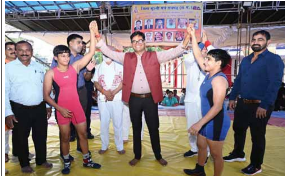
STAFF REPORTER RAIGARH

Chhattisgarh Finance Minister O.P. Choudhary launched the All India Wrestling Competition at the 39th Chakradhar cultural festival in Raigarh district on Wednesday. A total of 275 wrestlers from across the country are participating.