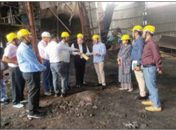
STAFF REPORTER AMBIKAPUR

Four labourers were killed and three others injured in the incident that took place last Sunday. Meanwhile, following instructions from the Chief Minister, the Surguja Collector constituted an investigation team to probe the incident.