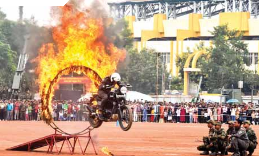
Army jawans perform stunts during the closing ceremony of 'Know Your Army' programme in Ranchi