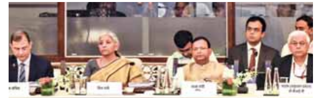
Union Finance Minister Nirmala Sitharaman with MoS Pankaj Chaudhary and others during the 54th meeting of the GST Council, in New Delhi

Union Finance Minister Nirmala Sitharaman on Monday said the GST Council has decided to reduce the rates on some cancer drugs to five percent from 12 percent. The Council also reduced the rate on namkeen to 12 per cent from 18 per cent, she said, adding that the Council will take a call on reduction in rate on health insurance at the next meeting in November. Sitharaman, who chaired the 54th meeting of the GST