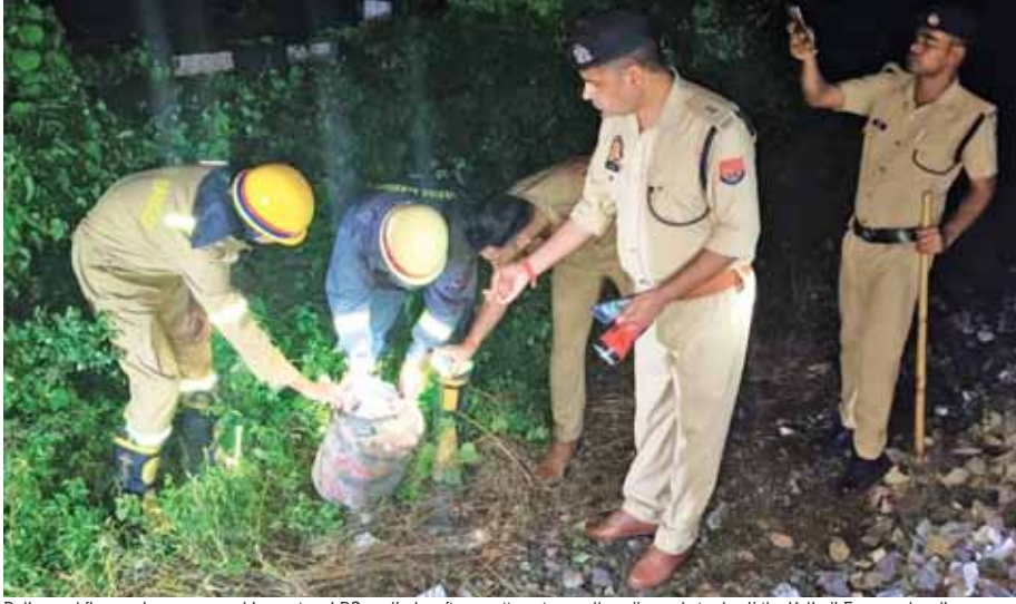
Police and fire services personnel inspect an LPG cylinder after an attempt was allegedly made to derail the Kalindi Express, heading towards Bhiwani from Prayagraj, by placing the LPG cylinder on the tracks, in the Shivrajpur area in Kanpur, on Sunday night, September 8, 2024. Due to being hit by the train, the cylinder was thrown away from the tracks, according to officials.