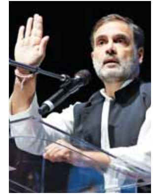
LoP in Lok Sabha and Congress MP Rahul Gandhi addresses the Indian Diaspora, at Dallas in Texas, USA