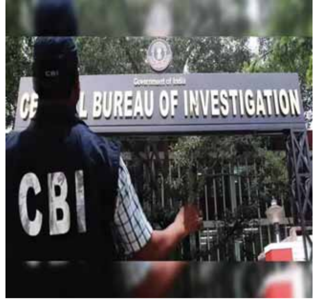
residential plots. He allegedly indulged in corrupt activities and amassed huge assets disproportionate to his known source of income.