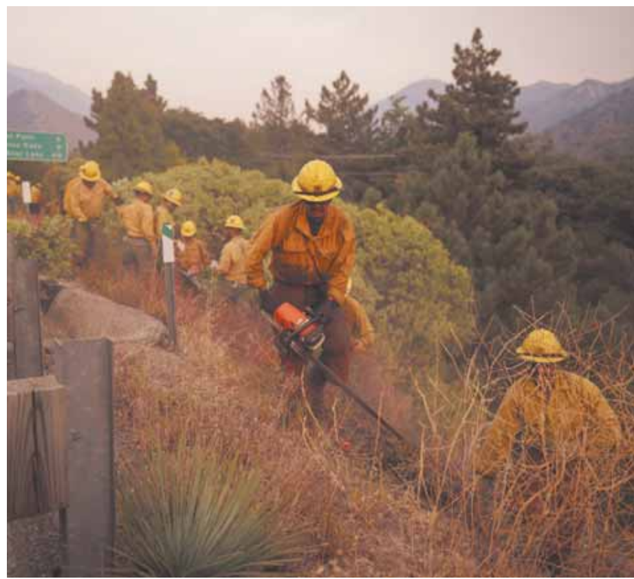
Firefighters work against the advancing Line Fire in Mentone, Calif. on Sunday.

Ambassador Zalmay Rassoul wrote on the social network X that the embassy would shut its doors on Sept. 27 "at the official request of the host country." Neither the UK government nor the ambassador said what would happen about the embassy's staff. Diplomats who served under Afghanistan's former Western-backed government were left in limbo when the Taliban seized Kabul and returned to power in August 2021. Many embassies in Europe and beyond have continued to operate, but have been accused by Kabul of failing to cooperate with the government. Afghanistan has sent Taliban-approved diplomats to some countries, including Pakistan and China.