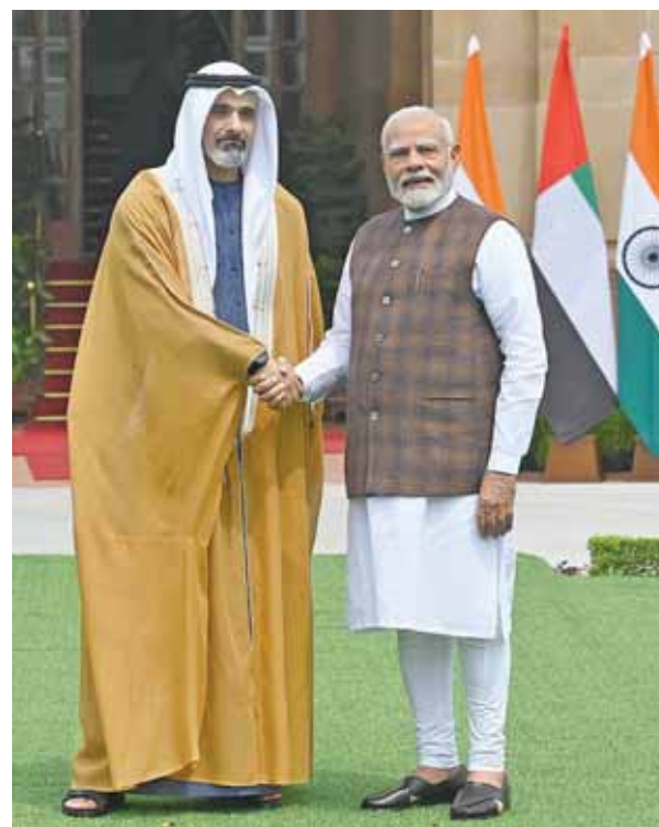
Prime Minister Narendra Modi meets Abu Dhabi's Crown Prince Sheikh Khaled bin Mohamed bin Zayed Al Nahyan at the Hyderabad House, in New Delhi, Monday

After holding talks with Modi, the visiting leader paid tributes to Mahatma Gandhi at his memorial Rajghat. An Agreement for long-term LNG supply between Abu Dhabi National Oil Company (ADNOC) and Indian Oil Corporation Ltd and another agreement for Abu Dhabi Strategic Petroleum Reserve Ltd (ISPRL) are among the