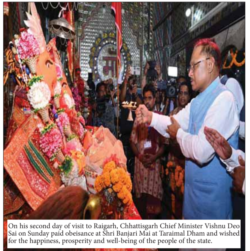
On his second day of visit to Raigarh, Chhattisgarh Chief Minister Vishnu Deo Sai on Sunday paid obeisance at Shri Banjari Mai at Taraimal Dham and wished for the happiness, prosperity and well-being of the people of the state.

The team recovered barrel grenade launcher (BGL) rifles, a .12 bore gun, two .315 bore rifles, Maoist uniforms, gelatin rods, detonators and other explosives.