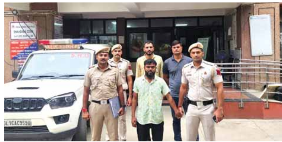
A 30-year-old man was arrested after four men allegedly opened fire outside a night club in Delhi's Shahdara