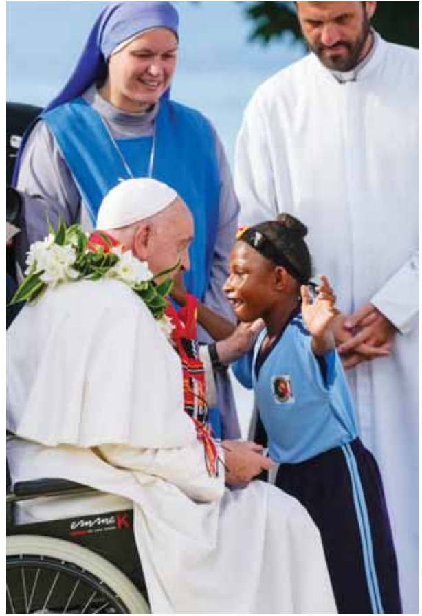
Pope Francis is hugged by a blind pupil of the Holy Trinity Humanistic School in Baro, near Vanimo, Papua New Guinea, on Sunday

Doing so, he said, would help to "drive out fear, superstition and magic from people's hearts, to put an end to destructive behaviours such as violence, infidelity, exploitation, alcohol and drug abuse, evils which imprison and take away the happiness of so many of our brothers and sisters". It was a reference to the tribal violence over land and other disputes that have long characterised the country's culture