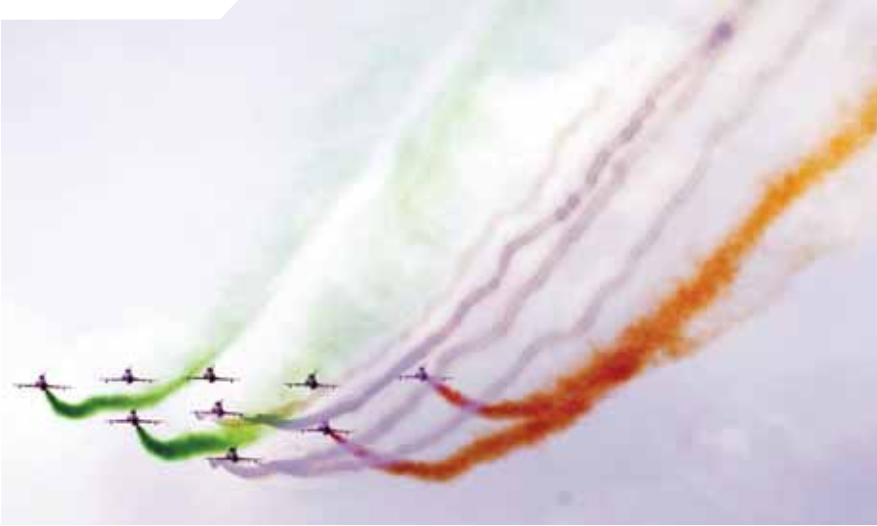
Indian Air Force aerobatics team Surya Kiran performs at exercise 'Tarang Shakti,' in Jodhpur