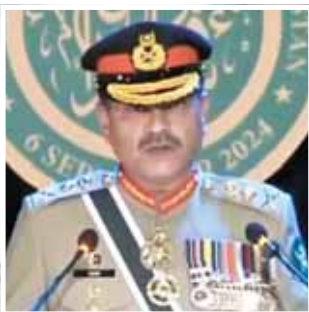
Pakistan Army Chief General Asim Munir admits Pak army's role in Kargil war, says several Pak soldiers died in the 1999 Kargil War against India