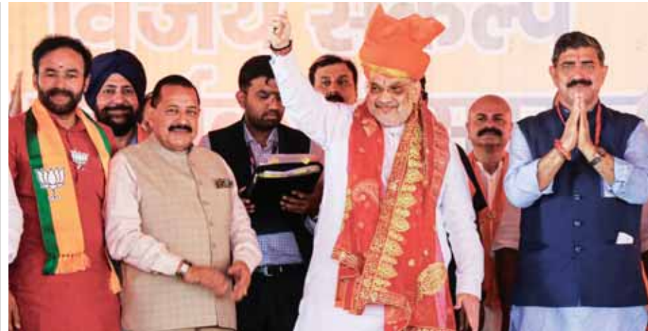
Union Home Minister Amit Shah during a party worker meet ahead of Jammu and Kashmir Assembly elections, in Jammu, Saturday, Sept. 7, 2024. MoS Jitendra Singh was also seen