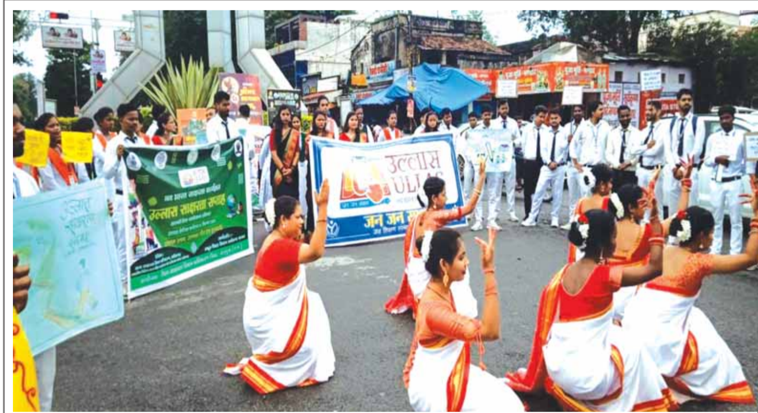
College girls performing a street play to make people aware about literacy under the 'Ullas' programme of the New Education Policy. The weeklong event, underway across Chhattisgarh, will end on Sunday.

The total number of Digi Yatra-enabled airports will now be 24.