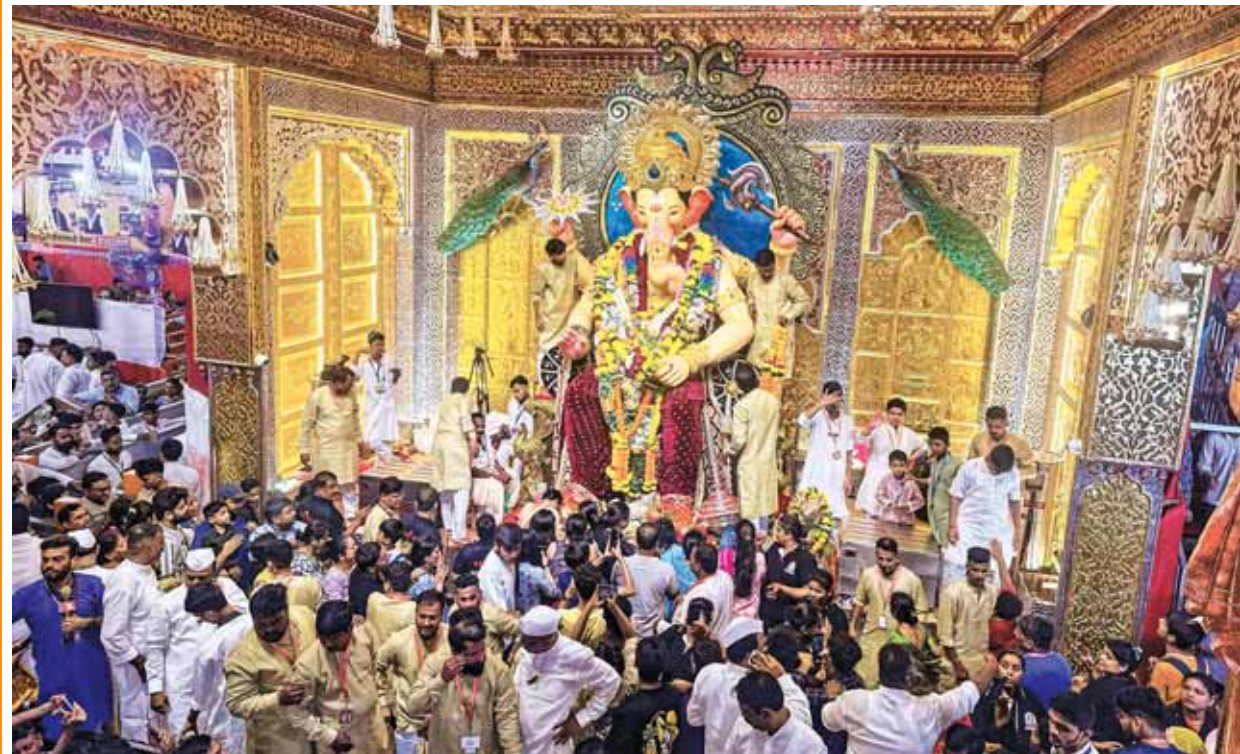
Mumbai: Devotees offer prayers to Lord Ganesh at the Lalbaugcha Raja on Ganesh Chaturthi festival, in Mumbai, Saturday