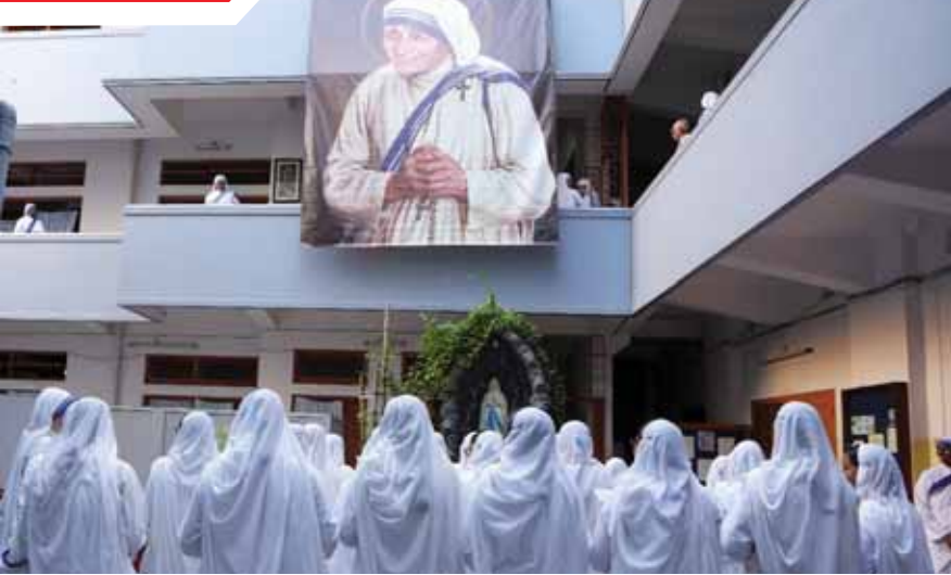
Nuns offer prayers during observance of the death anniversary of Mother Teresa, in Kolkata