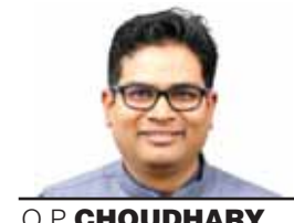
O P CHOUDHARY

(The writer is the Minister of Finance of Government of Chhattisgarh; views are personal)