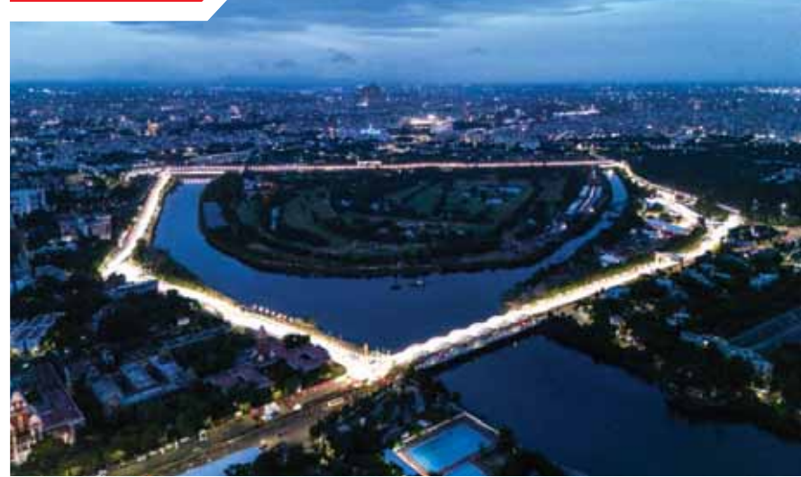
An aerial view of the illuminated Chennai Street Circuit during the Formula 4 Street Car Race, in Chennai