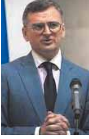
That Russia can achieve its goals through a war of attrition against Ukrainian forces and by outlasting Western support for Kyiv, Zelenskyy is also keeping in mind the US presidential election in November, which could bring a shift in key

countered months of grim news from the front line in eastern Ukraine. The incursion's ultimate goals are unclear, though Zelenskyy says Ukraine wants to create a buffer zone there that would prevent cross-border Russian attacks. Russian President Vladimir Putin remains bent on pushing his army deeper into eastern Ukraine, meanwhile. Russia's onslaught in Donetsk, where Ukraine is short of troops and air defences, and long-range missile strikes that repeatedly hit civilian areas of Ukraine signal that Putin will remain uncompromising and unrelenting in his efforts to crush Ukrainian resistance. The Institute for the Study of War, a Washington think tank, said late Tuesday that Putin believes Russia "can slowly and indefinitely subsume Ukraine through grinding advances and