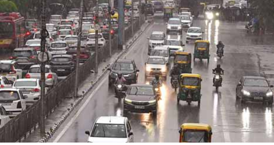
Traffic jam at ITO in New Delhi on Wednesday after rain

Heavy rain lashed parts of Delhi-NCR, including Gurugram and Noida, on Wednesday afternoon leading to severe waterlogging on streets, roads and traffic congestion in several places in the Capital city. Huge traffic snarls were seen in parts of Delhi, including in South, Central, North, New Delhi and parts of Noida and Gurugram. The India Meteorological Department (IMD) has issued a yellow alert for the city. A yellow alert denotes bad weather and the possibility of the weather conditions worsening and disrupting daily life. Heavy waterlogging in various parts of Delhi left arterial junctions choked amid the traffic police issuing advisory to the commuters who were caught in prolonged traffic jams. In the past 24 hours till 8 am on Wednesday, city's primary weather station Safdarjung received 0.8 mm of rainfall, Lodi road 1.4 mm of rainfall, Narela 1.6 mm of rainfall, Palam 0.3 mm of rainfall, Ridge 0.8 mm of rainfall, Pitampura one mm of rainfall, Pusa 0.5 mm of rainfall and Mayur Vihar's Salwan public school 0.5 mm of rainfall.