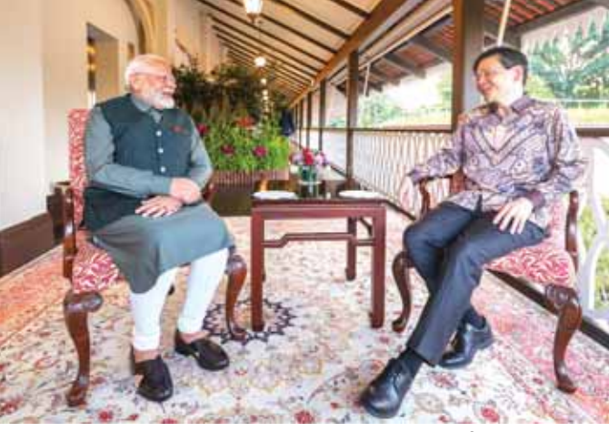
Prime Minister Narendra Modi during a meeting with Prime Minister of Singapore Lawrence Wong, in Singapore, on Wednesday