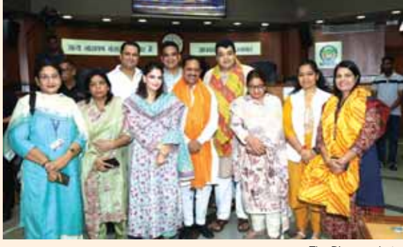
The Pioneer photo