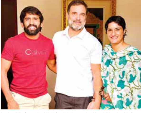
Leader of the Opposition Rahul Gandhi with wrestlers Vinesh Phogat and Bajrang Punia in New Delhi