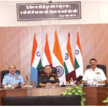
The Chief of Defence Staff General Anil Chauhan attends First Joint Commanders' Conference, in Lucknow

India's top military commanders on Wednesday held extensive deliberations in Lucknow on the Government's ambitious plans to create 'Integrated Theatre Commands' and assessed overall national security challenges including the ones along the frontiers with China and Pakistan. Chaired by the Chief of Defence Staff (CDS), General Anil Chauhan, with chiefs of the Army, Navy and the Air Force and other top military officers in attendance, the deliberations primarily focused on setting up of joint command and control centres and logistics nodes, on the inaugural day of the two-day maiden joint commanders conference, being held in Lucknow, officials said. In his opening address, General Chauhan stressed the need for operational preparedness to meet emerging challenges, underscoring the need of modernisation to stay combat-ready and relevant and achieve strategic autonomy. The theme of the maiden joint commanders' conference is 'Sashakt and Surakshit Bharat: Transforming Armed Forces'. The deliberations on ensuring synergy among the armed forces on various aspects including financial planning, joint logistics infrastructure are taking place amid the Government's ambitious plans to roll out theatre commands. Under the theaterisation model, the