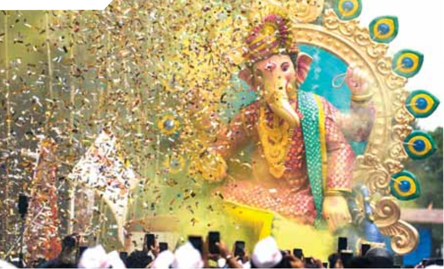
Devotees carry an idol of Lord Ganesha ahead of the Ganesh Chaturthi festival, in Mumbai