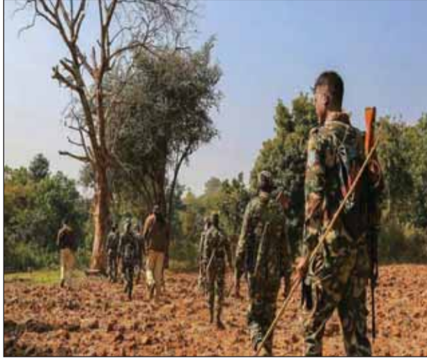
The intermittent exchange of fire lasted for a long duration following which the bodies of the nine clad in Maoist uniform were recovered.

The District Reserve Guard, Bastar Fighters and the Central Reserve Police Force (CRPF) launched the operation against Maoists