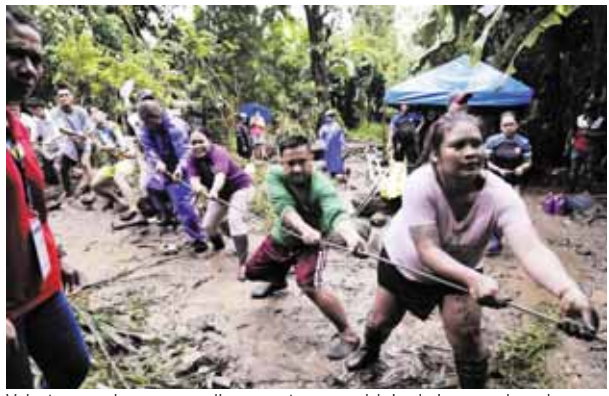
Volunteers and rescuers pull a rope to move debris during search and rescue operations for missing residents after a landslide caused by Tropical Storm Yagi, locally called Enteng, hit their village at San Luis, Antipolo city, Rizal province, Philippines on Tuesday.

It was forecast to strengthen into a typhoon as it barrels north-westward over the sea toward southern China. Storm warnings remained in most northern Philippine provinces, where residents were warned of the lingering danger