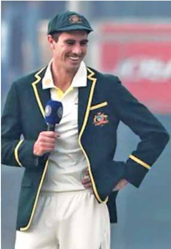
Senior batter Steve Smith agreed with the skipper and said it will be a "big summer" for Australia against a "well-balanced" Indian team.

Australian captain Pat Cummins is looking at the upcoming five-match rubber against India as a chance to "make amends" for the successive Test series defeats at home against their fierce rivals.