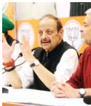
PDP alliance. He is perhaps being brought again for the same purpose".