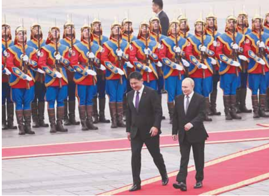
Russian President Vladimir Putin, right, walks with Mongolian President Ukhnaagiin Khurelsukh, left, during welcoming ceremony at Sukhbaatar Square in Ulaanbaatar, Mongolia, Tuesday.

A spokesperson for Putin said last week that the Kremlin wasn't worried. The warrant puts the Mongolian government in a difficult position. After decades under communism with close ties to the Soviet Union, it transitioned to democracy in the 1990s and has built relations with the United States, Japan and other new partners. But it remains economically dependent on its two much larger and more powerful neighbours, Russia and China. Russia supplies the landlocked country with most of its fuel and a sizeable