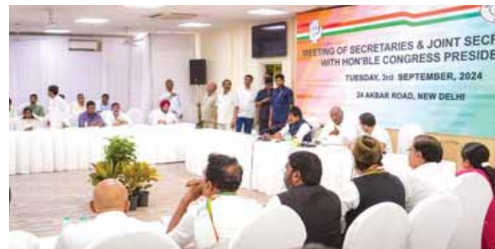
Leader of Opposition in Lok Sabha and Congress MP Rahul Gandhi with party president Mallikarjun Kharge and party MP KC Venugopal during meeting with party secretaries and joint secretaries, in New Delhi, on Tuesday

Ironically, the State Congress leaders in Haryana have rejected the possibility of any alliance with AAP in the State. Recently, senior