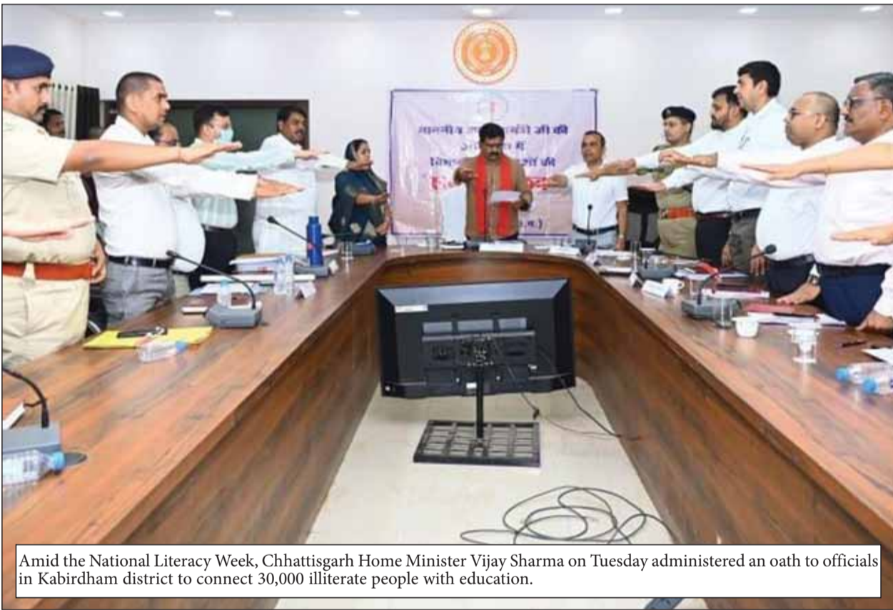
Amid the National Literacy Week, Chhattisgarh Home Minister Vijay Sharma on Tuesday administered an oath to officials in Kabirdham district to connect 30,000 illiterate people with education.

Yadav was booked for promoting enmity between different groups, criminal conspiracy, rioting, obstructing public servants from performing duty and assault.