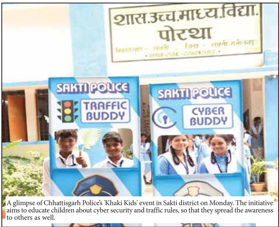
A glimpse of Chhattisgarh Police's 'Khaki Kids' event in Sakti district on Monday. The initiative aims to educate children about cyber security and traffic rules, so that they spread the awareness to others as well.

fight for the protection of our sisters and daughters. We will force the government to protect women'.