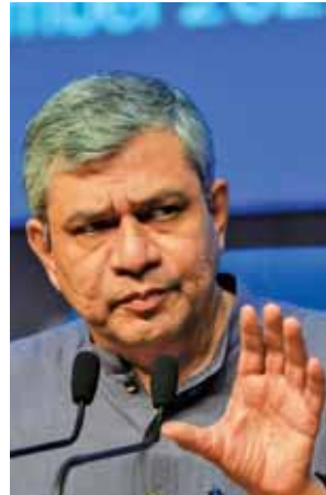
Union Minister Ashwini Vaishnav briefs the media over cabinet decisions, in New Delhi, Monday

The emphasis of these programmes would be on research & education, climate resilience, natural resource management and digitisation in the agriculture sector along with emphasis on growth of horticulture and livestock sectors. Addressing a press conference after the Union Cabinet meeting, Union Minister Ashwini Vaishnav announced that the Union Cabinet, chaired by Prime Minister Narendra Modi, approved seven schemes to improve farmers' lives and increase their incomes at a total outlay of ₹13,966 crore. The Cabinet has approved crop science for food and nutritional security programmes with a total outlay ₹3,979 crore. In this programme, six pillars have been included in the programme with a focus on