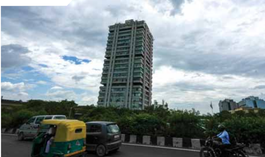
Clouds hover over the Delhi as vehicles pass by the Vikas Minar, in New Delhi