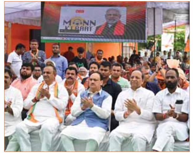
Union Minister and BJP National President JP Nadda, and others listen to Prime Minister Narendra Modi's 'Mann Ki Baat' radio programme, in New Delhi, Sunday

amend are the Government of National Capital Territory of Delhi Act-1991, the Government of Union Territories Act-1963 and the Jammu and Kashmir Reorganisation Act-2019. The proposed bill will be an ordinary legislation not requiring a change in the Constitution and will also not need ratification by the states. The high-level committee had proposed amendments to three Articles, insertion of 12 new sub-clauses in the existing articles and tweaking three laws related to Union Territories having legislative assemblies. The total number of amendments and new insertions stands at 18. In its report submitted to the government in March, just before the general election was announced, the panel recommended implementing "one nation, one election" in two phases. It suggested simultaneous polls for the Lok Sabha and state assemblies in the first phase and elections for local bodies like panchayats and municipal bodies within 100 days of the general election in the second phase. It also recommended a common electoral roll, which would need coordination between the Election Commission and State Election Commissions.