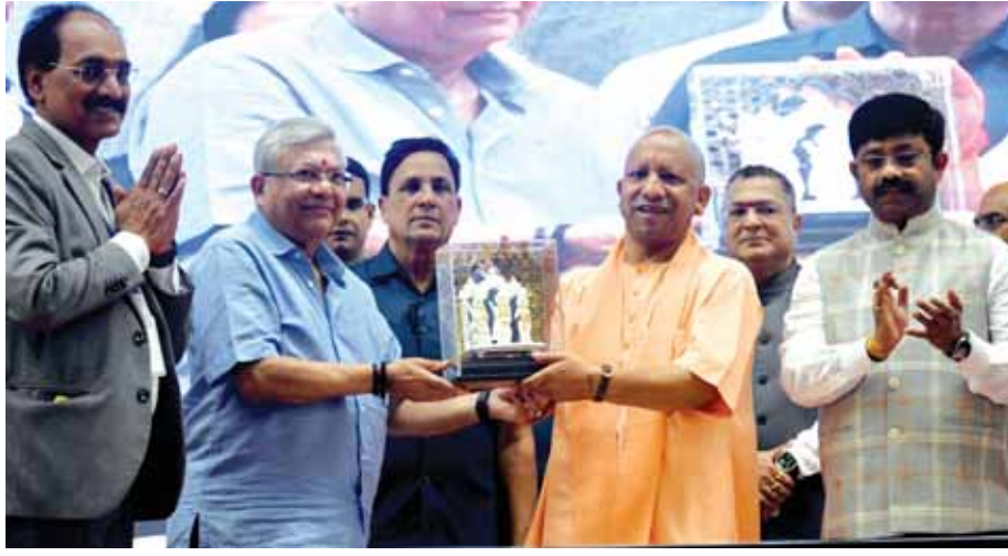
Uttar Pradesh Chief Minister Yogi Adityanath on the occasion of the inauguration of soft drink bottling and dairy product plant established by Varun Beverages Limited in Gorakhpur on Sunday