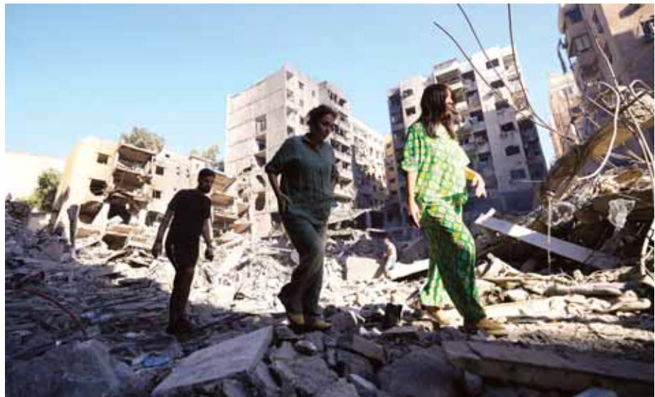
People check the site of the assassination of Hezbollah leader Hassan Nasrallah in Beirut's southern suburbs, Sunday