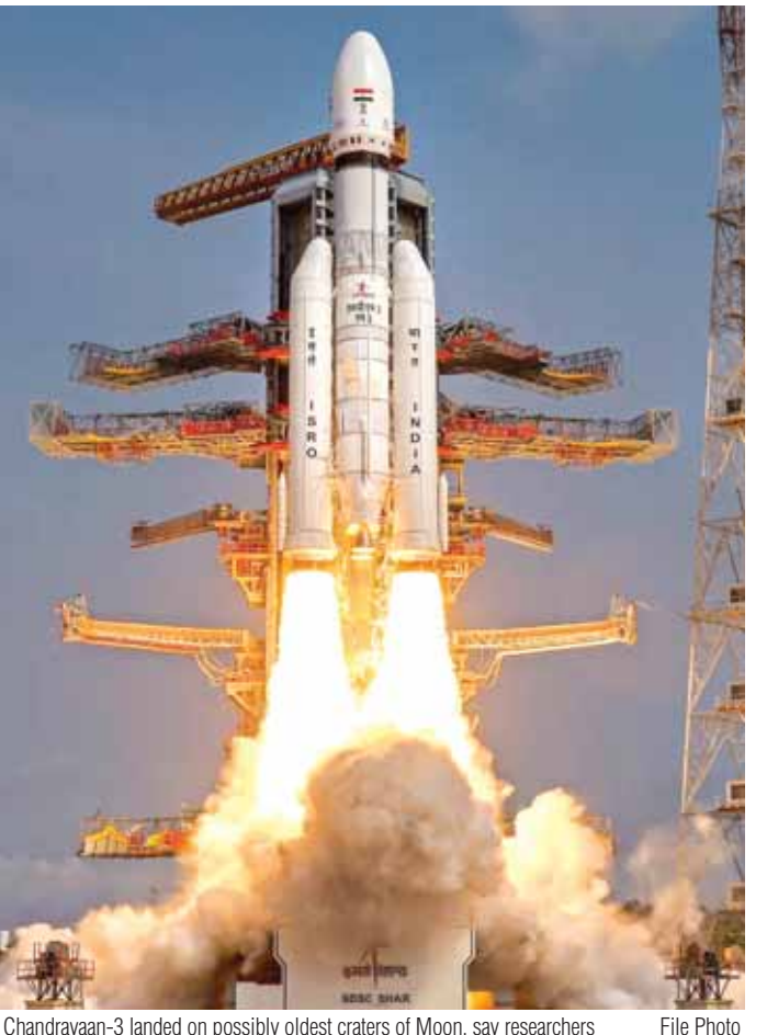
Chandrayaan-3 landed on possibly oldest craters of Moon, say researchers File Photo