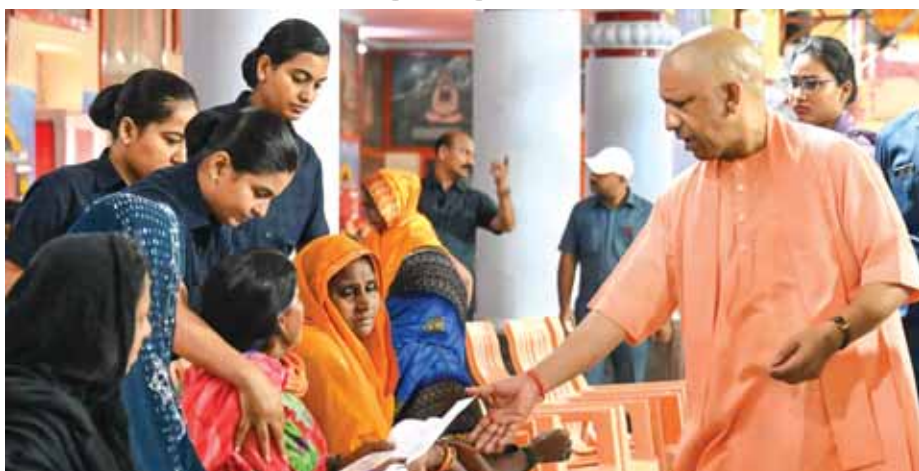
Chief Minister Yogi Adityanath during 'Janta Darshan' programme in Gorakhpur on Sunday