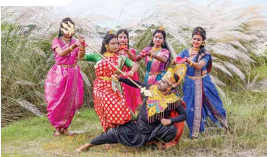
Artists perform 'Mahishasur Mardini' act ahead of Durga Puja festival, in Nadia district