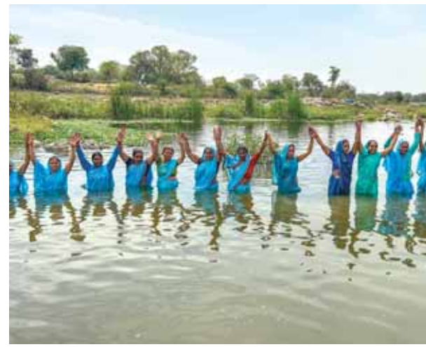
Members of 'Jal Saheli' group pose for photos after reviving Ghurari river at Simrawari village in Jhansi.

In his monthly radio address 'Mann Ki Baat' on Sunday, Prime Minister Narendra Modi once again highlighted Uttar Pradesh, specifically mentioning the remarkable water conservation efforts in Jhansi district. He praised the women of Jhansi for breathing new life into the Ghurari river and preventing water wastage, showcasing their commitment to addressing the country's water crisis. Chief Minister Yogi Adityanath thanked Prime Minister Modi for recognising the efforts of the women from self-help groups (SHGs) in Jhansi, particularly in the water-scarce Bundelkhand region. Modi acknowledged the extraordinary work of these SHG women, who, as 'Jal Sahelis', led a campaign to revive the dying Ghurari river. He marvelled at their initiative to construct a check dam using sand-filled sacks in order to stop rainwater from going to waste and replenishing the river. The initiative successfully alleviated the region's water scarcity problem, bringing joy to the community. Modi emphasised that where 'Nari Shakti' (women's power) enhances 'Jal Shakti' (water power), 'Jal Shakti' in turn strengthens 'Nari Shakti'.