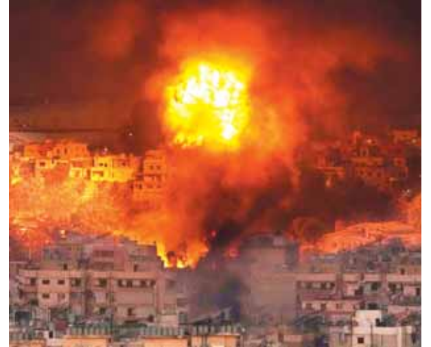
Flames rise after an Israeli airstrike in the southern suburbs of Beirut, Lebanon, Saturday