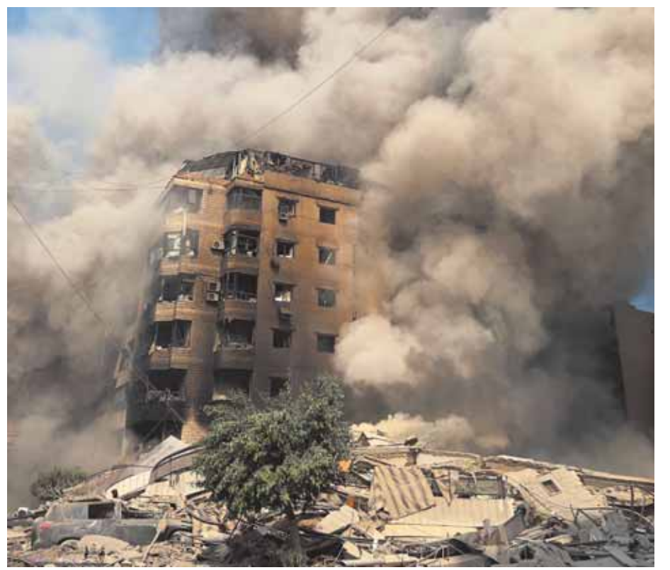
Smoke rises as a building collapses in Beirut's southern suburbs on Saturday.