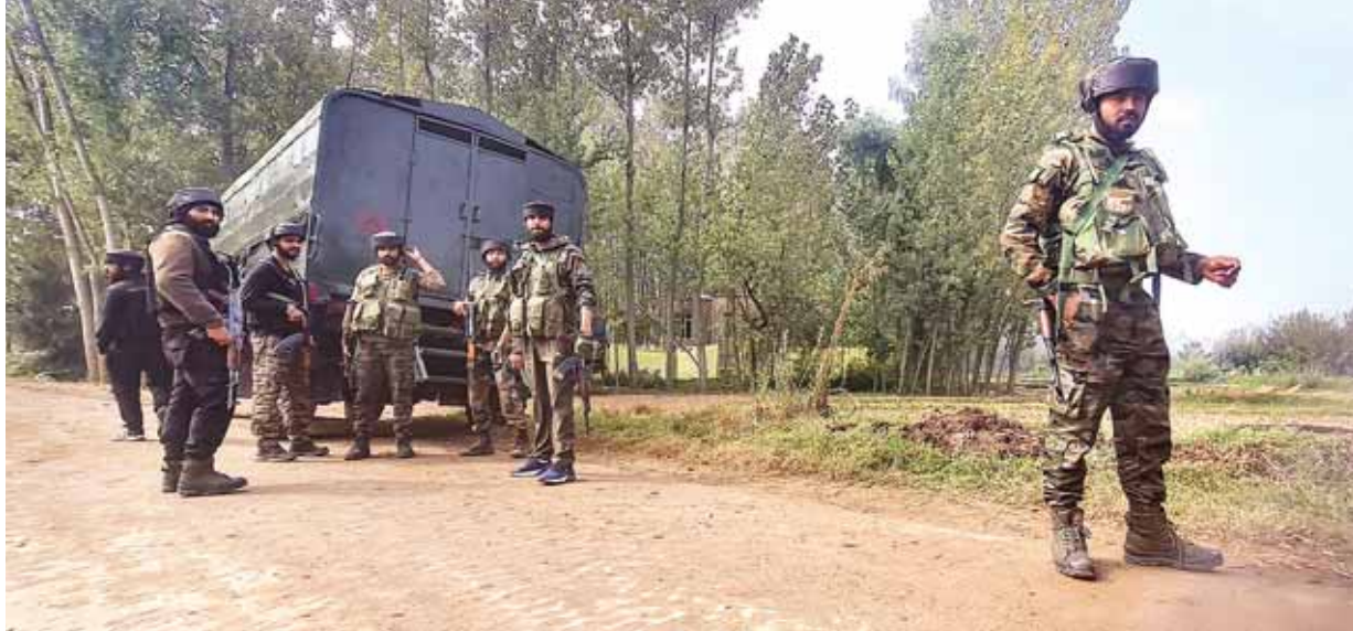
Security personnel stand guard after an encounter broke out between terrorists and security forces during cordon and search operation at Adigam village, in Kulgam district, Saturday