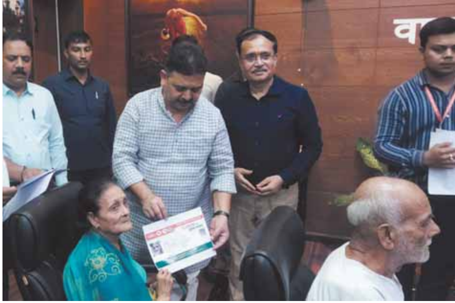
UP Minister Ravindra Jaiswal giving Ayushman card to woman in Varanasi on Saturday

Speaking on the occasion, the minister said the Central and state governments were constantly making efforts for the better health of all. "All the people with low income are being given the benefit of various schemes. The prime minister has been adding people to the Ayushman Bharat scheme from time to time and providing them benefits. Labour card holders and Antyodaya card holders are being given benefits. Similarly, people