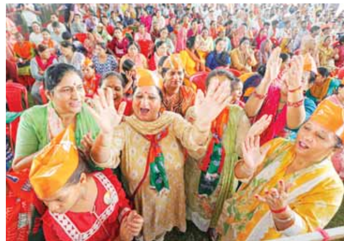
Supporters during a public meeting to be addressed by Prime Minister Narendra Modi amid the ongoing Jammu and Kashmir Assembly elections, at the Maulana Azad Stadium, in Jammu, Saturday

Prime Minister Narendra Modi in his whirlwind rallies in polling states exuded confidence to retain BJP in Haryana and form first Government in Jammu and Kashmir. Seeking a decisive mandate from the people of the Jammu region ahead of the last round of polling on October 1, declared that BJP's first Government with full majority will be formed in Jammu and Kashmir. While speaking in Haryana, Modi said stability is a far-fetched thing for the Congress because of its infighting and now everyone in the party is jostling among themselves to become Chief Minister in Haryana with "Bapu" (Bhupinder Singh Hooda) and "Beta" (Deepender Hooda) also the contenders. Stakes are high for the BJP in the third and final round of polling in Jammu and Kashmir. The party is locked in a straight fight with the Congress on the majority of seats. A handful of independent candidates in the fray are also giving a tough competition to the BJP. The party's performance in this crucial phase is going to make or mar the chances of Government formation. BJP won 25 Assembly seats in the 2014 Assembly polls, the highest-ever tally so far. This time, the party is hoping to gain an absolute majority. Out of 40 Assembly segments, voting is scheduled to take place on the 24 seats spread across the four districts of Jammu, Samba, Kathua,