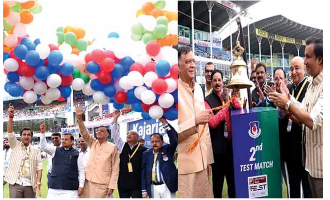
(Left) Speaker Legislative Assembly Uttar Pradesh Satish Mahana inaugurating the India-Bangladesh test match by releasing balloons and (right) ringing the bell at Green Park stadium in Kanpur on Friday.