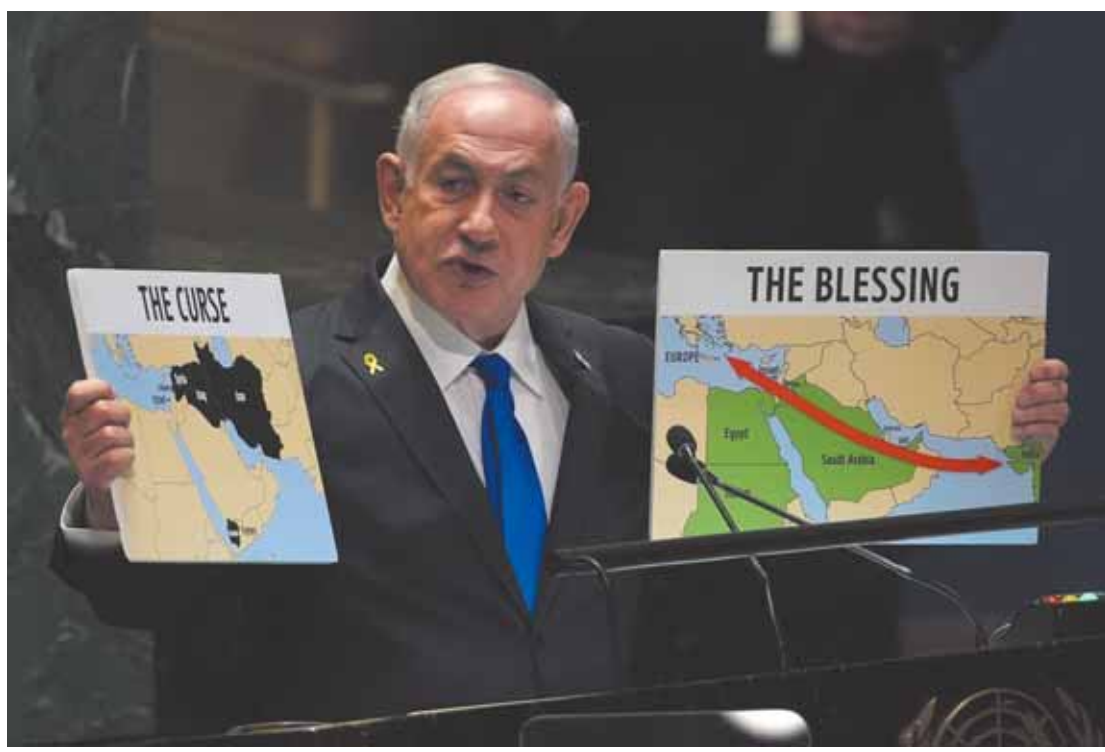
Prime Minister of Israel Benjamin Netanyahu hold signs as he addresses the 79th session of the United Nations General Assembly on Friday.

and set the record straight." He insisted that Israel wanted peace but said of Iran: "If you strike us, we will strike you." He once again blamed Iran for being behind many of the problems in the region. "For too long, the world has appeased Iran," Netanyahu said. "That appeasement must end." Israel's campaign in Gaza has killed more than 41,500 Palestinians and wounded more than 96,000 others,