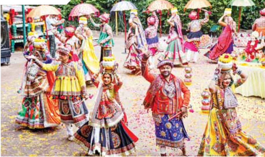
Performers dressed in traditional attire rehearse for Garba, ahead of Navratri festival, in Ahmedabad