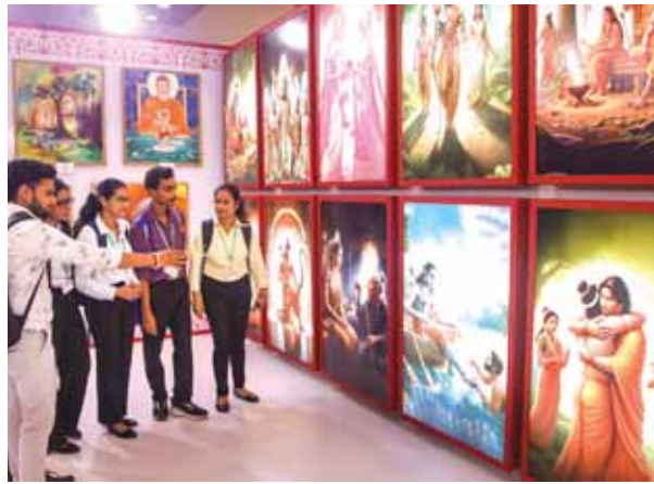
People visit the second edition of the Uttar Pradesh International Trade Show in Greater Noida on Friday.