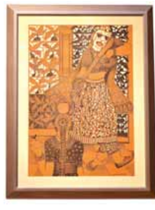
Golden Ducks, both of which explored this abrupt transformation in a humorous

Among the standout works in the exhibition was 1947 Classmates , which, along with pieces like My New Ray-Ban , prompted both laughter and introspection on the impact of materialism on self-image. Guests were particularly captivated by My New Ray-Ban and New Billionaire With Her