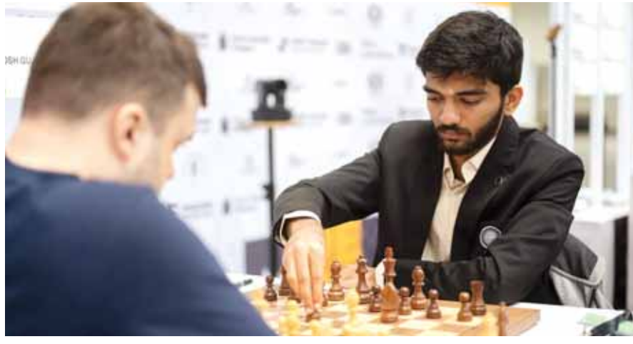
Gukesh D of India, during the final round of the 45th Chess Olympiad in Budapest, Hungary, Sunday

day of the event. The Indian team for the open category included Gukesh, Erigaisi, Praggnanandhaa R, Vidit Gujrathi, Pentala Harikrishna and Srinath Narayanan(Captain). The team who had an unbeaten streak in the tournament with incredible performances against Fabiano Caruana of United States(2.5-1.5) on Saturday day before the final round of the event which gave confirmation of gold medal. India despite having 19 points on the tally(table topper) only China is right after the India in points tally with 17 points which gave the medal confirmation, if somehow