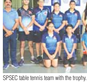
SPSEC table tennis team with the trophy.

The Sir Padampat Singhania Education Centre (SPSEC) achieved a remarkable triumph at the CBSE Cluster-IV Table Tennis Tournament organised at Gurukul World School, Farukhabad, and qualified for the national championship. The tournament saw fierce competition from 28 reputed schools. The team of SPSEC displayed exceptional skill and determination, clinching seven gold medals and one bronze medal. Their stellar performance has paved the way for 15 students to compete at the national level in various cate-