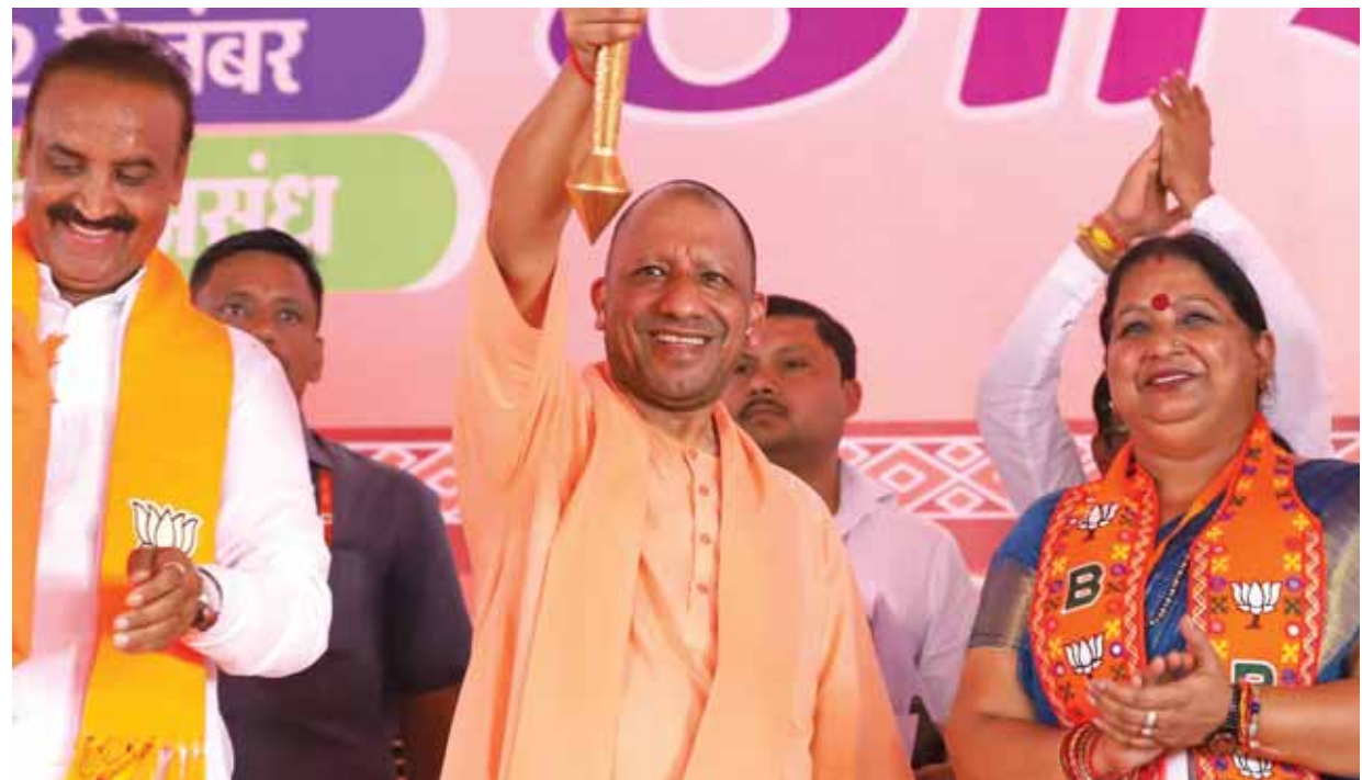
Uttar Pradesh Chief Minister Yogi Adityanath during an election rally ahead of Haryana Assembly polls in Karnal on Sunday

Yogi highlighted the completion of the Ram Temple in Ayodhya. He said that the 500-year wait was over with the consecration ceremony, while taking a swipe at Congress and INLD for their opposition to the name of Lord Ram. Yogi questioned why, after India gained independence in 1947, then Prime Minister Jawaharlal Nehru did not take the opportunity to build the Ram temple, noting that there was little controversy at the time. He blamed parties "wearing the cloak of secularism" for delaying the construction of Ram temple and attempting to undermine India's faith and heritage. He praised the BJP for resolving the long-standing issue and successfully building the temple. Yogi accused Congress and INLD of focusing on family politics, claiming they insulted Lord Ram, Lord Krishna and Dr Bhimrao Ambedkar. He added that when these parties are in power, they harm Scheduled Castes, undermine security and incite riots. He highlighted that, despite ruling for many years, Congress named development projects after their own ancestors instead of honouring great figures like Maharishi Valmiki, Sant Ravidas and Dr Bhimrao Ambedkar. He remarked that in Congress, "the child was born later, but airports and stadiums were named after him first." Criticising the INLD, Yogi stated that the party holds no relevance outside Haryana and voting for them is useless. He also took a swipe at the governance of Congress and INLD, claiming rampant corruption during their tenures, including