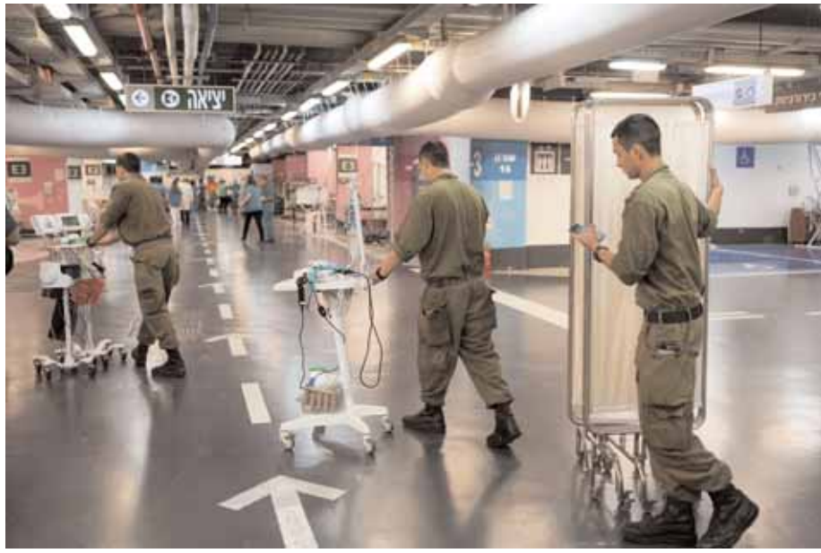
Hospital staff and soldiers move patients and equipment to the underground ward at Rambam medical center as fighting escalates between Israel and the Lebanese militant group Hezbollah. in Haifa, Israel, on Sunday

cratic values," it said. The Israel-Hamas war has been extensively covered by Al Jazeera. The network has reported on the Israeli-Hamas war nonstop since the militants' initial cross-border attack on October 7. Al Jazeera has maintained 24-hour coverage in the Gaza Strip amid Israel's grinding ground offensive that has killed and wounded members of its staff. It remained unclear whether the Israeli military would target Al Jazeera's operation in Gaza as well. While including on-the-ground reporting of the war's casualties, Al Jazeera's Arabic arm often publishes verbatim video statements from Hamas and other regional militant groups. That has led to Israeli claims by officials, including Prime Minister Benjamin Netanyahu, that the network has "harmed Israel's security and incited against soldiers". Those claims have been vehemently denied by Al Jazeera, whose main funder, Qatar, has been key in negotiations between Israel and Hamas to