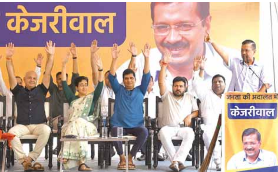
AAP National Convener Arvind Kejriwal addresses as Delhi CM Atishi party leader Manish Sisodia and others at Janta Ki Adalat at Jantar Mantar in New Delhi, Sunday