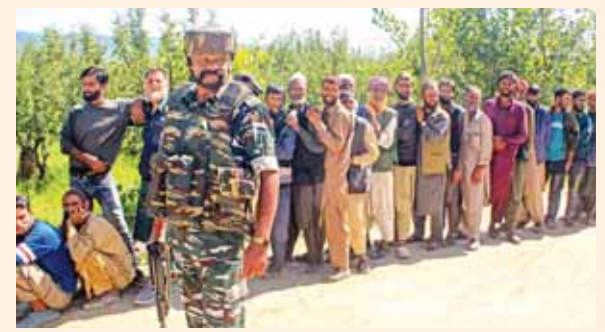
Shopian: Voters wait in a queue at a polling station during the first phase of Assembly elections, in Shopian district of south Kashmir, Wednesday

During the 2014 Assembly polls, Jammu and Kashmir witnessed 65.91 per cent voter turnout. PK Pole said the overall polling percentage may witness marginal correction as several polling parties from remote areas were yet to report to their headquarters. Overall voter turnout of