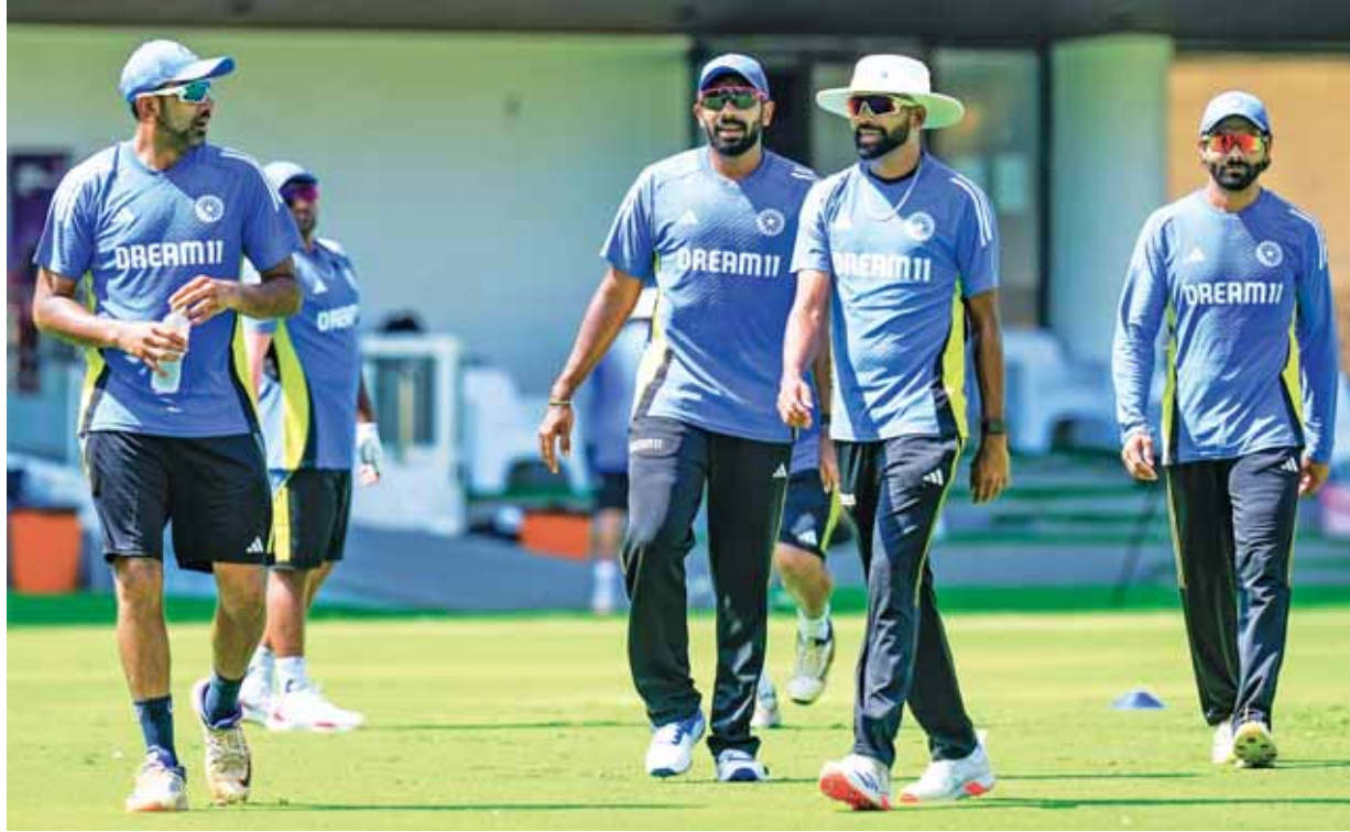
spinners in a three-match ODI series which they lost 0-2. There are bright points too in Rishabh Pant (five matches, average 70), Shubman Gill (10

Kohli's extraordinary qualities as a batter, but it's an area that the champion cricketer himself will certainly want to improve upon. Skipper Rohit Sharma has also been prolific in dismantling spin, especially since his promotion as an opener in 2017 against South Africa. He averaged over 90 against twerkers. But since 2021, it has come down to a less flashy 44 in 15 matches. KL Rahul, a batter who is backed by Rohit as equally proficient against spin and pace, offers a slightly bleaker picture. In the last three years, he has played five Tests at home but against the slower kind, the elegant right-hander's average has taken a beating and stands at 23.40. Collectively, these stats need to be taken as an indication of waning skills but, perhaps, also as a reminder to refocus on perfecting the art of playing spin, often the core strength of batters from this part of the world. Assistant coach Ryan ten Doeschate had stressed on this point recently after India's debacle against Sri Lanka