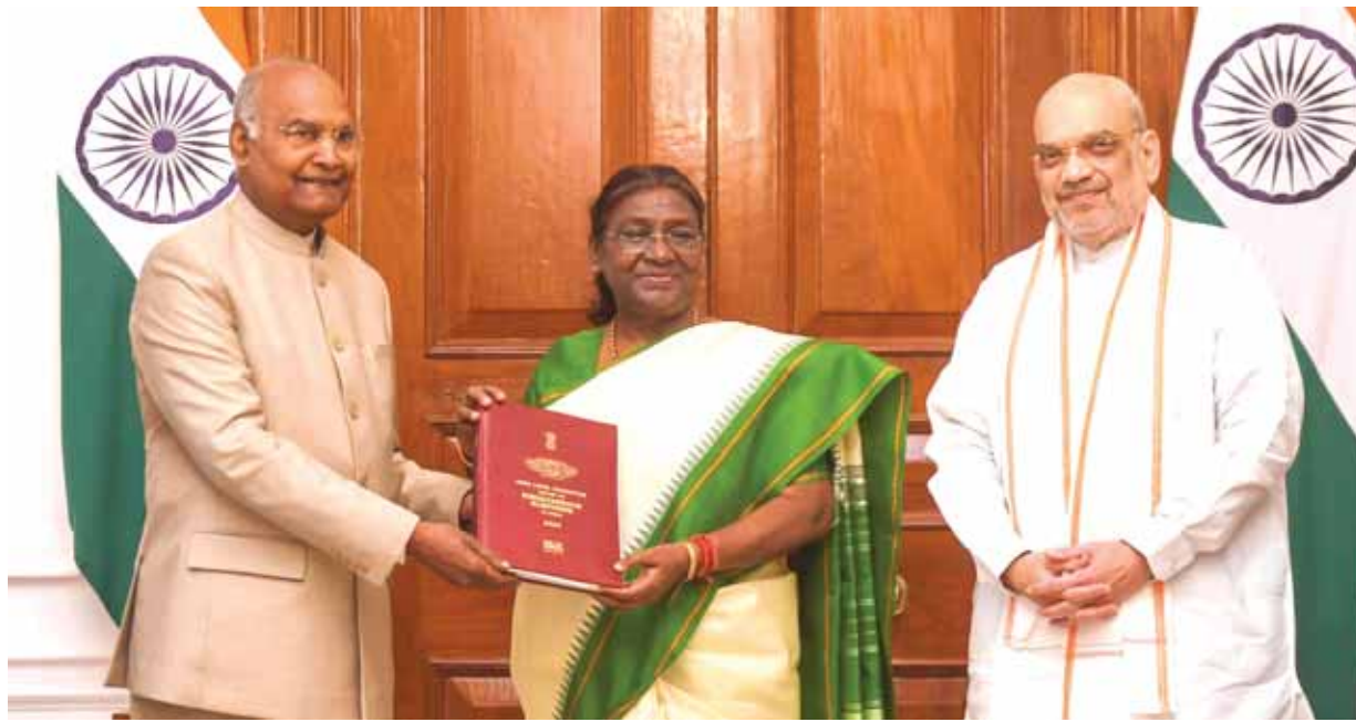
President Droupadi Murmu being presented a report on simultaneous elections in the country by former President Ram Nath Kovind who heads High-Level Committee (HLC) on 'One Nation, One Election', and Home Minister Amit Shah, at Rashtrapati Bhavan in New Delhi

While Prime Minister Narendra Modi said it was an important step towards making our democracy more vibrant and participative, Opposition parties shared a mixed response. The high-level committee approached 62 political parties, of which 47 responded -- 32 voicing support to holding simultaneous polls and 15 opposing it. Fifteen political parties did not submit a response. "I compliment ex-President Ram Nath Kovind for spearheading effort," Modi expressed through social media after Cabinet nod for simultaneous polls recommendation. Among the national parties, the Congress, Aam Aadmi Party (AAP), the Bahujan Samaj Party (BSP) and the