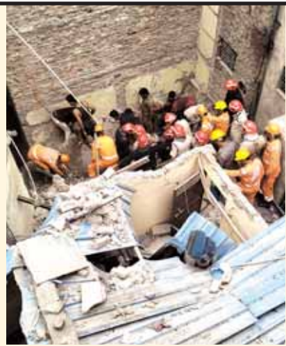
NDRF and Fire personnel conduct rescue operation as a house collapsed at Bapa Nagar (Karol Bagh) in New Delhi, on Wednesday Ranjan Dimri