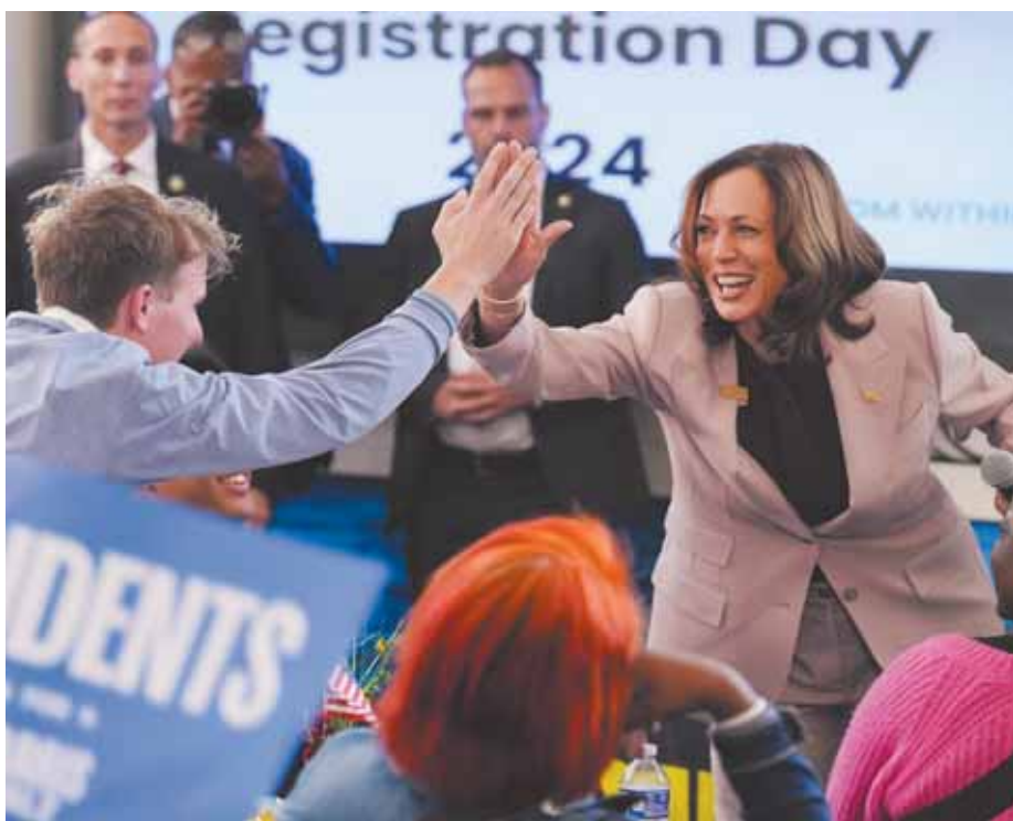
Democratic presidential nominee Vice President Kamala Harris is greeted as she during an unscheduled stop to make remarks at Community College of Philadelphia, Tuesday in Philadelphia.

evacuees, but Portuguese state broadcaster RTP has shown charred houses in rural villages and local residents trying to battle flames with buckets of water, hoses, and even large tree branches. Other televised images showed visibility reduced to a few metres as orange smoke enveloped the terrain. Three firefighters died in their vehicle on Tuesday, while another had succumbed to what authorities called a "sudden illness" while on duty over the weekend. Three civilians have also perished, according to civil protection authorities. Portugal was devastated by massive fires in 2017 that killed over 120 people. Experts link the fires to both climate change and the abandonment of traditional farming and forestry professions that helped keep rural areas clear of underbrush that is now fuel for fires.