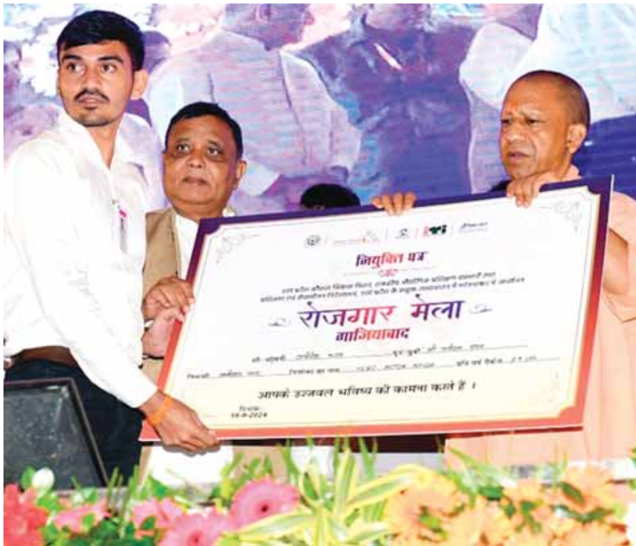
Chief Minister Yogi Adityanath handing over appointment letter at the mega employment fair and loan distribution programme organised in Ghaziabad on Wednesday

Reflecting on past governance, Chief Minister Yogi said,