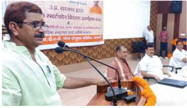
MLA Dr Neelkanth Tiwari addressing tablet distribution function at DAV PG College in Varanasi on Wednesday.

Former UP Minister and MLA of Varanasi South Dr Neelkanth Tiwari said the Prime Minister Narendra Modi's Digital India scheme has dealt a severe blow to corruption. The MLA was speaking as the chief guest at a tablet distribution function held at PN Singh Yadav Smriti Auditorium of DAV PG College here on Wednesday. Dr Tiwari said that the youths will play an important role in the resolution taken by the PM Modi to develop India in 2047. The MLA said both the central and state governments are committed to empowering the youth digitally. "After the implementation of the National Education Policy (NEP), it is very important for the students to be digitally competent, so the government is providing tablets and smartphones to every stu-