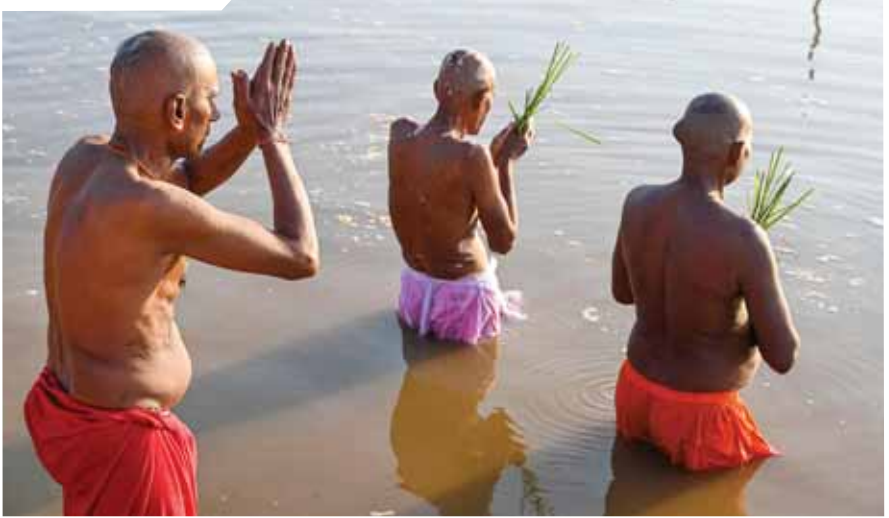
People perform 'pind daan' rituals at the bank of Falgu river on the first day of the Pitra Paksha, in Gaya