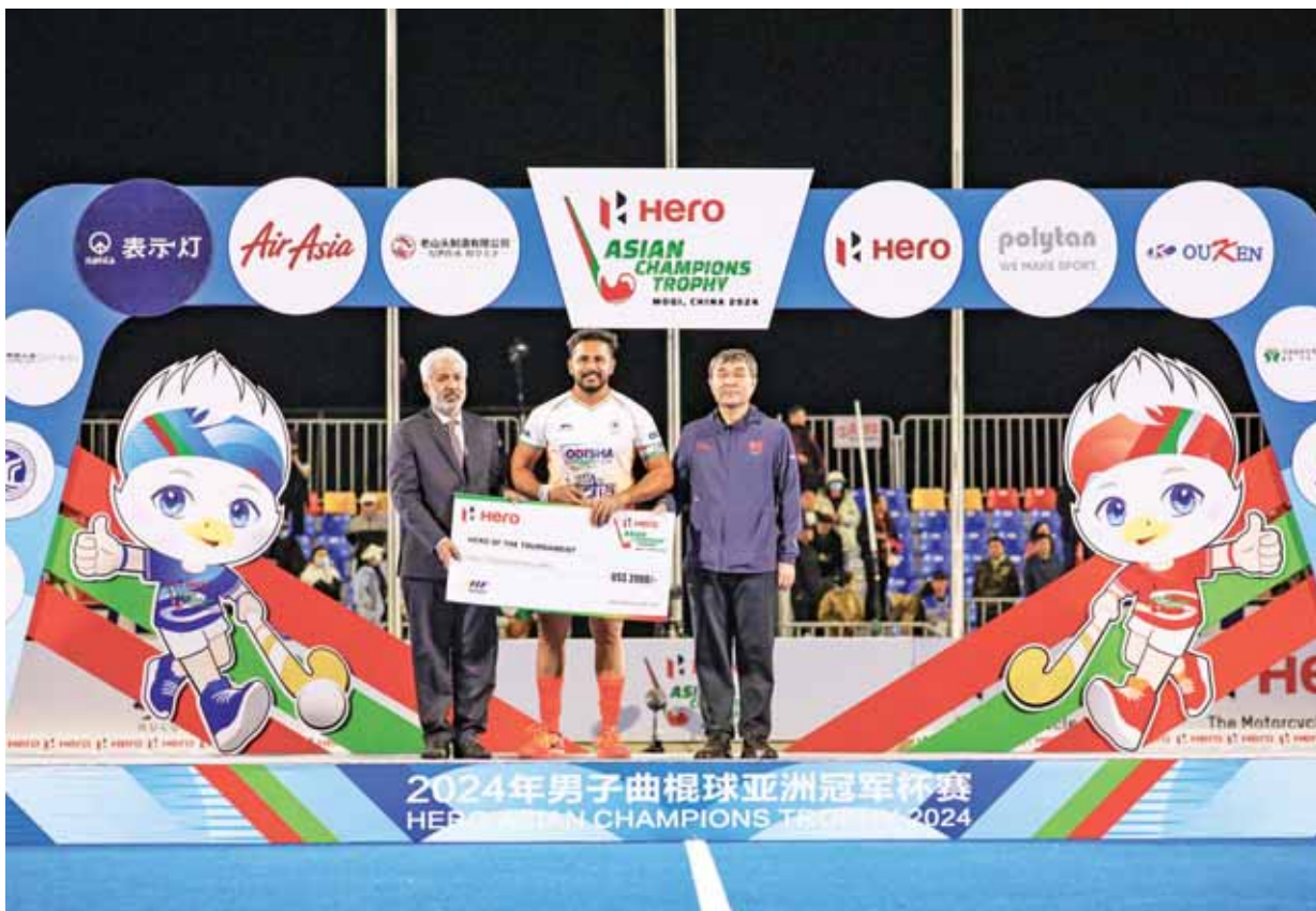
Chennai, the gold medal in the Hangzhou Asian Games and the bronze from the Paris 2024 Olympics have instilled

Skipper Harmanpreet Singh credited India's recent success to strong team camaraderie, emphasising that their deep bond and willingness to "die for one another" helped them overcome China to win the Hero Asian Champions Trophy for a record-extending fifth time. India rode on Jugraj Singh's late strike to defeat China 1-0 in a tense final in Hulunbuir on Tuesday. Pakistan won the bronze medal with a 5-2 win over South Korea. "The final was really intense; the Chinese were breathing down our necks throughout the game and made it really difficult for us to create a clear goal scoring chance," Harmanpreet said in a Hockey India release. "But the team over the last year has built immense trust in each other. We are willing to die for one another. It was this sense of unity reassuring us that we will find a way to win the game together." Harmanpreet said India's successful run in last year has instilled a strong belief among players. "The gold medal in last year's Asian Champions Trophy in