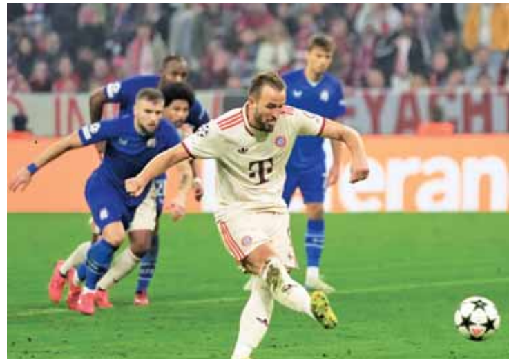
European Cup. It was the highest-scoring game in the competition in terms of total goals since Borussia Dortmund beat Legia Warsaw 8-4 in 2016, according to UEFA. The 31-year-old Kane has scored 12

(penalty) I didn't really know what to do with the third one, but thankfully I was able to put it away," Kane said. Kane opened the scoring from the penalty spot to give Bayern the lead over the Croatian club after his teammate Aleksandar Pavlovic was fouled by Ronaël Pierre-Gabriel. That drew Kane level with Rooney's record of 30, and he scored his 31st on a rebound after goalkeeper Ivan Nevistic parried Joshua Kimmich's shot in the 57th. Kane scored two more from the penalty spot to extend his record. Four other Bayern players scored in the emphatic win and there were two goals for new signing Michael Olise on his Champions League debut after signing from Crystal Palace. Leon Goretzka's header in stoppage time made Bayern the first team to score nine goals in the Champions League era. Some teams, including Bayern, achieved that feat in the old