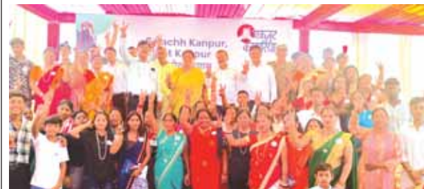
'Ekjut Kanpur' felicitating community ambassadors on Wednesday.