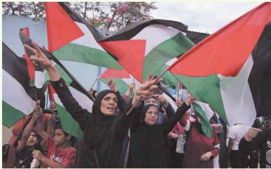
Palestinians in Lebanon wave their national flags during a protest in front of the United Nations Relief and Works Agency (UNRWA) headquarters in Beirut, Lebanon, Tuesday.

Israeli media have meanwhile reported that Prime Minister Benjamin Netanyahu is considering firing Defence Minister Yoav Gallant and replacing him with a politician