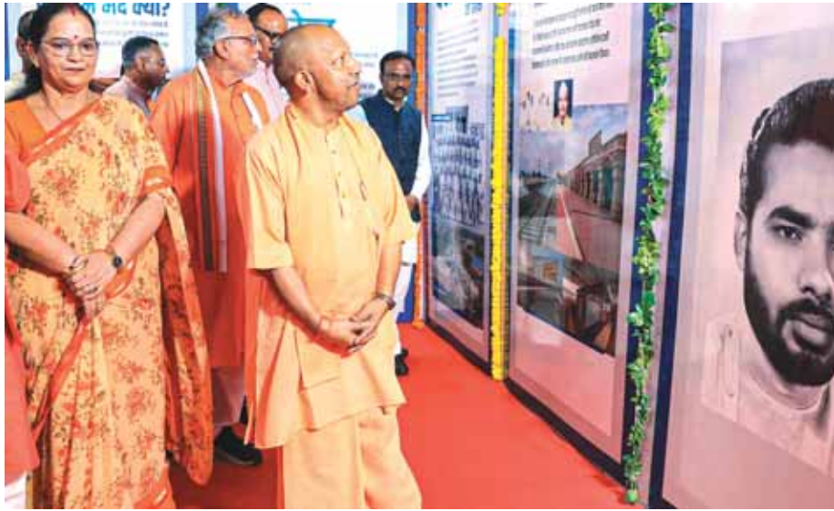
UP Chief Minister Yogi Adityanath visits an exhibition on the life of Prime Minister Narendra Modi in Lucknow on Tuesday

He emphasised the importance of this event in acknowledging artisans' contributions and promoting Uttar Pradesh's cultural heritage. He also highlighted the upcoming UP International Trade Show-2024 in Greater Noida, which will serve as a global platform to showcase the state's potential. The chief minister outlined several initiatives to support the MSME sector and announced plans to offer interest-free loans to 10 lakh youth over the next decade, aiming to enhance self-employment opportunities in the state. He stressed that peace and security are crucial for ensuring a better future for Uttar Pradesh, warning that anyone disrupting state security will face severe consequences. CM Yogi spoke about the significance of Vishwakarma Day, Anant Chaturdashi, and Prime Minister Narendra Modi's birthday, referring to Modi as the architect of a 'New India'. He praised the schemes launched under Modi's leadership for positively impacting millions and fostering economic growth. Reflecting on the past, CM Yogi noted that traditional industries in Uttar Pradesh were on the brink of extinction due to government inefficiency and communal