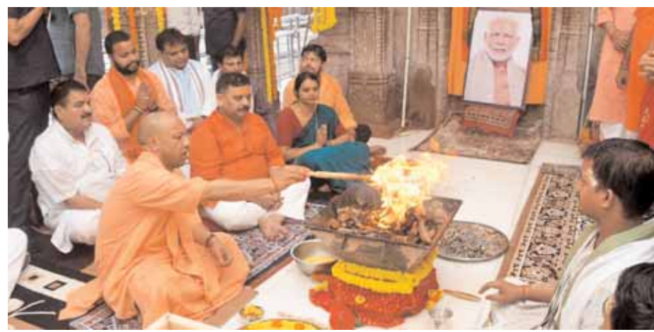
Uttar Pradesh Chief Minister Yogi Adityanath offers prayers at Kashi Vishwanath temple in Varanasi on Tuesday.