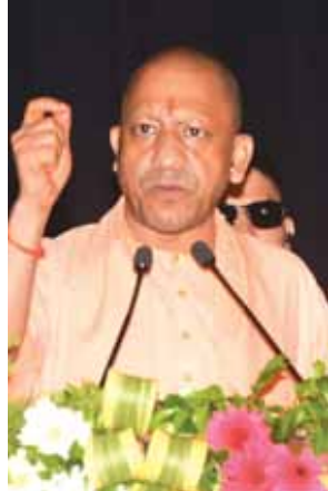
CM Yogi Adityanath addressing Vishwakarma Jayanti function in Varanasi on Tuesday