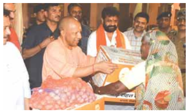
CM Yogi Adityanath distributing articles in flood-hit areas in Varanasi on Monday night.

Chief Minister Yogi Adityanath conducted a field inspection of the progress of the widening of Kachhari-Ashapur Sandha road, Sarani Pro-Poor Project and redevelopment project of Sarang Nath Mahadev temple late at night on Monday. During the inspection, the officers present on the spot and the engineers of the implementing agencies were strictly instructed to complete the work on time as per the standard. Yogi also performed darshan puja at Sarang Nath Mahadev Temple. Besides, the CM visited the relief camp set up for flood victims at JP Mehta Inter College. He also conducted a surprise inspection of the relief camp. While enquiring about the well-being of the people living there, he provided them with materials and also distributed toffees to the children. Earlier, after arriving here from Tripura on his two-day visit, the CM, while reviewing the development/construction projects and law and order by holding a meeting with administrative and police officials in the Circuit House auditorium, directed the officials to provide the benefits of the government schemes to the eligible beneficiaries on priority. He laid special emphasis on completing the development projects going on in the district on a war footing and within the stipulated time period with quality. He also directed the implementing agencies as well as departmental officials to take full care of quality as well as safety standards during the construction work. Laxity will