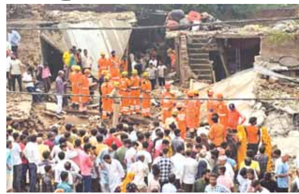
Rescue operation underway after an explosion at a firecracker factory in Firozabad on Tuesday