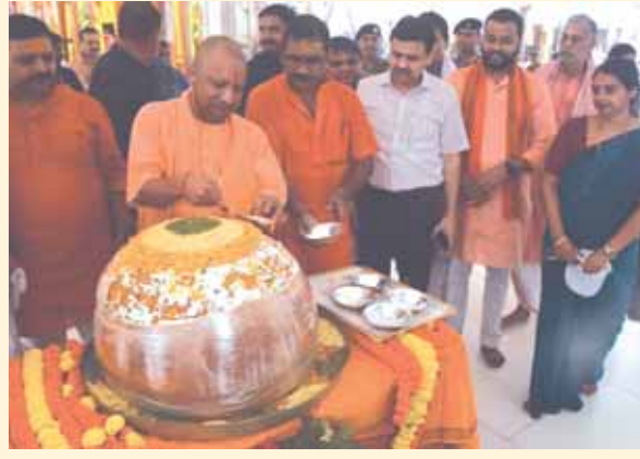
CM Yogi Adityanath distributing 74 kg laddu at Kashi Vishwanath Temple on PM Modi's birthday in Varanasi on Tuesday.

Chief Minister Yogi Adityanath on Tuesday performed a special puja and havan at Shri Kashi Vishwanath Temple on the occasion of Prime Minister Narendra Modi's 74th birthday and also distributed prasad, including a 74 kg laddu, in the temple premises. Yogi began his day by visiting the 'Kashi Kotwal' Kal Bhairav Temple, where he offered prayers. He then performed a special puja and havan at Shri Kashi Vishwanath Temple. The CM arrived in the city on Monday to participate in events marking the PM's birthday in the latter's parliamentary constituency. Despite relentless rainfall, the CM adhered to his schedule, first worshipping Baba Kal Bhairav, the protector of Kashi, and performing the aarti with deep devotion. He then proceeded to Shri Kashi Vishwanath Temple, where he performed the aarti of Nikumbh Vinayak near the Gyanvapi well and followed all