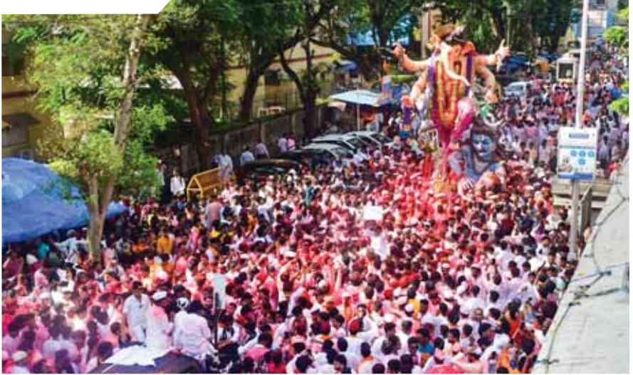
Devotees take part in a procession to immerse an idol of Lord Ganesha at the end of the Ganapati festival, in Mumbai