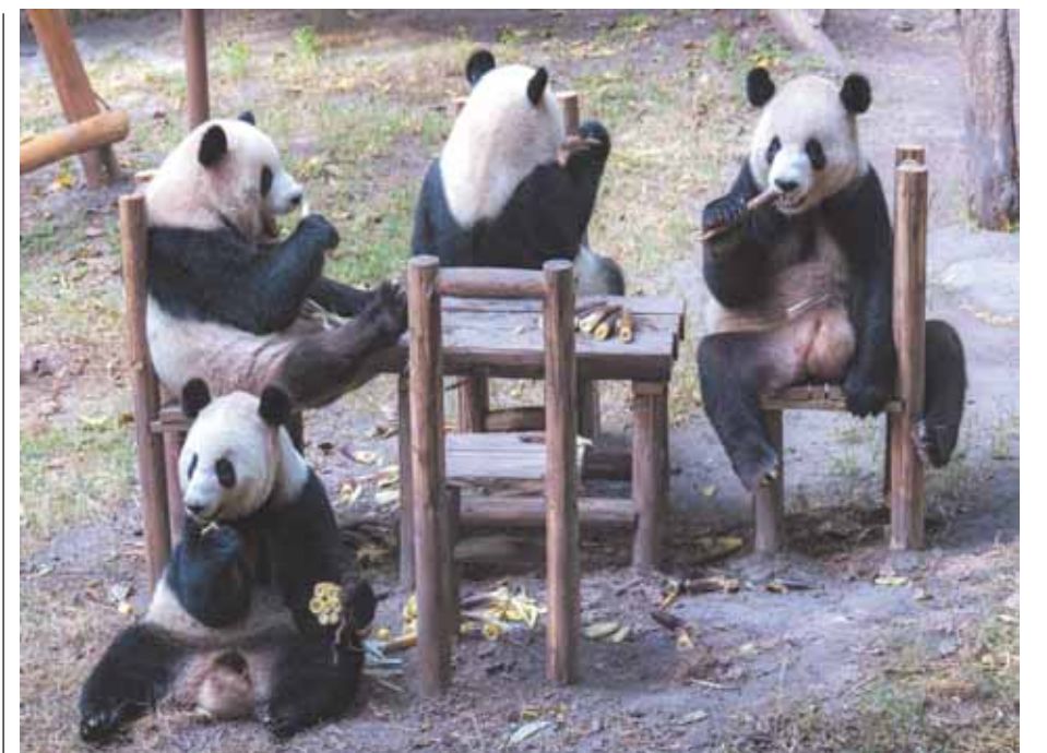
Giant pandas eat bamboo shoots around a table at a zoo in southwest China's Chongqing Municipality, Monday.