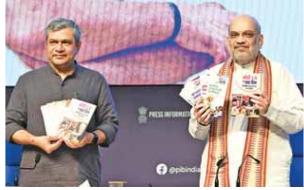
Union Home Minister Amit Shah with Minister of Railways, Ashwini Vaishnaw at the release of a special booklet on achievements of first 100 days.

the restive Northeastern State. Shah, flanked by Information and Broadcasting Minister