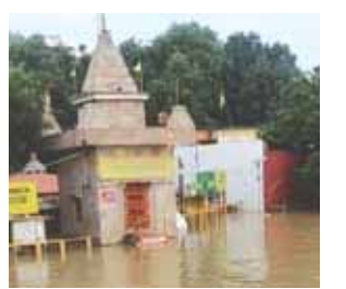
The flooded Assi Ghat in Varanasi on Tuesday.