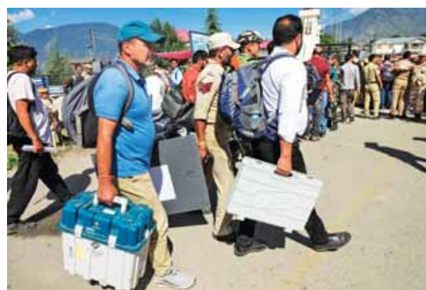
Polling officials leave for their respective polling stations on the eve of first phase of the Jammu and Kashmir Assembly election, in Kishtwar district, Tuesday