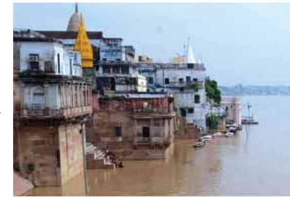
The water level in Varanasi crossed the warning level on Sunday

Rising Ganga water entered several localities on both sides of Varuna river as the latter started reverse flow after the water level of Ganga continued to rise for the fourth consecutive day here on Sunday and it crossed the warning level of 70.262 metres. The water level was recorded at 70.13 metres at 8 am and crossed the warning level later during the day and is expected to reach 70.5 metres by Monday morning. It is the sixth time in this rainy season when such a rising trend is being seen and this time due to heavy rain in western UP. Bundelkhand regions apart from many states in North India, causing rising trend in many tributaries of Ganga and Yamuna rivers. As the river Ganga crossed the 69 metres mark, the Varuna started reverse flow from its confluence point near Adi Keshav Ghat in the northern parts of the city. Due to this rising trend in Ganga, several localities on banks of Varuna like Saraiyya, Salarpur, Puranapul, Nakhighat and others in northern parts of the city got flooded while in southern part, many new local-ities like Matuti Nagar and