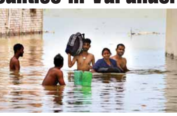
People living in low-lying areas shifting their belongings to a safer place after a rise in the water level of Ganga and Yamuna rivers following heavy rains in Prayagraj on Sunday.

stream Ballia, including Prayagraj, Mirzapur, Varanasi and Ghazipur. At Assi Ghat in the city, Subah-e-Banaras venue was submerged in the water, forcing the organisers to shift the site to an upper location, as the famous Ganga aarti is being conducted at Dadhaswanedh Ghat. Besides the stairs of newly-developed Namo Ghat near Rajghat were also submerged. The river water already entered the famous Sheetla Mata Mandir at Old Dasaswamedh Ghat forcing the devotees to wade through the water to reach the temple. Most