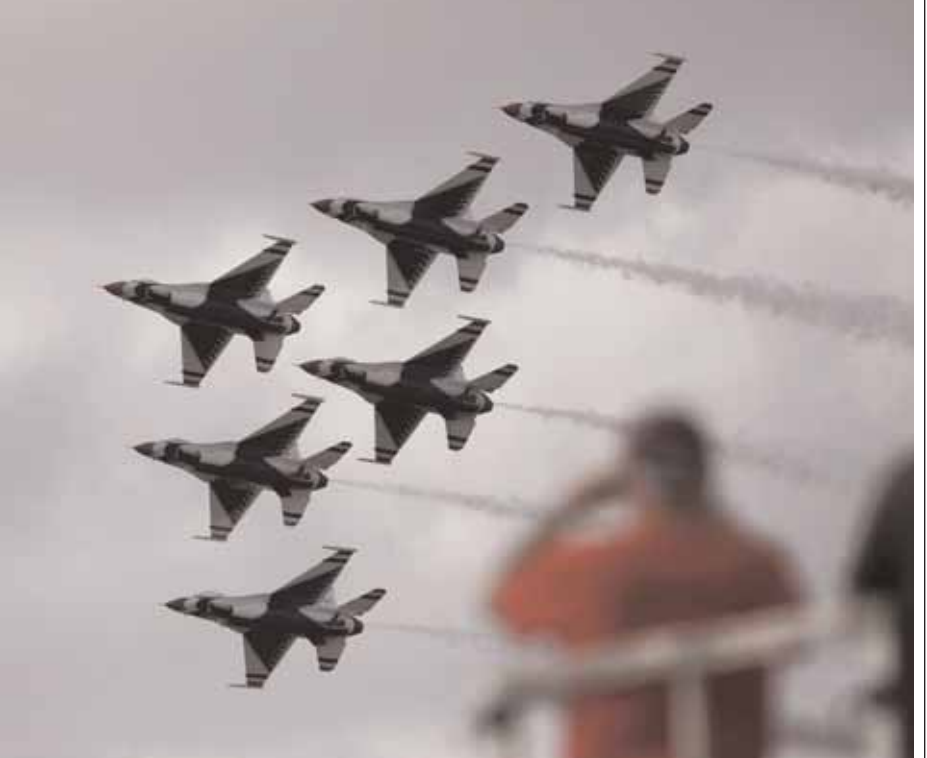
The United States Air Force Air Demonstration Squadron, the Thunderbirds, fly in formation at the Sound of Speed Airshow in St. Joseph. Mo., on Saturday

reporters on the meetings. On Sunday, the Philippine ship at a disputed shoal, BRP Teresa Magbanua, had left in order to resupply and provide medical care to its crew members. The defence official said that they were "watching further developments there very closely.