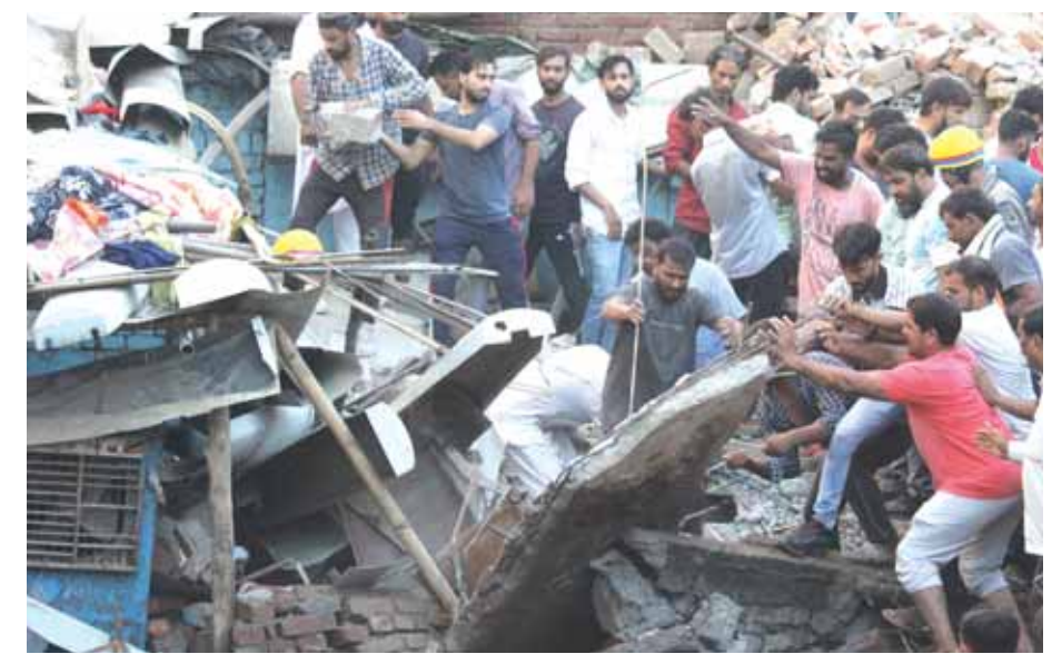
Rescue operation underway on the second day on Sunday after a house collapsed in Meerut