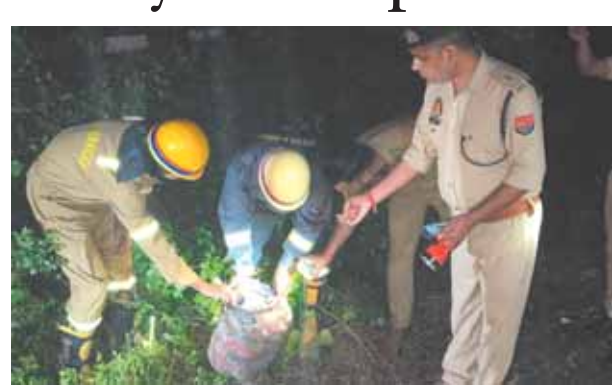
Police and fire services personnel inspect an LPG cylinder after an attempt was allegedly made to derail the Kalindi Express, heading towards Bhiwani from Prayagraj, by placing the LPG cylinder on the tracks, in the Shivrajpur area in Kanpur on Sunday night.