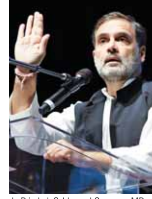
LoP in Lok Sabha and Congress MP Rahul Gandhi addresses the Indian Diaspora, at Dallas in Texas, USA.

BJP on Monday launched a scathing attack on Congress leader Rahul Gandhi over his latest remarks in the United States, calling him a "black spot" in Indian democracy. The party accused Rahul Gandhi of trying to weaken Indian democracy with his remarks whenever he is abroad, in accordance with a Memorandum of Understanding (MoU) reportedly signed between the Congress and the Chinese Communist Party during the UPA rule. BJP claimed that Congress had signed a "party-to-party MoU with China" during its rule. "The series of efforts that Rahul Gandhi has been making to weaken Indian democracy is the outcome of that MoU. If I am wrong, I dare Rahul Gandhi and (Congress president) Mallikarjun Kharge to make the MoU public," the party stated in its first reactions to the Rahul's recent visit abroad. "Everybody knows that Rahul Gandhi is an immature and part-time leader. But People have put a huge responsibility on his shoulders since he became the leader of opposition (in the Lok Sabha). But I feel sad to say that Rahul Gandhi is a black spot in Indian democracy. He does not even know what to talk about when he visits a foreign country," said Gaurav Bhatia, BJP's national spokesperson, at a Press conference at the BJP