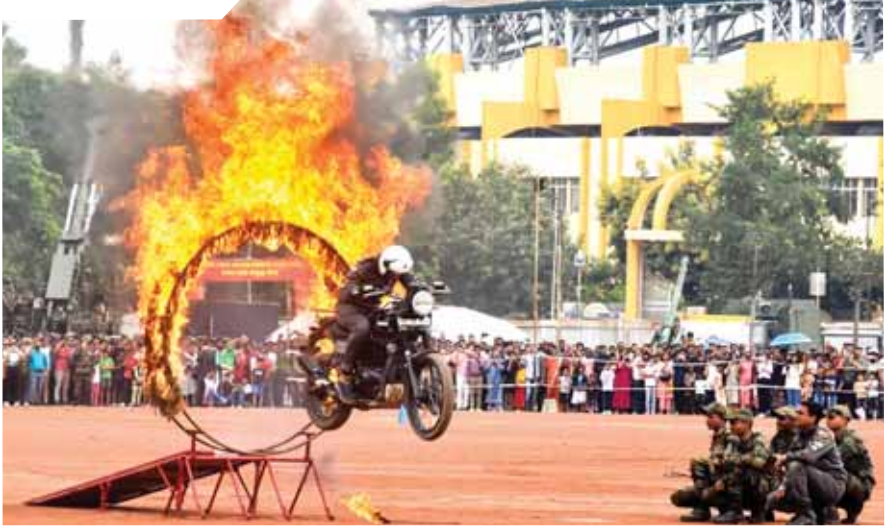
Army jawans perform stunts during the closing ceremony of 'Know Your Army' programme in Ranchi