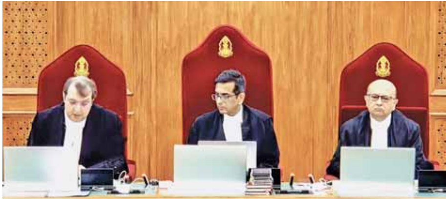
A bench comprising Chief Justice of India (CJI) D.Y. Chandrachud, Justice J.B. Pardiwala and Justice Manoj Misra during the second day of hearing on a suo moto case related to the alleged sexual assault and murder of a postgraduate trainee doctor in Kolkata, at the Supreme Court in New Delhi, Monday, September 9, 2024.

Protest cannot be at the cost of duty," the Supreme Court observed on Monday as it directed the West Bengal doctors protesting over the rape and killing of a postgraduate medic at the State-run RG Kar Medical College and Hospital in Kolkata to return to work immediately. A bench headed by Chief Justice D.Y. Chandrachud directed the protesting doctors to get back to work by 5 pm on Tuesday and assured them that there will be no adverse action if they resume duty. "The State of West Bengal must take steps to create confidence in the minds of the doctors that their concerns regarding their safety and security are being duly attended to. In order to ensure this, all the district collectors and SPs (superintendents of police) shall take stock of the situation in all Government medical colleges and public hospitals and provide adequate safety. "We also direct that in the event the doctors return to duty on or before 5 pm (on Tuesday), no adverse disciplinary action should be taken against them. If there is continued abstention of work, there may be a likelihood of