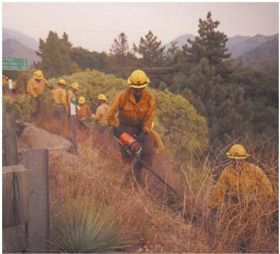
Firefighters work against the advancing Line Fire in Mentone, Calif. on Sunday.