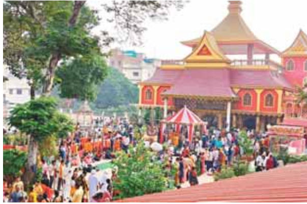
(Left) Devotees going to take bath at Lolark Kund in Varanasi on Monday (right) rush at Kri-Kund, Ravindrapuri, on occasion of Lolark Shasthi