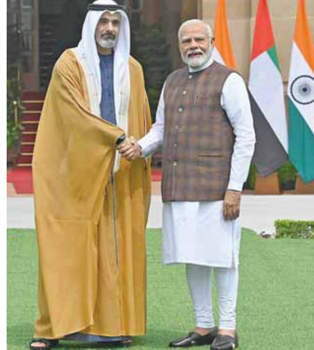
Prime Minister Narendra Modi meets Abu Dhabi's Crown Prince Sheikh Khaled bin Mohamed bin Zayed Al Nahyan at the Hyderabad House, in New Delhi, Monday.

four pacts. Emirates Nuclear Energy Company (ENEC) and Nuclear Power Corporation of India Ltd (NPCIL) also inked an MoU for the operation and maintenance of the Barakah Nuclear Power Plant, according to the Ministry of External Affairs (MEA). The fourth pact is a production concession agreement for Abu Dhabi onshore block-one between Urja Bharat and ADNOC. A