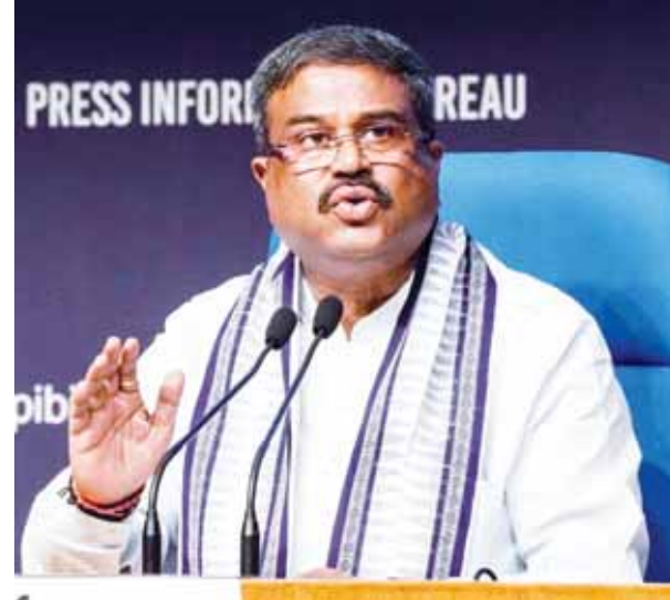
PIONEER NEWS SERVICE ■ NEW DELHI

Education Minister Dharmendra Pradhan on Monday accused Tamil Nadu Chief Minister M K Stalin of trying to pit States against each other to make a point about non-implementation of the new National Education Policy (NEP). Pradhan made the comments in response to Stalin's statement alleging that the