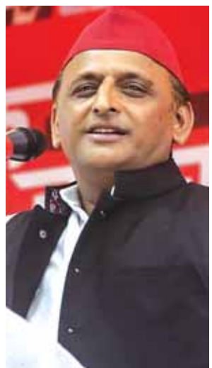
performance in the Lok Sabha elections earlier this year. The BJP won 33 out of 80 seats in UP in the Lok Sabha polls,

Samajwadi Party president Akhilesh Yadav on Monday launched a veiled attack on Uttar Pradesh Chief Minister Yogi Adityanath, saying he is not bothered by remarks made by someone who is 'on his way out'.