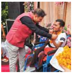
Bank of India distributed joystick wheelchair to Divyangs.

The Bank of India (BOI) organised its 119th foundation day celebrations in Kanpur Zone with fanfare and enthusiasm. On the occasion blood donation, general health check up and eye camp were also organised at the zonal office in which a large number of staff and customers participated. Under the CSR, the bank also distributed equipment to 75 Divyangs at the ALIMCO office. Besides, the bank also distributed six joystick wheelchairs to Divyangs. A tree plantation drive 'Ek Ped Maa Ke Naam' launched by the government was also held and customers' meet was organised in all the branches of the Kanpur Zone in which the bank felicitated the customers.