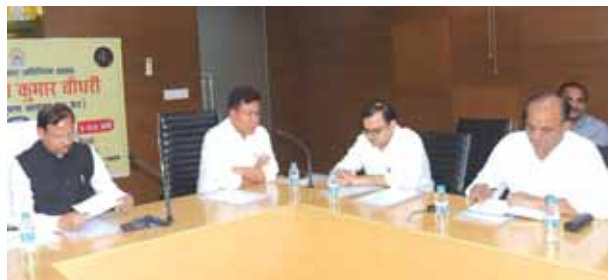
State Information Commissioner addressing a meeting at KDA conference room.