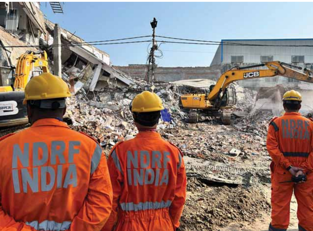
NDRF personnel on Sunday during relief work a day after a building collapse killed eight people in Lucknow.