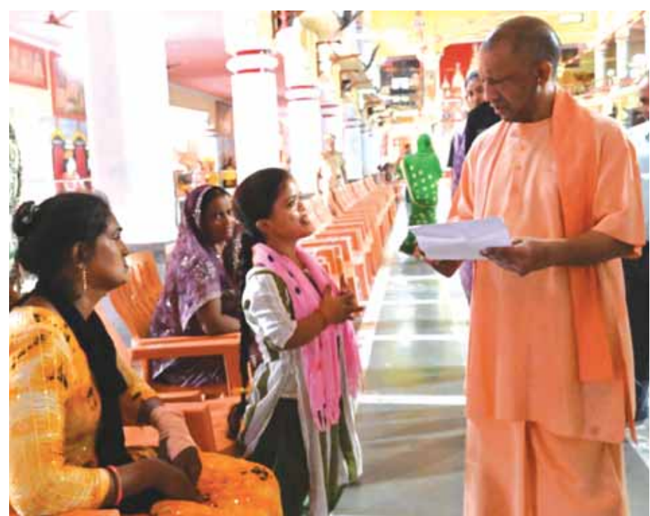
Chief Minister Yogi Adityanath during the Janata Darshan programme in Gorakhpur on Sunday.

FATEHPUR WOMAN'S UNUSUAL REQUEST BRINGS SMILES