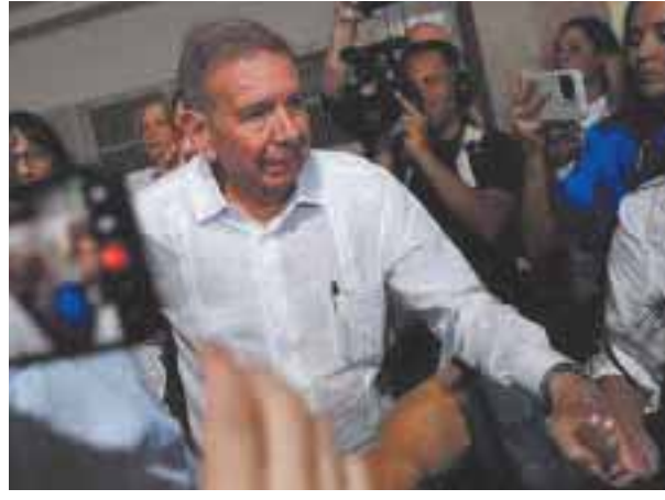
The official spoke on condition of anonymity in line with ministry protocols. González, a 75-year-old former diplomat, was a last minute stand in when Machado was banned from running. Previously unknown to most Venezuelans, his campaign nonetheless rapidly ignited the hopes of millions of Venezuelans desperate for change after a decade-long economic freefall.

expressed his gratitude toward the Spanish government and Spain," Albares said. "Of course I told him we were pleased that he is well and on his way to Spain, and I reiterated the commitment of our government to the political rights of all Venezuelans." Sánchez said in a speech Friday, before González's departure was announced, that the opposition leader was "a hero whom Spain is not going to abandon." Albares said that González had spent an unspecified number of days at the Spanish Embassy in Caracas before his departure. A Spanish official with knowledge of details on González's departure said that his government did not discuss González's exit with Maduro's administration.