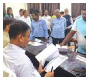
the people of the district within the stipulated time frame as per the intention of the government. He said that the complainant's words must be heard seriously. While inspecting the revenue and land case complaints on the spot, signatures and photographs of the complainants or persons present there must be