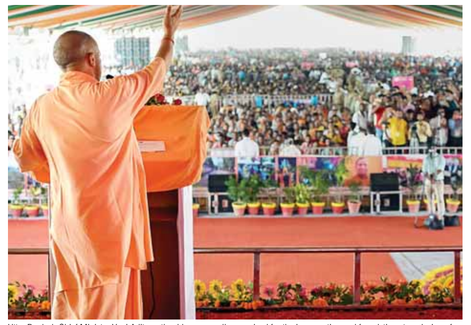
Uttar Pradesh Chief Minister Yogi Adityanath addresses a rally organised for the inauguration and foundation stone laying of multi-crore public welfare projects in Ambedkar Nagar on Sunday. PTI

The chief minister also announced that the Uttar Pradesh Education Commission has been established, and recruitment across primary, secondary, higher, technical, and vocational education will proceed swiftly. "During the SP government, there was a veritable army of criminals whom the SP leaders considered their protégés. The more notorious the criminal, the higher the position they would receive in SP. The SP leaders took pride in this. Back then, the police were on the run while the goons and mafia were in pursuit. Today, the situation has reversed - now it is the mafia on the run, with the police chasing them down." Commenting on the Sultanpur