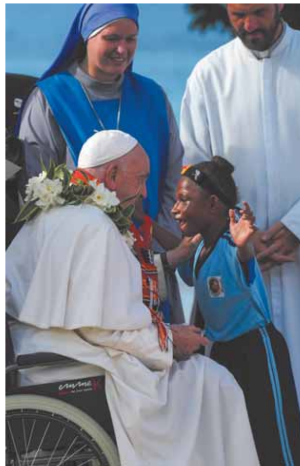
Pope Francis is hugged by a blind pupil of the Holy Trinity Humanistic School in Baro, near Vanimo, Papua New Guinea, on Sunday. Pope Francis celebrated the Catholic Church of the peripheries on Sunday as he travelled to the remote jungles of Papua New Guinea, bringing with him a ton of medicine and toys and a message of love overcoming violence for the people who live there.

his latest threat to use the office of the presidency to exact retribution if he wins a second term. There is no evidence of the kind of fraud he continues to insist marred the 2020 election; in fact, dozens of courts, Republican state officials and his own administration have said he lost fairly. Just days ago, Trump himself acknowledged in a podcast interview that he had indeed "lost by a whisker." While Trump's campaign aides and allies have urged him to keep his focus on Harris and make the election a referendum on issues like inflation and border security, Trump in recent days has veered far off course. On Friday, he delivered a stunning statement to news cameras in which he brought up a string of past allegations of sexual misconduct, describing several in graphic detail, even as he denied his accusers' allegations. Earlier, he had voluntarily appeared in court for a hearing on the appeal of a decision that found him liable for sexual abuse, turning focus to his legal woes in the campaign's final stretch.