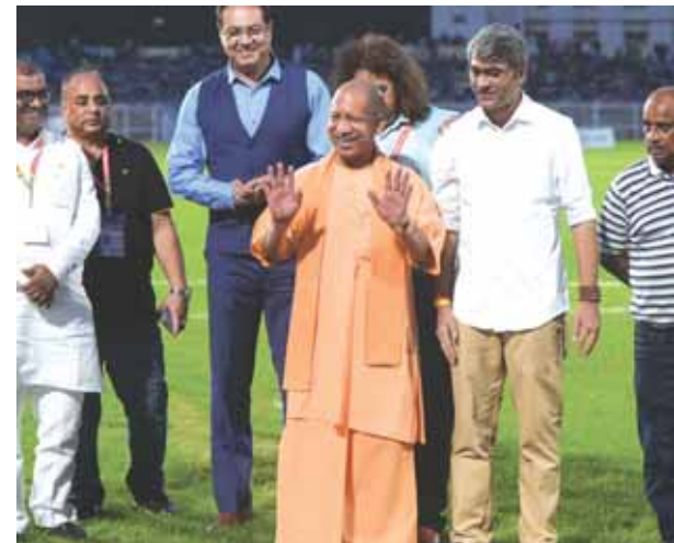
Uttar Pradesh Chief Minister Yogi Adityanath during a football match between the country's leading football clubs Mohun Bagan and East Bengal at the KD Singh Babu Stadium in Lucknow on Monday.

Under the leadership of Prime Minister Narendra Modi, sports and sports activities have rapidly advanced in the country over the past decade. Modi's Khelo India initiative has propelled sports programmes forward and inspired by this, Uttar Pradesh has joined the movement, providing a new direction. As part of this initiative, the state is constructing a sports ground in each of its 57,000 gram panchayats. Additionally, mini-stadiums are being built in all 825 development blocks, and one stadium per district is under development across all 75 districts. The state will also develop 1,000 football grounds, in line with the expectations of the All India Football Federation. Chief Minister Yogi Adityanath made these statements on Monday at KD Singh Babu Stadium before the Mohun Bagan vs. East Bengal football match.