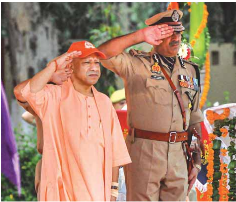
UP Chief Minister Yogi Adityanath takes salute during the passing out parade of Deputy Superintendents of Police at Dr BR Ambedkar Police Academy, in Moradabad on Monday.

Chief Minister Yogi Adityanath, on Monday, said that the Uttar Pradesh Police force had played a key role in shaping the state as a model of good governance. Speaking at the passing out parade of 74 deputy superintendents of police at the Dr Bhimrao Ambedkar Police Academy in Moradabad, the chief minister said, "Today, through the implementation of the rule of law, Uttar Pradesh has transformed its image." He highlighted that the newly appointed officers in the Uttar Pradesh Police, recognised as the world's largest civil police force, must embrace smart policing in line with Prime Minister Narendra Modi's vision.