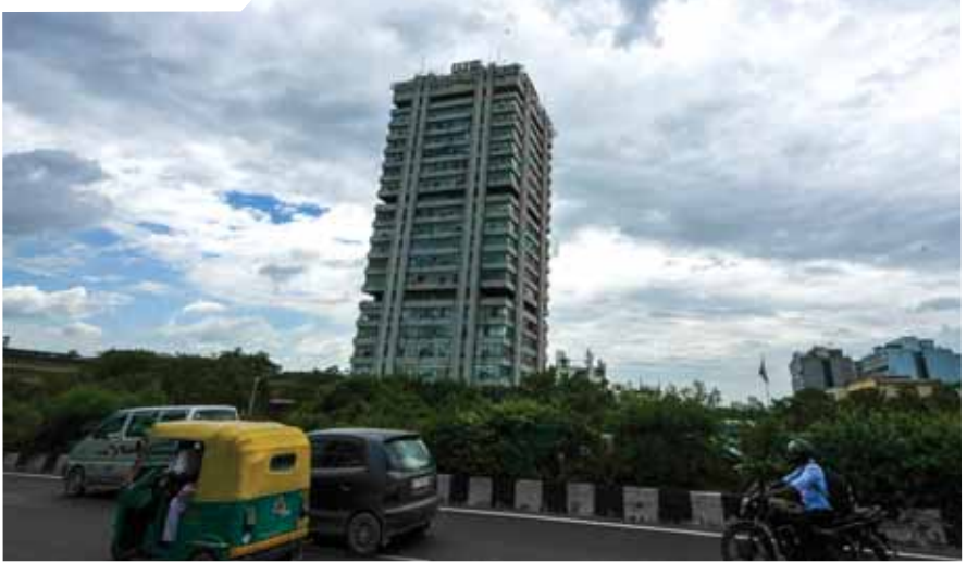
Clouds hover over the Delhi as vehicles pass by the Vikas Minar, in New Delhi