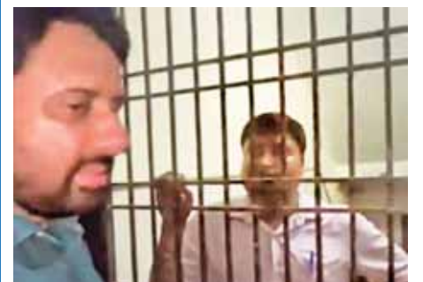
Aam Aadmi Party (AAP) MLA Amanatullah Khan during Enforcement Directorate's raids at his residence, in New Delhi, on Monday