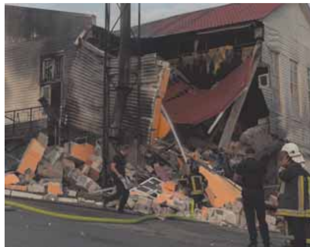
Firefighters extinguish a fire after a rocket hit a building of a higher education institution in the Ukrainian capital Kyiv on Monday.

Russian President Vladimir Putin said Monday that Ukraine's Kursk assault won't prevent Russian forces from advancing in eastern Ukraine. Ukrainian forces haven't achieved their goal of diverting Russian troops from the fighting there, he said. "The main task that the enemy set for themselves — to stop our offensive in Donbas — they haven't achieved it," Putin told school students during a trip to southern Siberia. However, Ukraine President Volodymyr Zelenskyy said last month that the aim of the Kursk incursion is to create a buffer zone that might prevent further attacks by Moscow across the border. Putin predicted that Ukraine's Kursk offensive, which began August 6, will fail and that subsequently Kyiv officials will want "to move to peace talks." Russia launched 35 missiles of various types and 26 Shahed drones at Ukraine overnight from Sunday to Monday, the Ukrainian air force said. Nine ballistic missiles, 13 cruise mis-