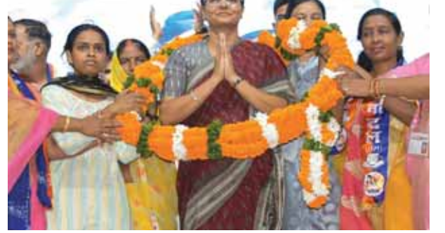
Union Minister Anupriya Patel being garlanded by party workers during Patel Maha Sammelan meeting in Prayagraj on Monday

Anupriya Patel, who came to Prayagraj on Monday, held a meeting with party workers. She had programmes at many places in the district. She said the birth anniversary of Apna Dal founder Sonela Patel will be celebrated with great pomp and show on October 17. Its outline has been prepared in meeting. When journalists asked how many seats Apna Dal workers would contest, she avoided the question and said that only NDA candidates would contest the elections. Her party will work hard to make the candidates win with full strength and loyalty.