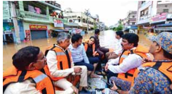
Andhra Pradesh Chief Minister N Chandrababu Naidu with others during a visit to a flood-hit area in Vijayawada