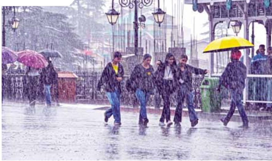
People walk down a road during rain, in Shimla.