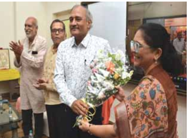
A felicitation ceremony being held at Arts Faculty, BHU in Varanasi on Saturday.