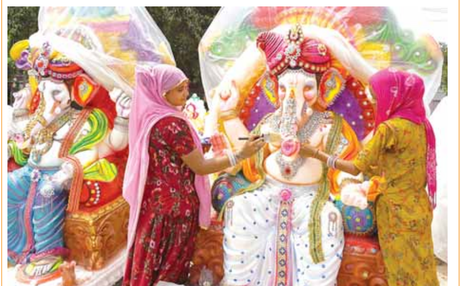
Artists give final touches to an idol of Lord Ganesha ahead of Ganesh Chaturthi festival at a roadside stall in New Delhi on Sunday