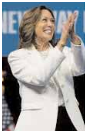
be clear: the former president disrespected sacred ground, all for the sake of a political stunt," Harris said, calling Arlington a "solemn place where we come together to honour American heroes ...

Harris, in a statement posted Saturday on the social media platform X, cited reports that Trump's campaign aides created an altercation with a cemetery staffer and proceeded to take photographs and film the former president, including at the graves of Afghanistan war veterans, after being warned about rules at the site. "Let me