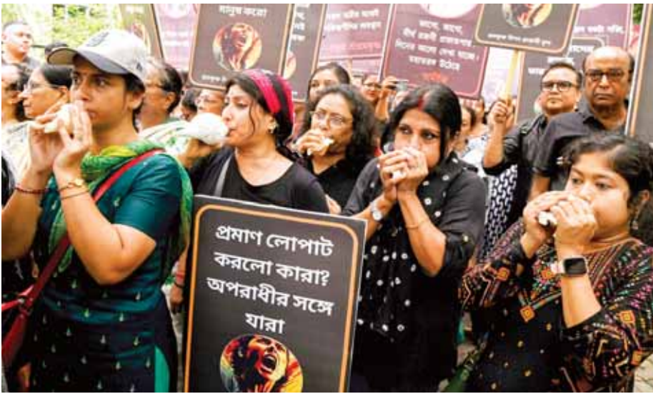
Ramakrishna Mission alumni wearing black dresses blow whistles during a protest rally demanding justice for the victim of R G Kar Medical College and Hospital incident, in Kolkata, on Sunday

the system that is rotting all the medical colleges and the educational institutions thought things would die down automatically after people lose interest with time have just started realising that this time the public is not going to give up... because this is not a political movement... this is the movement of the people who have descended on street... enough is enough... we want justice not only for the victim but for the whole society... the whole women folk."