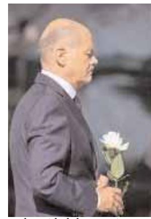
and avoided deportation. In recent days, Chancellor Olaf Scholz's government has announced new restrictions on knives and new measures to ease deportations. On Friday, it deported Afghan nationals to their homeland for the first time since the

German leaders paid tribute on Sunday to the three people killed in the August 23 knife attack by a suspected Islamic extremist, which has pushed immigration back to the top of the country's political agenda. Eight people also were wounded in the attack at a "Festival of Diversity" marking the 650th anniversary of the city of Solingen in western Germany. President Frank-Walter Steinmeier said at a memorial event in a city theatre that he was "relieved and thankful" that none of them is now in serious danger. The 26-year-old Syrian suspect, who was arrested a day after the attack, was supposed to be deported to Bulgaria last year but reportedly disappeared for a time