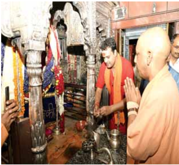
Chief Minister Yogi Adityanath inspecting SSU in Varanasi on Sunday and offering prayers at Kal Bhairav Temple in Varanasi on Sunday.