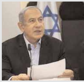
doesn't want a deal," he said. Critics in Israel have accused Netanyahu of dragging his feet in cease-fire talks — a charge he denies.

Jerusalem: Israeli Prime Minister Benjamin Netanyahu has expressed sorrow over the deaths of six hostages, saying the killings prove that Hamas does not want a cease-fire deal. Netanyahu said Sunday that he was heartbroken to hear the news of the hostages' deaths. He accused Hamas of killing them in "cold blood" and said Israel would hold the group accountable. He also accused the group of scuttling ongoing cease-fire efforts. "Whoever murders hostages