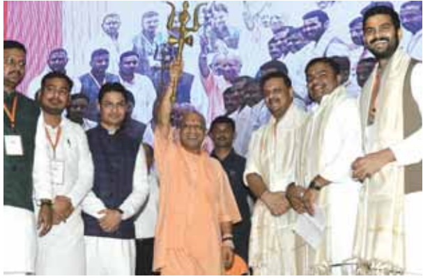
Chief Minister Yogi Adityanath at BJYM programme at TFC in Varanasi on Sunday

Making a big announcement in the cultural capital Kashi, Chief Minister Yogi Adityanath said that in the next two years, one lakh youth would be recruited in the UP Police. He further said that not only this, in the coming two years, two lakh youth would be linked to government jobs. Chief Minister Yogi was addressing the state working committee meeting and membership workshop of Bharatiya Janata Yuva Morcha (BJYM) at Trade Facilitation Centre in Bada Lalpur, here on Sunday. "Today there is no discrimination against the youth in the state. Youth are being linked to government jobs in a fair and transparent manner. In the last seven and a half years, we have given jobs to more than six and a half lakh youth. Just yesterday (Saturday), we successfully completed the written examination of the biggest police recruitment process in the state, which will give more than 60,200 youth a chance to serve in the police force," he said. During his address, Yogi Adityanath gave tips on politics to the youth and called upon them to choose politics for the establishment of values and ideals in accordance with the principles. "Politics should not be a means of attaining power or achieving self-interest but should become a medium for the promotion of values and state interest and national interest," he said. While giving the mantra of meaningful politics to the BJYM workers, Yogi Adityanath drew attention towards the teachings of Atal