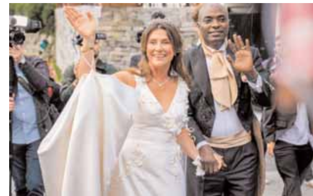
media outlets that Norwegian and US artists performed at the event along with a gospel choir and a singer representing Norway's indigenous Sámi people. "It was fantastic! It was Hollywood meets Geiranger," Norwegian TV personality

Social media influencers, reality stars and TV personalities were among the guests at the Norwegian king's eldest child, Princess Martha Louise, married an American self-professed shaman on Saturday in a wedding ceremony following three days of festivities. The 52-year-old Martha Louise and Durek Verrett, who claims to be a sixth-generation shaman from California, tied the knot in the picturesque small town of Geiranger, one of Norway's major tourist attractions located on a fjord with stunning views. Following festivities that started on Thursday, the actual wedding ceremony took place in a large white tent set up on a lush lawn. Guests told