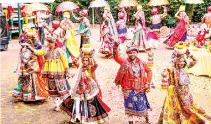
Performers dressed in traditional attire rehearse for Garba, ahead of Navratri festival, in Ahmedabad