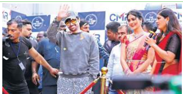
Ustaad Ram Pothineni brings the house down in Nizamabad! His stylish entry steals the show at the CMR shopping mall.