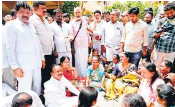
Malkajgiri MP Eatala Rajender stages a sit-in along with HYDRAA victims at Maruthi Nagar, Kothapet on Friday

Asking Chief Minister Revanth Reddy to explain how he will beautify the Musi River area when he is not in a position to pay salaries to government employees, the BJP's Malkajgiri MP, Eatala Rajender, said the CM thinks that the people would believe him even if he speaks lies. Addressing the dharna staged at Maruthinagar in Kothapet with HYDRAA victims on Friday, Eatala said that Revanth has been demolishing the houses of the poor. Eatala termed Revanth as a sadist and said that Revanth is