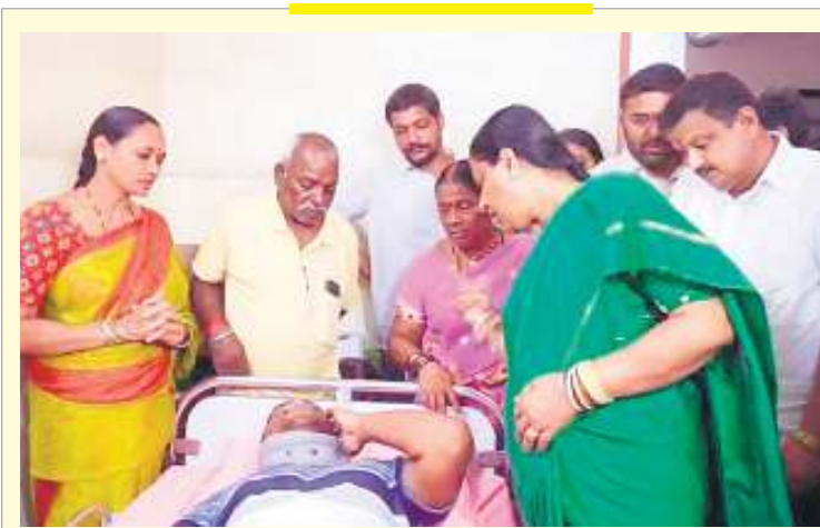
Minister for Forests and Environment Konda Surekha calling on injured Forest Department officers at a hospital in Warangal on Friday

As this situation unfolds, the commitment to maintaining the purity and quality of prasadam remains a top priority for temple authorities, reinforcing the trust and faith of the devotees.