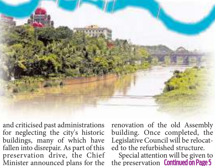
and criticised past administrations for neglecting the city's historic buildings, many of which have fallen into disrepair. As part of this preservation drive, the Chief Minister announced plans for the renovation of the old Assembly building. Once completed, the Legislative Council will be relocated to the refurbished structure. Special attention will be given to the preservation

The historical buildings along the Musi River are set to become tourist destinations due to a new initiative announced by Chief Minister Revanth Reddy. Appealing to industrialists, the Chief Minister urged them to contribute to preserving Hyderabad's cultural heritage, emphasizing the importance of these structures to the city's identity. He reaffirmed the government's decision to promote tourism and to make Telangana a welfare state. In a significant move, the TG Tourism Department signed an agreement with the Confederation of Indian Industry (CII) to restore ancient step-wells in Hyderabad. Speaking at the event, the CM highlighted the government's Musi Riverfront Development Project