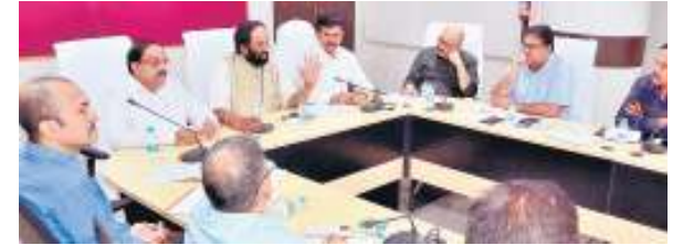
Seetharama Project must be completed swiftly: Uttam Kumar Reddy

Irrigation Minister Uttam Kumar Reddy directed officials to speed up the Seetharama Project in Khammam district. He emphasized the need to fast-track the tender process and to ensure that there is no delay in land acquisition. The Minister also stressed the importance of coordination among officials to get technical approvals and urged them to speed up administrative clearances. The Seetharama Project's pump houses were inaugurated by Chief Minister Revanth Reddy on August 15. Reviewing the progress of the tunnel and canal construction work on Friday at the Jalasoudha, Uttam held discussions with fellow ministers Tummala Nageswara Rao and Ponguleti Srinivas Reddy and