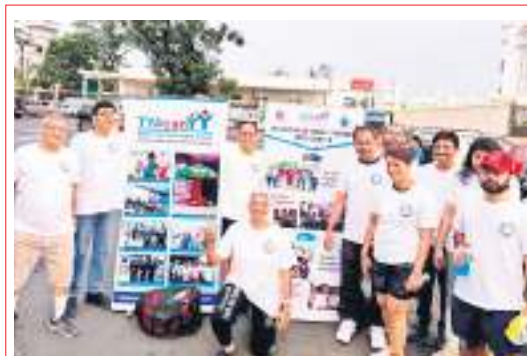
An awareness race in Hyderabad was successfully organised by the Teenage and Young Adult Cancer (TYAcan) Foundation, dedicated to meeting the special needs of cancer sufferers between the ages of 15 and 30. The 5 km, 10 km and 15 km runs were placed at the event. They began at Secretariat and went through Necklace Road, Sanjeevaiah Park, Khairatabad, before returning to Secretariat.