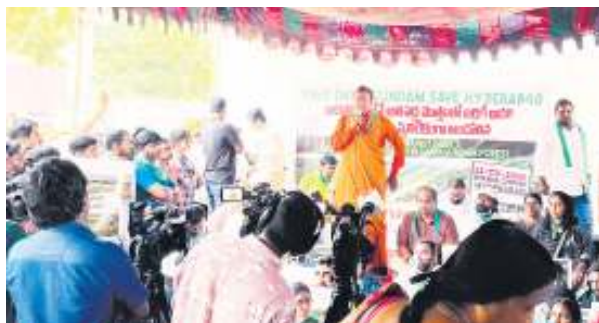
A large number of students and activists participate in the Save Damagundam protest at Dharna Chowk on Sunday

The committee criticised MP Konda Vishweshwar Reddy for his reckless comments made while visiting a nearby village about animals