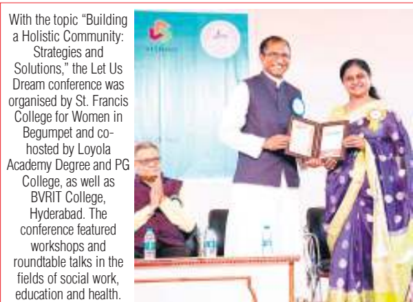
With the topic "Building a Holistic Community: Strategies and Solutions," the Let Us Dream conference was organised by St. Francis College for Women in Begumpet and co-hosted by Loyola Academy Degree and PG College, as well as BVRIT College, Hyderabad. The conference featured workshops and roundtable talks in the fields of social work, education and health.