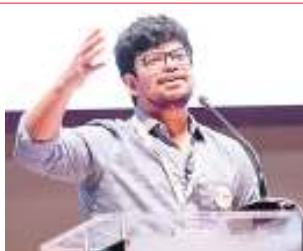
Bower School of Entrepreneurship, a new-age campus for Undergraduate students, focusing on entrepreneurial education, announced the launch of its 3 year program and their campus to facilitate future entrepreneurs at an event in Hyderabad. The student-centric and outcome-oriented program is the first of its kind program in India, equipped with Distinct Learner Tracks.