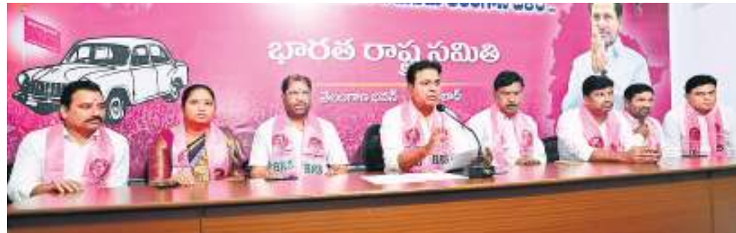
BRS working president KT Rama Rao addressing media at Telangana Bhavan on Sunday