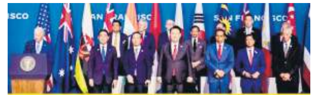
INDIA SIGNS IPEF AGREEMENT WITH INDO-PACIFIC ECONOMIC FRAMEWORK MEMBERS

"India signed and exchanged the first-of-its-kind agreements focused on Clean Economy, Fair Economy, and the IPEF Overarching arrangement under IPEF for prosperity, on September 21 at Delaware, USA, in the presence of Prime Minister Narendra Modi who is on 3-day visit to the US for