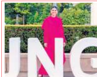
Actor and UNDP Youth Champion Sanjana Sanghi delivered a keynote address at the iconic UN General Assembly Hall as the voice of young people during the opening ceremony of the Summit of the Future Action Days in New York. Sanghi became the youngest Indian actor to receive such an honour!