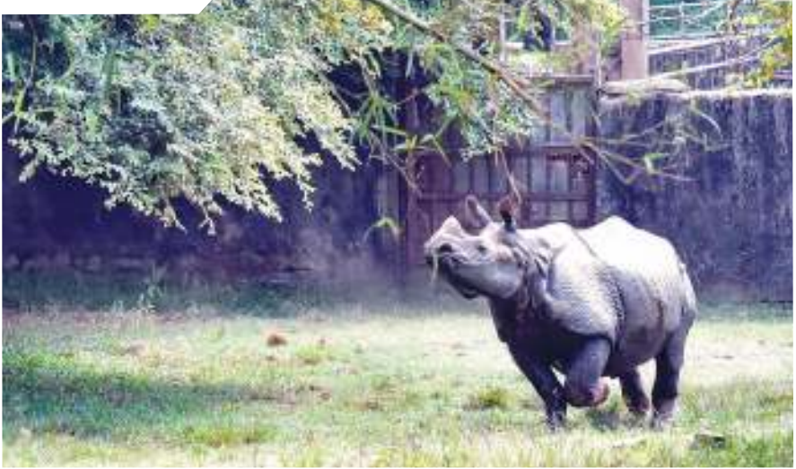
A one-horn Rhino at the Assam State Zoo on the World Rhino Day, in Guwahati