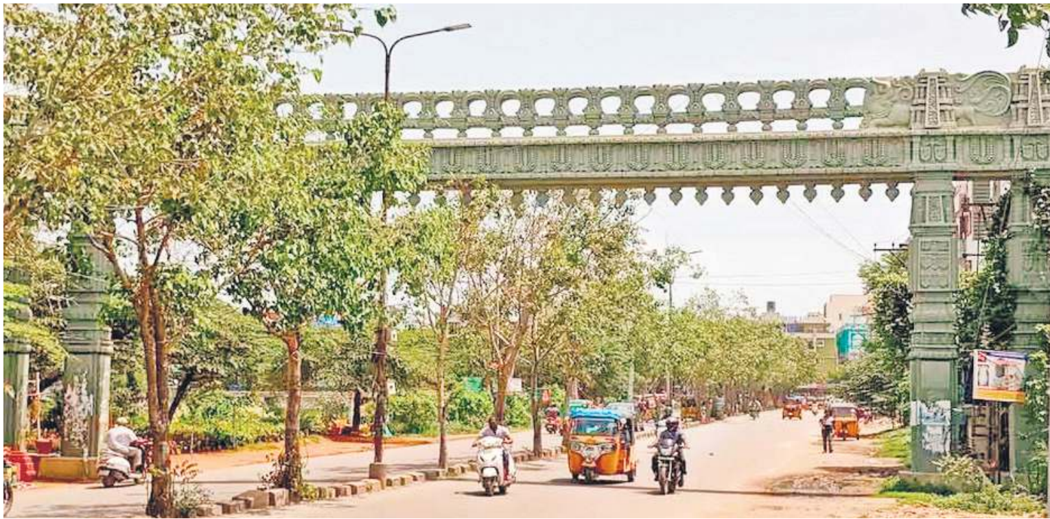
The entrance arch of Pragathi Nagar near JNTU in Hyderabad