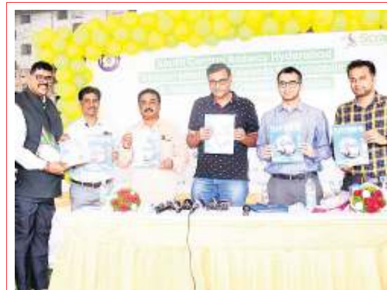
ScrapQ takes a major leap in environmental protection. They have made a significant impact on environmental conservation by securing a key agreement with railway authorities to manage and recycle plastic waste generated by railway passengers.