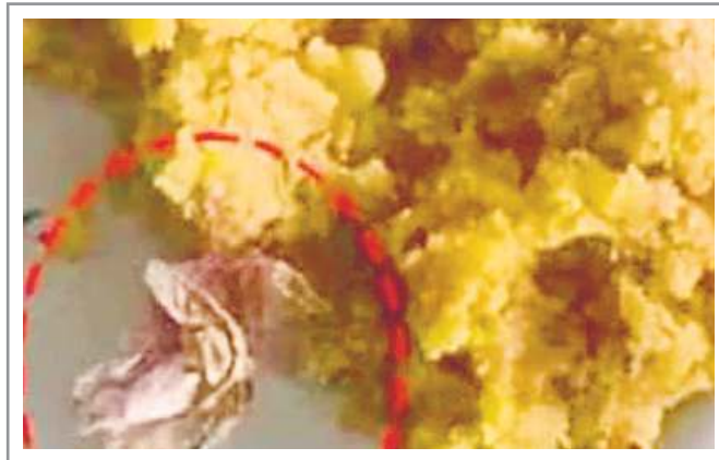
Laddu in which gutka sachet was found in Khammam on Sunday