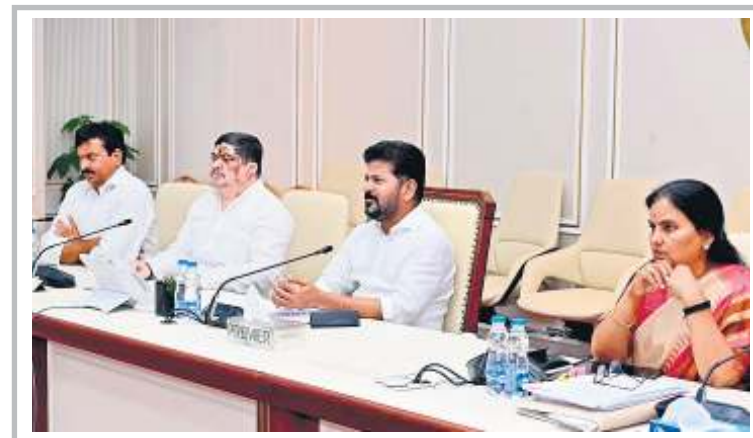
Chief Minister A Revanth Reddy addressing a review meeting at the Secretariat in Hyderabad on Friday

On garbage collection, the Chief Minister stressed that GHMC must focus more on ensuring daily collection from every household. He suggested the use of modern technologies like GIS and QR scanning for better supervision. To prevent financial hurdles, Revanth Reddy asked officials to prepare clear financial plans, temporarily adjusting funds to clear pending dues. He also