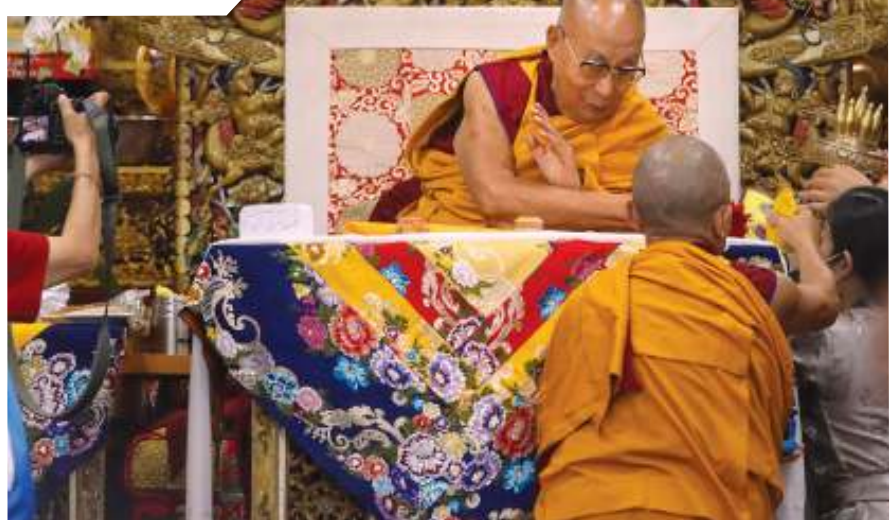
Tibetan spiritual leader the Dalai Lama during a teaching session at the Main Tibetan Temple, in Dharamshala