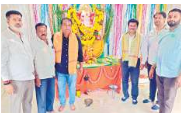
ORR toll workers offering prayers at Ganesh pandal