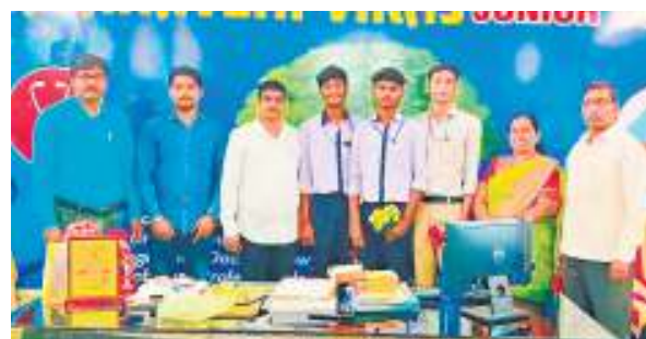
Students selected for State-level softball tournament in Peddapalli

They also discussed the number of cranes to be deployed and the number of personnel to be appointed at the places of immersion, electricity supply, erection of barricades, keep ready the floats among other things with the officials.