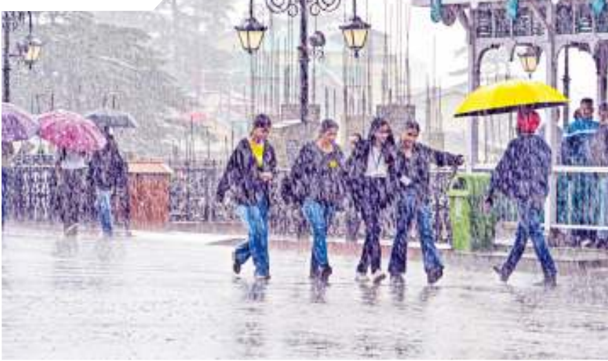
People walk down a road during rain, in Shimla.