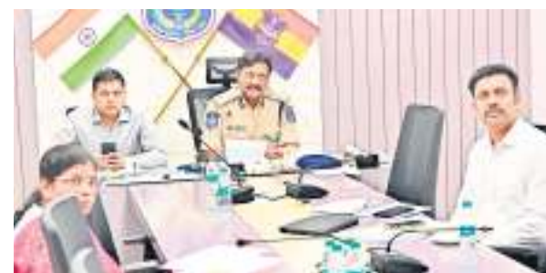
Rachakonda Commissioner Sudheer Babu giving instructions to the officials regarding the measures to be taken during heavy rains

and normalized the traffic flow at Vengal Rao Park towards NFCL Junction.