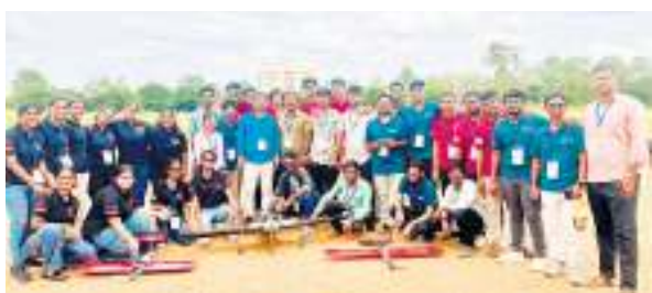
MLRIT Hyderabad aero team seen along with the drones

The case registered under 329(3) (Criminal Trespass), 326(a) (knowingly diminishing water supply) BNS, and 3 PDPPA (Damage to public property).