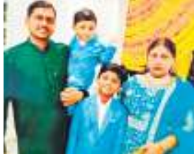
Couple ends life after killing children at Jeedimetla