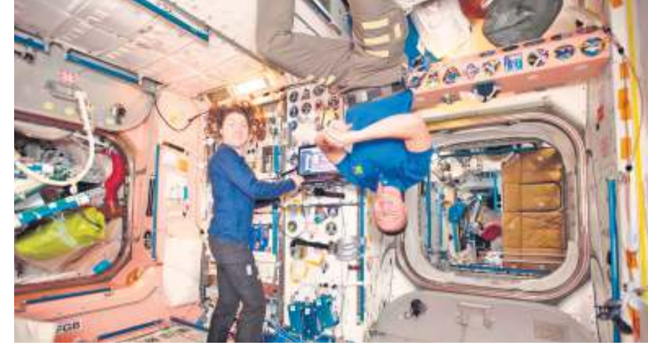
Space station, the ISS is a spacecraft in the Earth's orbit. It is a unique science lab and serves as a "home" where crews of astronauts live, according to the NASA. The authors found significant shifts in gut bacteria that indicated changes in the mice's liver and intestinal genes, suggesting that spaceflight might suppress the immune system and alter metabolism. "These interactions suggest disruption of the signals, metabolites, and immune factors exchanged across the gut-liver axis which are likely to drive glucose and lipid (fat) dysregulation," the authors wrote in the study published in the journal npj Biofilms and Microbiomes. "Collectively, these multiomic findings suggest host-gut microbiome interactions during spaceflight are likely to underlie widespread changes to host physiology which could pose a risk to health," they wrote.

Space travel can cause shifts in the gut that might suppress the immune system of astronauts and affect their metabolism, according to a study. The findings help understand how space missions of long durations could affect health of astronauts, researchers said. Using genetic technologies, a team of researchers, led by those at Canada's McGill University, analysed changes in the guts, colons and livers of mice onboard the International Space Station or the ISS over a period of three months. An international collaboration of NASA and other space agen-