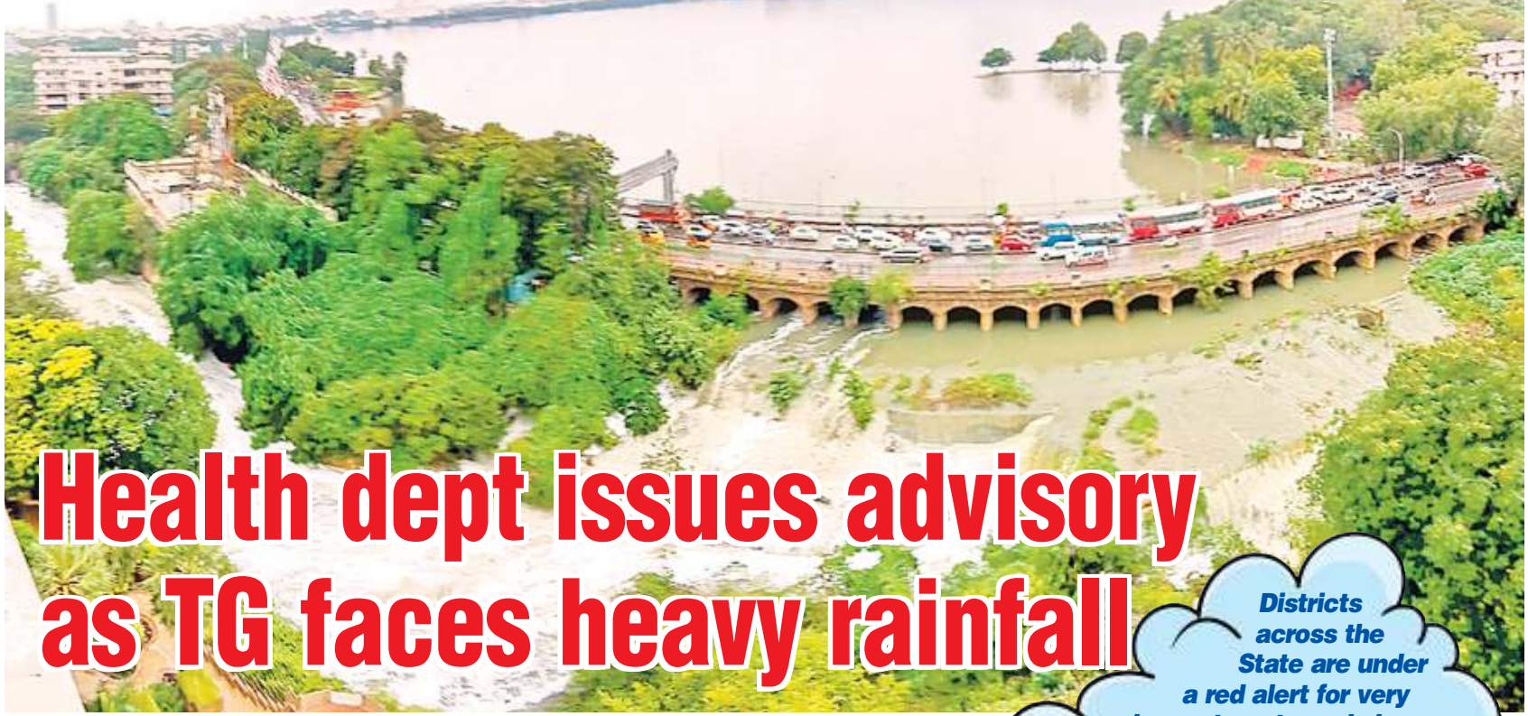
Water being discharged from the overflowing Hussain Sagar Lake