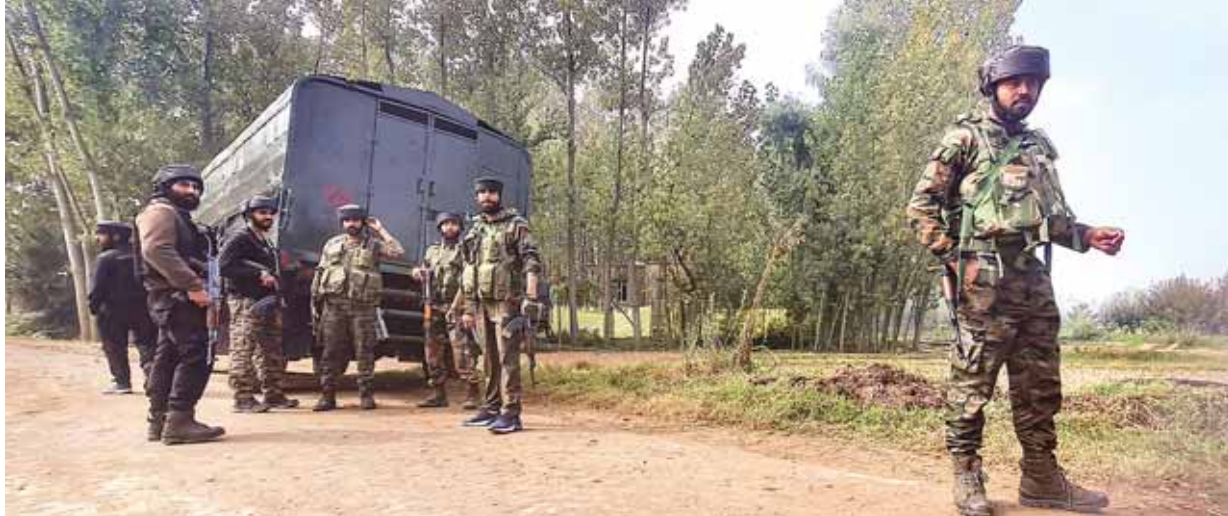
Security personnel stand guard after an encounter broke out between terrorists and security forces during cordon and search operation at Adigam village, in Kulgam district, Saturday