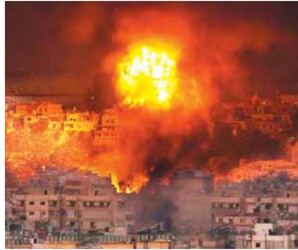
Flames rise after an Israeli airstrike in the southern suburbs of Beirut, Lebanon, Saturday