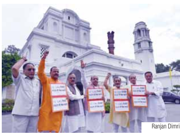
15 minutes. They were marshalled out of the house even as the AAP claimed that these are there cheap tactics to not