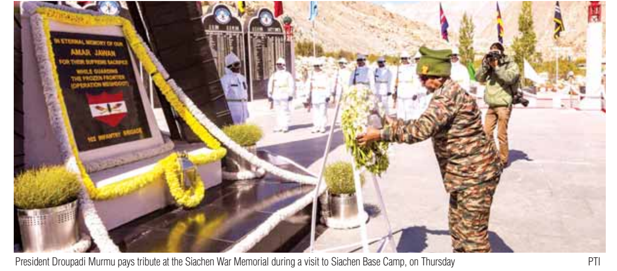
President Droupadi Murmu pays tribute at the Siachen War Memorial during a visit to Siachen Base Camp, on Thursday