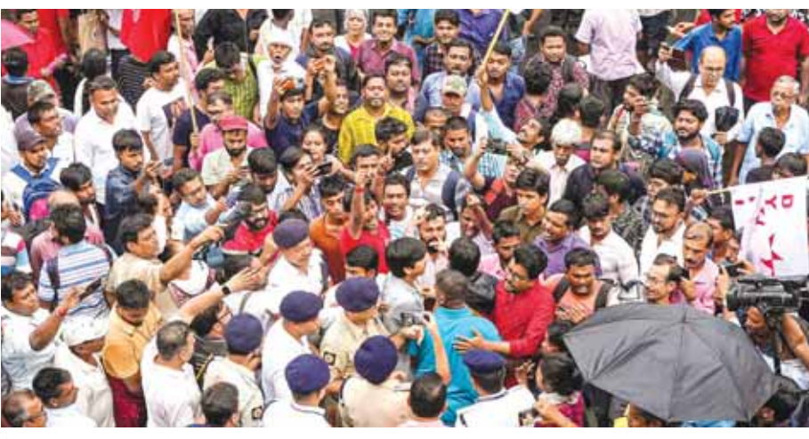
Activists of various left wing parties clash with police personnel during a protest march against the alleged sexual assault and murder of a trainee doctor at RG Kar Medical College and Hospital, in Kolkata, Thursday