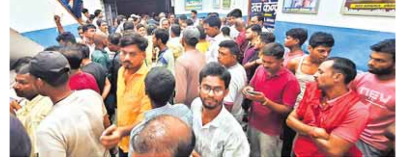
People gather at a government hospital after their family members drowned while taking holy dips in rivers and ponds during the 'Jivitputrika' festival on Wednesday, in Aurangabad district of Bihar, Thursday, Sept. 26, 2024.