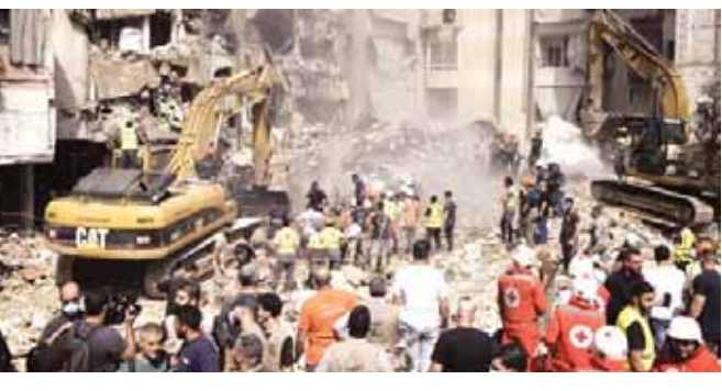
country would continue fighting "with all our might until victory and the safe return of the residents of the north to their homes." Hezbollah has also not yet

had been any directive to ease up on fighting on the northern border with Lebanon. The comments raised questions about a new international initiative to halt increasingly heavy exchanges of fire that have killed hundreds of people in Lebanon and threatened to trigger an all-out war between Israel and Hezbollah.