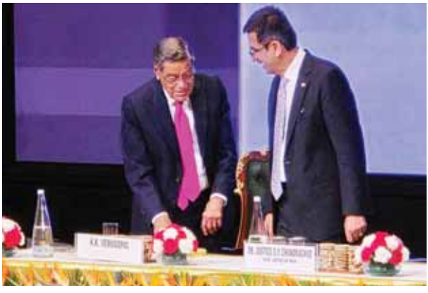
Former Attorney General KK Venugopal and CJI DY Chandrachud sharing lighter moments at MK Nambyar Memorial lecture

the garb of advisories. “Now, the IMF says India is the most-favoured global destination for investments and opportunity, and the World Bank calls India a role model on digitisation,” he said. Dhankhar said the 1990s were also an era of middlemen on the corridors of power, corruption was rampant and only a person with pedigree could get access to opportunities. “Now, the power corridors are fully sanitised. The middleman has disappeared... All transactions take place digitally, without a human interface. That is the change I never imagined,” he said. The vice president expressed satisfaction that recognition for the scientific community has increased significantly. “Soothing to note that in the last few years, recognition for the scientific community has gone up. It has gone up in several ways, including the government being very serious about it, and the prime minister’s heart and soul are deeply in the scientific community,” he said.