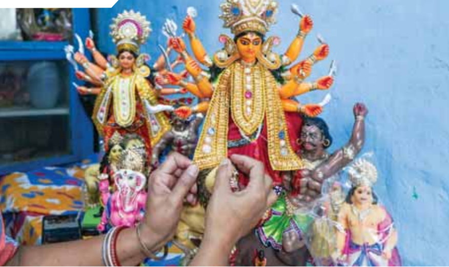
An artist gives finishing touches to a clay idol of Goddess at artisans' village Kumartuli, in Kolkata.