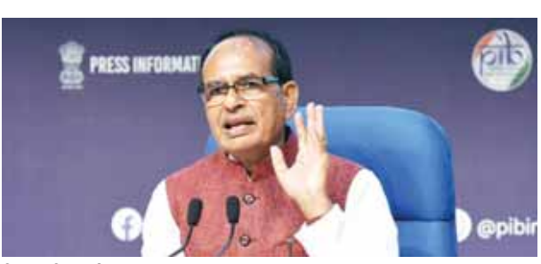
Shivraj Singh Chouhan at a press conference on 100 days achievements of the ministry at National Media Centre, in New Delhi on Thursday.

PIONEER NEWS SERVICE ■ NEW DELHI Agriculture Minister Shivraj Singh Chouhan on Thursday announced that the government will soon release the report of the committee on Minimum Support Price (MSP) for crops, which was established following the withdrawal of the three controversial farm laws. The minister also unveiled new initiatives aimed at modernizing agriculture and improving farmer engagement during a press briefing on the achievements of the Modi 3.0 government's first 100 days. ‘Adhunik Krishi Choupal’, a new programme featuring scientists sharing agricultural innovations with farmers, will be aired on Doordarshan and All India Radio from October. The minister will hold weekly interactions with farmers and agricultural leaders at the