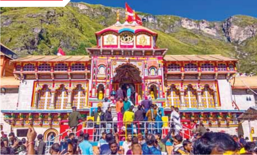
Pilgrims arrive at the Shri Badrinath Dham in Chamoli district