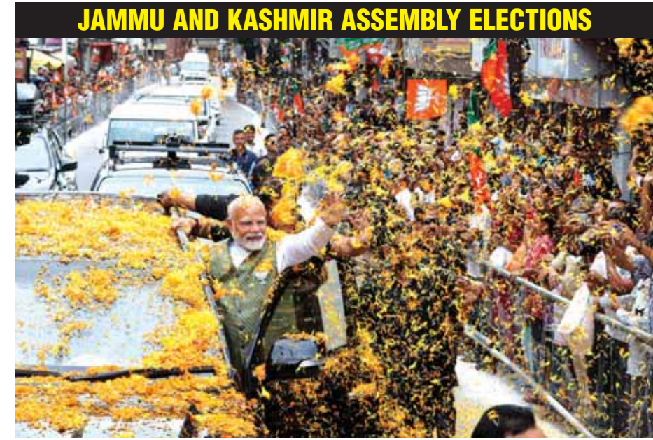
Prime Minister Narendra Modi during a roadshow for J and K Assembly elections, at Katra in Reasi district, Jammu and Kashmir, Thursday

He said that Pakistan has itself exposed the Congress and the National Conference. He went on to say that the BJP government will not allow the implementation of Pakistan's agenda in Jammu and Kashmir.