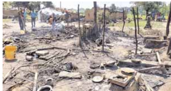
Charred remains are seen after multiple houses were allegedly set on fire, in Nawada district, Bihar, Thursday

Twenty-one houses were set on fire in Bihar's Nawada district near the Capital city Patna. Preliminary investigation suggested that a land dispute could be the cause behind the incident that happened in Manjhi Tola in Mufassil police station area on Wednesday late evening.