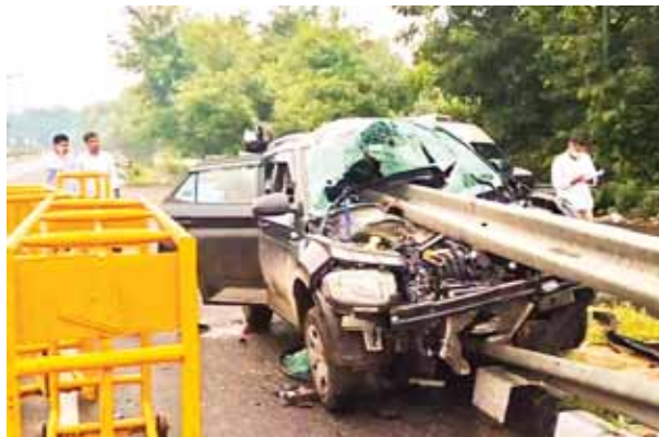
A damaged SUV after it crashed into a guardrail, in New Delhi, Thursday, September 19, 2024. At least two people suffered injuries in the accident, according to officials