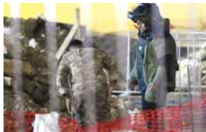
A Lebanese army bomb disposal specialist wearing a protective gear prepares, with his comrade, to detonate a walkie-talkie that was found at the parking of the American University Hospital, in Beirut, Lebanon