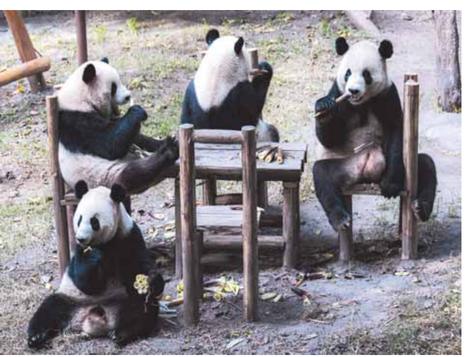
Giant pandas eat bamboo shoots around a table at a zoo in southwest China's Chongqing Municipality, Monday.