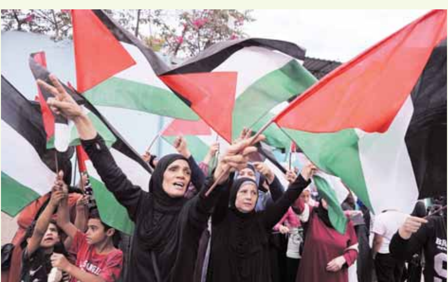
Palestinians in Lebanon wave their national flags during a protest in front of the United Nations Relief and Works Agency (UNRWA) headquarters in Beirut, Lebanon, Tuesday.

The announcement on Lebanon came after Israel's security Cabinet met late into the night. It said the Cabinet has "updated the objectives of the war" to include safely returning the residents of the