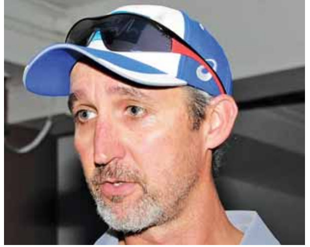
Lyon, is the best possible bowling attack that Australia can put out in the park," he added. The Rohit Sharma-led Indian team hasn't lost a series in the ongoing WTC cycle with India defeating West Indies (away) and England (home) and holding South Africa (away) to a draw. However, Gillespie is confident that Australia can beat the visitors. "They are red-hot, they are playing some good Test cricket for a while now. Even though they have beaten Australia in recent times, I think Australia have a chance to beat India this

PTI ■ MELBOURNE Australia's formidable bowling attack featuring Pat Cummins, Mitchell Starc, Josh Hazlewood and Nathan Lyon "can do the job" against "red hot" India in the Border-Gavaskar Trophy later this year, believes head coach of Pakistan's Test team Jason Gillespie. Since 2014-15, Australia have failed to lay their hands on the Border-Gavaskar Trophy with India winning four consecutive series, including the historic triumphs Down Under in 2018-19 and 2020-21. But Gillespie, who claimed 259 wickets in 71 Tests, feels Australian bowlers can reverse the trend. "I will be backing them in and I am sure they can do the job," the former Australian pacer told 'Fox Sports'. "They are the best bowlers in the country. Their records speak for themselves. This quartet, including Nathan