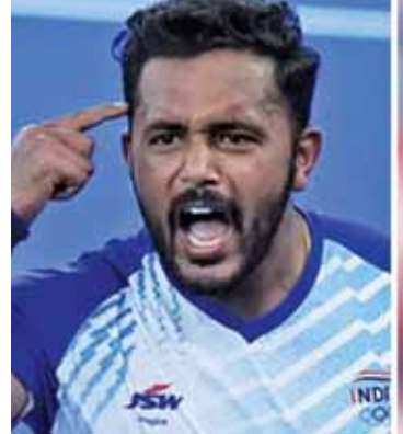
result. Those from National Associations count for a further 20 per cent. The fans and other players (20 per cent) as well as the media

composed of players, coaches and officials selected by each of their Continental Federations," the FIH said on its website. "The expert panel was provided access to match data from all international matches held in 2024, including Test matches, the FIH hockey Pro League, FIH Hockey Nations Cups, FIH Hockey Olympic Qualifiers and the Olympic Games Paris 2024 before establishing the final list of nominees." The voting process will remain open till October 11 for national associations (represented by their respective national teams' captains and coaches), fans, players, coaches, officials and media. "The votes of the Expert Panel count for 40 per cent of the overall