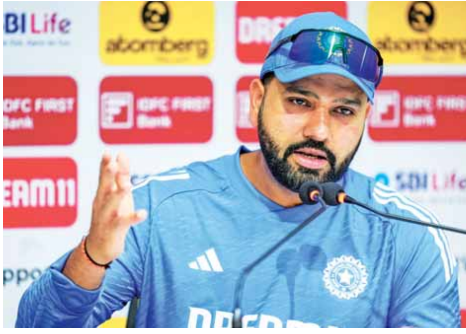
Abhishek Nayar in the Mumbai dressing room to underline his comfortable working relation with them. "It's a new (support) staff for sure, but I have known Gautam Gambhir and Abhishek Nayar long enough. Every support staff has its operating style, and that's what we were expecting. "I have worked with different coaches over 17 years of my

conference here on Tuesday. "But the matches that we engaged in (with the new staff) in Sri Lanka, they seemed to be sensible and understanding. They began to learn things pretty quickly within the team," he added. Dravid's tenure ended after India's T20 World Cup triumph in the West Indies and he will next be seen heading the coaching staff of IPL side Rajasthan Royals. Rathour and Mhambrey were replaced by Abhishek Nayar (assistant coach) and South African Morne Morkel (bowling coach), while former Dutch all-rounder Ryan ten Doeschate also joined as an assistant coach. While Nayar joining the team was largely a given, Morkel and Doeschate, who worked with Gambhir at the Kolkata Knight Riders in the IPL, beat former pacers R Vinayakumar and L Balaji in the race to spots among the India support staff. Rohit used his long association with Gambhir during the latter's playing days, and with