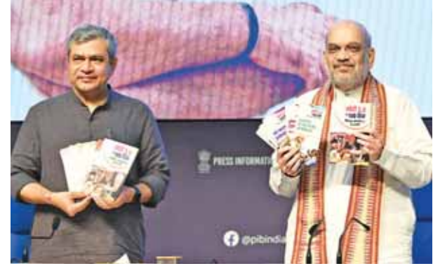
Union Home Minister Amit Shah with Minister of Railways, Ashwini Vaishnav at the release of a special booklet on achievements of first 100 days

Union Home Minister Amit Shah on Tuesday said the Government is talking to both the Meitei and Kuki communities in Manipur to ensure lasting peace and has begun fencing the country's border with Myanmar to check infiltration. He also said the BJP-led NDA Government will implement the 'one nation, one election' within its current tenure. Addressing a press conference here on the achievements of the 100 days of the Modi 3.0 Government, Shah said barring three days of violence last week, the overall situation in Manipur has been calm and the Government has been working to restore peace in the restive Northeastern State. Shah, flanked by Information and Broadcasting Minister Ashwini Vaishnav, said apart from the three days of violence, no major incidents were reported in the last three months. Asked about the possible visit of Prime Minister Narendra Modi to Manipur, Shah said, when he visits the State, it will