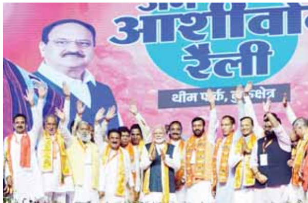
Haryana after a decade.

The BJP is aiming for a hat-trick in the state but faces a tough challenge from a resurgent Congress looking to cash in on the anti-incumbency factor to return to power in