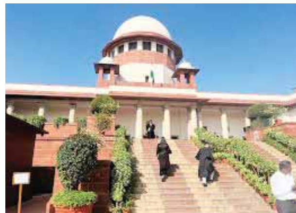
Manoj Misra asked the central agency to file a status report on the probe so far on the alleged financial irregularities in the medical departments of the hospital.

Refusing to stop streaming live proceedings in the suo motu case related to the incident, the apex court said it was a matter of public interest and the public must know what is transpiring in the courtroom. Meanwhile the apex court directed free online encyclopedia Wikipedia to remove the photograph and name of the resident doctor who was raped and murdered at the hospital. A bench comprising Chief Justice D Y Chandrachud and Justices J B Pardiwala and