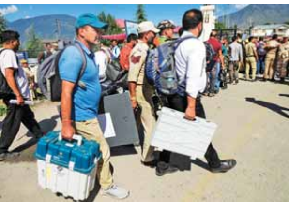
Polling officials leave for their respective polling stations on the eve of first phase of the Jammu and Kashmir Assembly election, in Kishtwar district, Tuesday