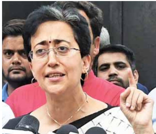
Delhi Minister Atishi addresses the media after a meeting of the AAP legislative party in which she was unanimously chosen as the next Chief Minister, in New Delhi, Tuesday, September 17, 2024

Delhi's wait for a 'full-time' functional Chief Minister ended on Tuesday after Aam Aadmi Party (AAP) leader and incumbent Minister in Delhi cabinet Atishi staked claim to lead the NCT Government shortly after Arvind Kejriwal resigned from the post he kept for almost 11 years including five months as CM from Tihar jail. Kejriwal is now released on bail in the liquor policy case. Chief Minister-designate Atishi handed over the letter of support from the AAP MLAs to Lieutenant-Governor Vinai Kumar Saxena and informed that she was chosen by the party as his successor. Kejriwal resigned on a day when the Prime Minister Narendra Modi turned 74 years and completed 100 days in his third term of the office. Atishi will be the third woman Chief Minister of Delhi after Sushma Swaraj and Sheila Dikshit. Dikshit was Delhi's longest-serving Chief Minister, who held the office for 15 years from 1998 to 2013, while Swaraj's tenure lasted 52 days in 1998. Atishi (43) will be Delhi's youngest Chief Minister and is also set to become the second current woman Chief Minister in the country after West Bengal's Mamata Banerjee. With a woman at the helm of the Delhi