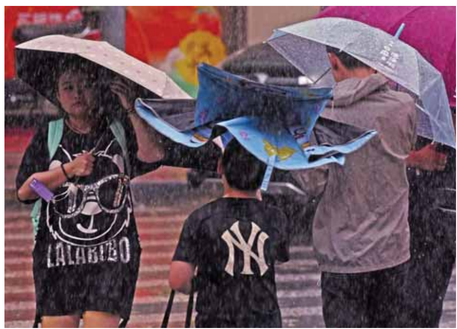
In this photo released by Xinhua News Agency, people brace for rain on a street as Typhoon Bebinca made landfall in Shanghai, China, Monday.

Long-time Jewish Chronicle columnist Jonathan Freedland resigned in protest on Sunday, saying "the latest scandal brings great disgrace on the paper" and that it has "departed from the traditions that built its reputation as the world's oldest Jewish newspaper". "Too often, the JC (Jewish Chronicle) reads like a partisan, ideological instrument, its judgements political rather than journalistic," Freedland wrote on the social media platform X.