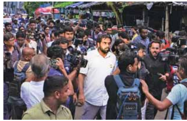
A delegation of junior doctors moves to board a bus from their dhama site near Swasthya Bhawan for a meeting with West Bengal Chief Minister Mamata Banerjee at her Kalighat residence, in Kolkata, West Bengal, Monday