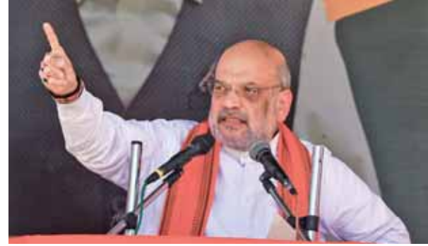
Union Home Minister Amit Shah speaks during a public meeting ahead of J&K Assembly elections, in Kishtwar district, Jammu & Kashmir, Monday