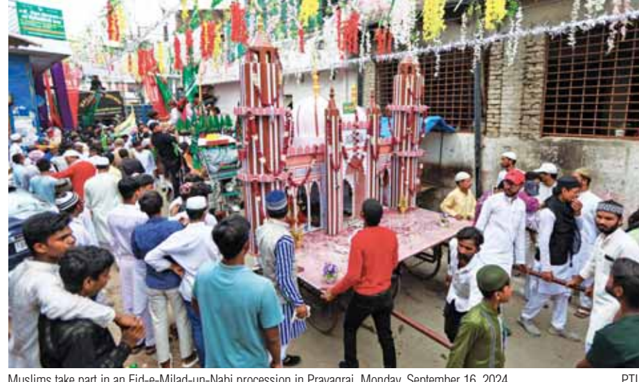
Muslims take part in an Eid-e-Milad-un-Nabi procession in Prayagraj, Monday, September 16, 2024