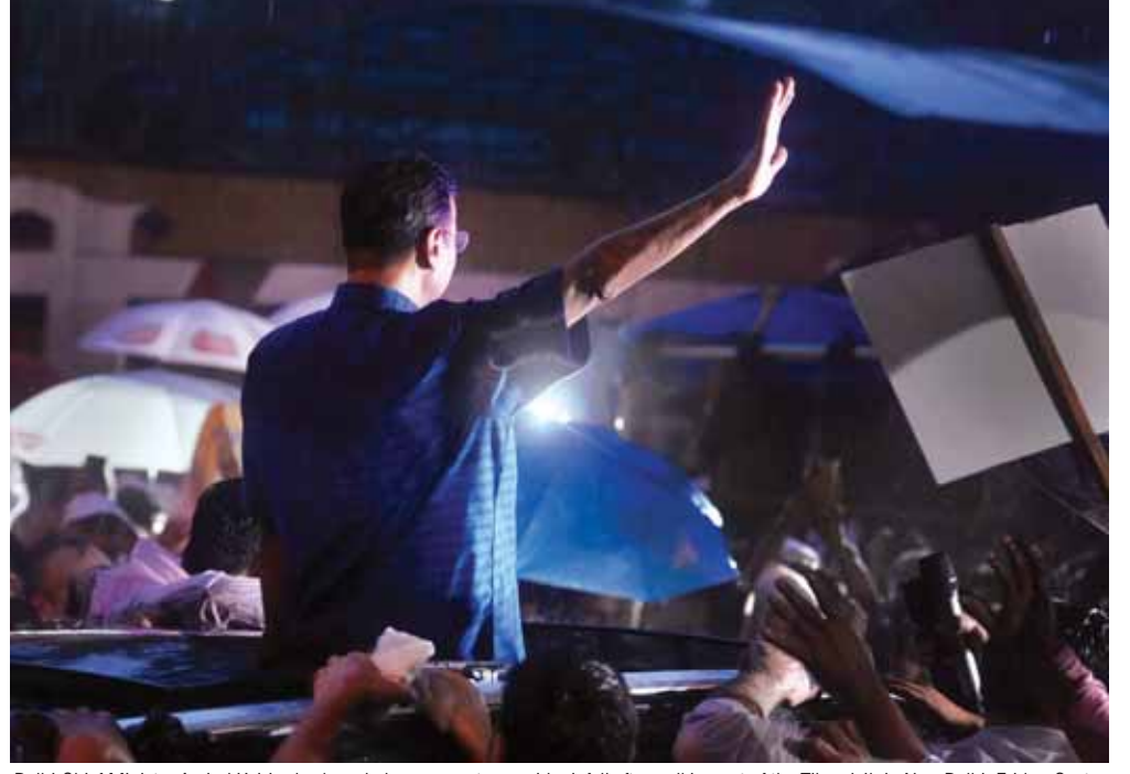
Delhi Chief Minister Arvind Kejriwal acknowledges supporters amid rainfall after walking out of the Tihar Jail, in New Delhi, Friday, Sept. 13, 2024. The Supreme Court (SC) on Friday granted bail to the AAP convener in a corruption case lodged by the Central Bureau of PTI Investigation (CBI) in connection with the excise policy 'scam'

It also restrained him from commenting on his role in the money-laundering case against him and asked him not to interact with witnesses and / or have access to official files connected with the case. With bail conditions that do not give him complete freedom to perform his duties as Chief Minister, including that he cannot visit the Secretariat or the CM Office therein or sign any files other than those that have to be cleared by the Lieutenant Governor, officials said that the AAP Government