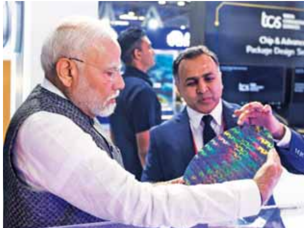
Prime Minister Narendra Modi at an exhibition during the inauguration of SEMICON India 2024, in Greater Noida, Uttar Pradesh, Wednesday.

Prime Minister Narendra Modi on Wednesday called for making India a global semiconductor hub and pointed out that this is the right time to invest in India's semiconductor industry. Modi said India is well-positioned for success in this field and that the world can count on India's growing semiconductor ecosystem. Modi said that India is now the eighth country globally to host an event focused on the semiconductor industry. Speaking at the SEMICON 2024 conference at Greater Noida, Modi said the Covid pandemic showed the importance of the supply chain and underscored the need to act to ward off any disruption. "Whether it was Covid or war, there hasn't been a single industry to remain unaffected by supply chain disruptions," he said. Stating that India is a huge consumer of such chips, he emphasised that the world's finest digital public infrastructure was built upon it. "This small chip is doing big things to ensure last-