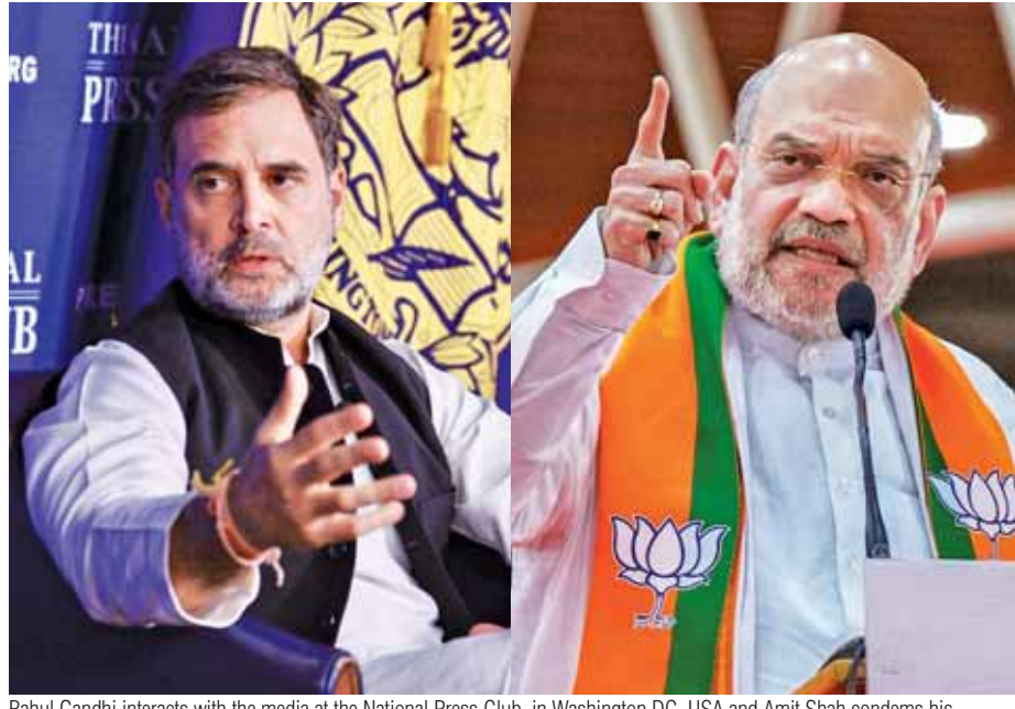
Rahul Gandhi interacts with the media at the National Press Club, in Washington DC, USA and Amit Shah condemns his anti-national statements.

Yet another foreign trip by Congress leader Rahul Gandhi has stoked another round of controversy in the political circles of India and the Centre and BJP Leaders on Wednesday also commented that Rahul Gandhi's quota remark in a foreign land has exposed the Congress "anti-reservation face" and making "anti-national statements" has become a habit for the former Congress chief. Sending a stern message to Rahul Gandhi, Home Minister Amit Shah said that as long as the BJP is there, no one can abolish reservation or mess with the nation's security. The senior BJP Leader's comments came after Rahul Gandhi told students of Georgetown University in the United States that the Congress would think of scrapping reservations when "India is a fair place", which he said is not the case right now. "Standing with forces that conspire to divide the country and making anti-national statements have become a habit for Rahul