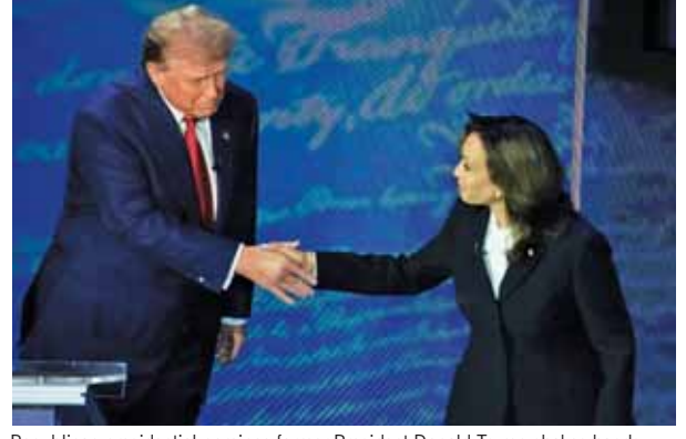
Republican presidential nominee former President Donald Trump shakes hands with Democratic presidential nominee Vice President Kamala Harris during an ABC News presidential debate at the National Constitution Center in Philadelphia.

Kamala Harris pressed a forceful case against Donald Trump on Tuesday in their first and perhaps only debate before the presidential election, repeatedly goading him in an event that showcased their starkly different visions for the country on abortion, immigration and American democracy. The Democratic vice president provoked Trump with reminders about the 2020 election loss that he still denies, delivered derisive asides at his false claims and sought to underscore the Republican former president's role in the Supreme Court's overturning of a national right to abortion two years ago. Trump tore into Harris as too liberal and a continuation of Biden's unpopular administration, as he launched into the sort of free-wheeling personal attacks and digressions from which his advisers and supporters have tried to steer him away. In one moment, Harris turned to Trump and said that as vice president, she had