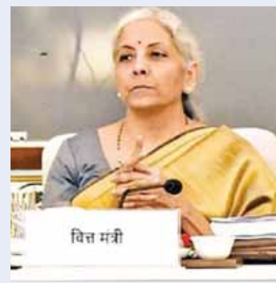
The 54 GST council meeting held under the finance minister Nirmala Sitharaman has brought some important relief to the middle class with deduction of tax cuts on sev-

eral items and services apart from cancer drugs. The middle class are burdened with penumbra of taxes on GST, results in upsetting the household budgets. Over the past few years, the taxes are being added up consistently, but the economic stature of the common man in the country are still the same. The banking sector in the country are grappling with cash crunch as the saving capacity of the people have gone down of inflationary spike. The Centre's gross GST collection for FY24 stood at Rs.20.18 lakh crore but the condition of economically crumbling the non-BJP states should also be improved and their GST share must be settled. The recommendation to constitute GOM to reduce GST from eighteen percent on health and insurance services seems reasonable and boost up these two sectors if implemented by October.