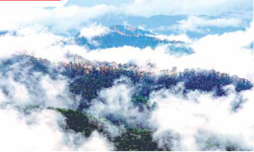
Low clouds cover the mountains after rainfall, in Shimla