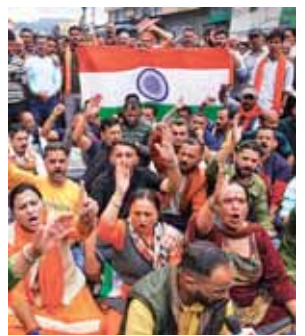
Members of Hindu organisations stage protest over illegal construction in a mosque, at Sanjauli, Shimla.