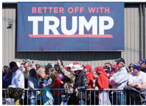
Supporters attend a campaign event for Republican presidential nominee former President Donald Trump at Central Wisconsin Airport, Saturday, in Mosinee.

With just days to go before his first — and likely only — debate against Vice President Kamala Harris, former President Donald Trump posted a warning on his social media site threatening to jail those "involved in unscrupulous behaviour" this election, which he said would be under intense scrutiny. "WHEN I WIN, those people that CHEATED will be prosecuted to the fullest extent of the Law, which will include long term prison sentences so that this Depravity of Justice does not happen again," Trump wrote, again sowing doubt about the integrity of the election, even though cheating is incredibly rare. "Please beware," he went on, "that this legal exposure extends to Lawyers, Political Operatives, Donors, Illegal Voters, & Corrupt Election Officials. Those involved in unscrupulous behaviour will be