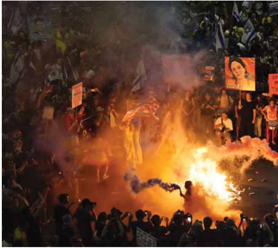
People protest against Prime Minister Benjamin Netanyahu's government and call for the release of hostages held in the Gaza Strip by the Hamas militant group, in Tel Aviv, Israel, Saturday

Three Israelis were shot and killed Sunday at the border crossing between the West Bank and Jordan, Israeli officials said, in what appeared to be an attack linked to the 11-month-old war in Gaza. The military said the gunman approached the Allenby Bridge Crossing from the Jordanian side in a truck and opened fire at Israeli security forces, who killed the assailant in a shootout. It said the three people killed were Israeli civilians. Israel's Magen David Adom rescue service said they were all men in their 50s. Jordan is investigating the shooting, its state-run Petra News Agency reported. The Western-allied Arab country made peace with Israel in 1994, but is deeply critical of its policies toward the Palestinians. Jordan has a large Palestinian population and has seen mass protests against Israel over the war in Gaza. The Allenby crossing over the Jordan River, also known as the King Hussein Bridge, is mainly used by Palestinians and international tourists, as well as for cargo shipments. The crossing has seen very few security incidents over the years, but in