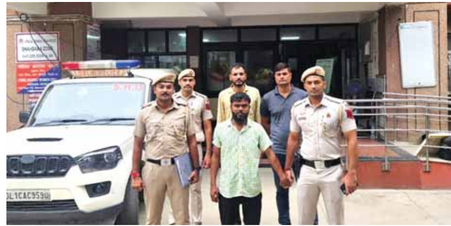
A 30-year-old man was arrested after four men allegedly opened fire outside a night club in Delhi's Shahdara.