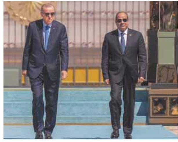
Turkish President Recep Tayyip Erdogan, left, and Egyptian President Abdel Fattah el-Sissi, second left, review an honour guard during a welcome ceremony prior to their meeting at the Presidential palace in Ankara, Wednesday.

Egyptian President Abdel Fattah el-Sissi on Wednesday is making his first official visit to Turkey since assuming power, after the two regional powers ended years of tensions. El-Sissi and Turkish President Recep Tayyip Erdogan are set to discuss bilateral relations, the conflict in Gaza and escalating tensions in the Middle East, among other topics.