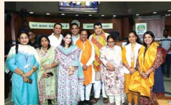
The Pioneer photo