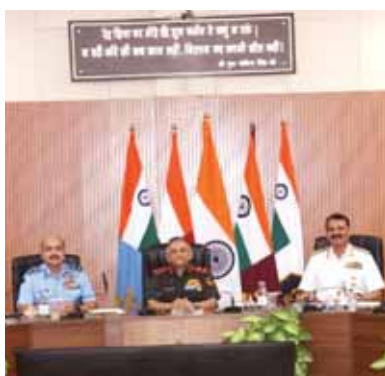
The Chief of Defence Staff General Anil Chauhan attends First Joint Commanders' Conference, in Lucknow

India's top military commanders on Wednesday held extensive deliberations in Lucknow on the Government's ambitious plans to create 'Integrated Theatre Commands' and assessed overall national security challenges including the ones along the frontiers with China and Pakistan. Chaired by the Chief of Defence Staff (CDS), General Anil Chauhan, with chiefs of the Army, Navy and the Air Force and other top military officers in attendance, the deliberations primarily focused on setting up of joint command and control centres and logistics nodes, on the inaugural day of the two-day maiden joint commanders conference, being held in Lucknow, officials said. In his opening address, General Chauhan stressed the need for operational preparedness to meet emerging challenges, underscoring the need of modernisation to stay combat-ready and relevant and achieve strategic autonomy. The theme of the maiden joint commanders' conference is 'Sashakt and Surakshit Bharat: Transforming Armed Forces'. The deliberations on ensuring synergy among the armed forces on various aspects including financial planning, joint logistics infrastructure are taking place amid the Government's ambitious plans to roll out theatre commands. Under the theatrisation model, the