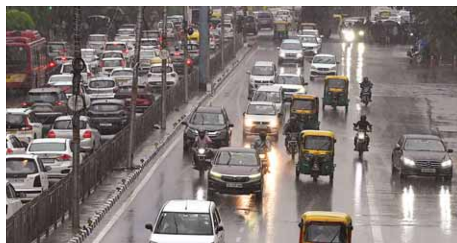
Traffic jam at ITO in New Delhi on Wednesday after rain

Heavy rain lashed parts of Delhi-NCR, including Gurugram and Noida, on Wednesday afternoon leading to severe waterlogging on streets, roads and traffic congestion in several places in the Capital city. Huge traffic snarls were seen in parts of Delhi, including in South, Central, North, New Delhi and parts of Noida and Gurugram. The India Meteorological Department (IMD) has issued a yellow alert for the city. A yellow alert denotes bad weather and the possibility of the weather conditions worsening and disrupting daily life. Heavy waterlogging in various parts of Delhi left arterial junctions choked amid the traffic police issuing advisory to the commuters who were caught in prolonged traffic jams. In the past 24 hours till 8 am on Wednesday, city's primary weather station Safdarjung received 0.8 mm of rainfall, Lodi road 1.4 mm of rainfall, Narela 16 mm of rainfall, Palam 0.3 mm of rainfall, Ridge 0.8 mm of rainfall, Pitampura one mm of rainfall, Pusa 0.5 mm of rainfall and Mayur Vihar's Salwan public school 0.5 mm of rainfall.