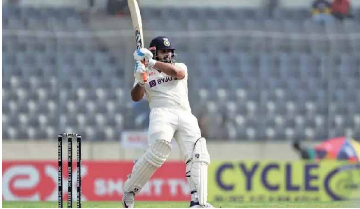
BOWLING BACK-UP: India have been well-served by the troika of Jasprit Bumrah, Mohammed Siraj and Mohammed Shami in Tests for a while now, but it's unwise to enter a long Test season without sufficient alternates. More so because Siraj will miss the first round of Duleep

contenders are there for the wicketkeeper-batter's slot. The front-runner is Dhruv Jurel (Team A), who was impressive in his debut series against England earlier this year. Then there's Ishan Kishan, who will play for Team D which is marshalled by Shreyas Iyer at Anantapur. Kishan, though a long shot, will be eager to use Duleep Trophy as a platform to stake his claim for an India return after an unsavoury train of incidents saw him losing the BCCI central contract in the current cycle. The return of veterans Virat Kohli and Rohit Sharma for the Bangladesh series will gobble up two batting slots along with Gill at No. 3. Hence, there will be a jostle between KL Rahul, Shreyas Iyer, Sarfaraz Khan, who impressed all with an excellent Test debut against England, for settling into the available middle-order space. It's imperative for Rahul, who is in Team A as a pure batter, and Shreyas to come good in Duleep Trophy as they missed a large chunk of the home matches against England - the former with an injury and the latter was dropped after the second Test at Visakhapatnam.