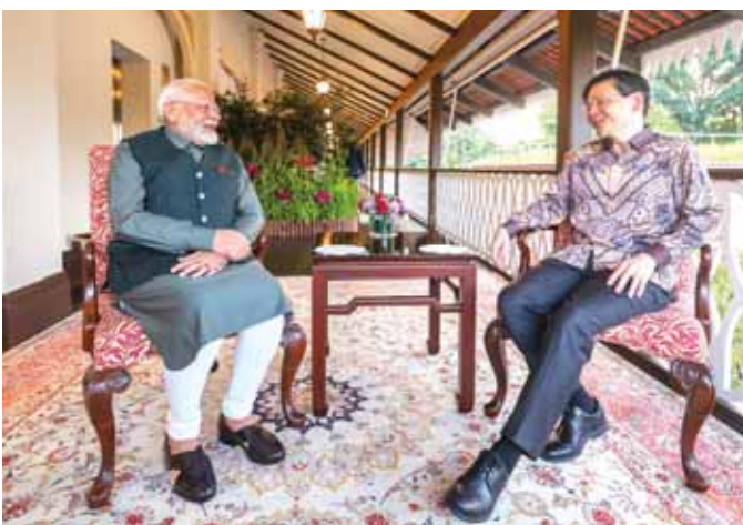
Prime Minister Narendra Modi during a meeting with Prime Minister of Singapore Lawrence Wong, in Singapore, on Wednesday