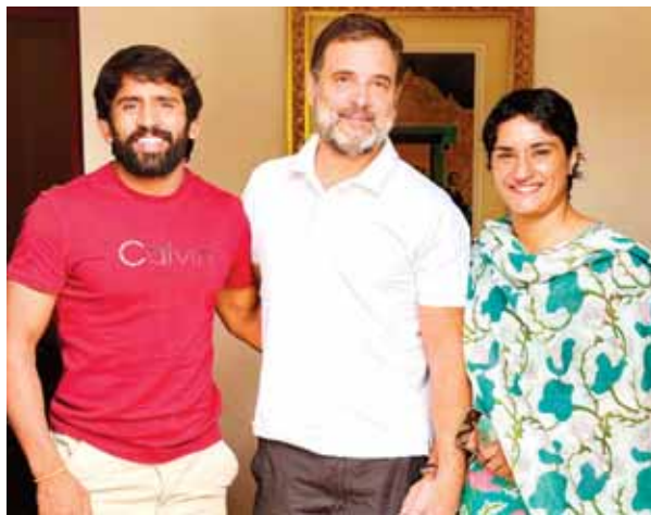
Leader of the Opposition Rahul Gandhi with wrestlers Vinesh Phogat and Bajrang Punia in New Delhi