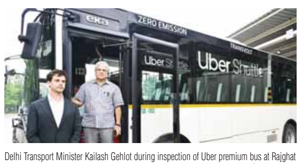
Delhi Transport Minister Kailash Gahlot during inspection of Uber premium bus at Rajghat Depot, in New Delhi, Wednesday