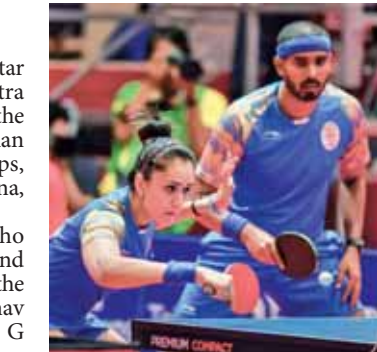
"The selection process was rigorous, with the TTFI giving precedence to the world ranking, international experience, and