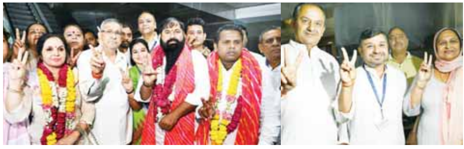
Winners of MCD ward committee polls after declaration of results in New Delhi, on Wednesday

This came soon after the Ministry of Home Affairs issued a gazette notification expanding the powers of the Delhi Lt Governor, giving him the authority to constitute any board, commission, authority, or statutory body, which lay exclusively under the President's jurisdiction earlier. The notification was issued under clause (1) of article 239 of the Constitution and section 45D of the Government of National Capital Territory of Delhi Act, 1991 (1 of 1992). The Lt Governor said in a letter that "after waiting for Mayor" to take a decision till 8:00 pm on Tuesday, the MCD Commissioner approached him seeking his directions to appoint. After that, he decided to use his constitutional and statutory