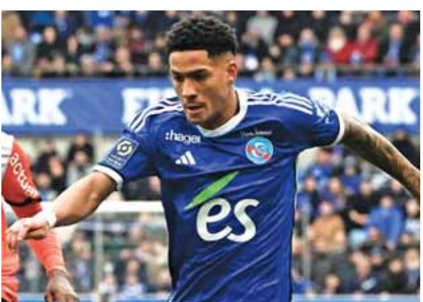
permanent deal to Al Nassr - where Cristiano Ronaldo where the move was announced a day after the Saudi transfer window shut and will help