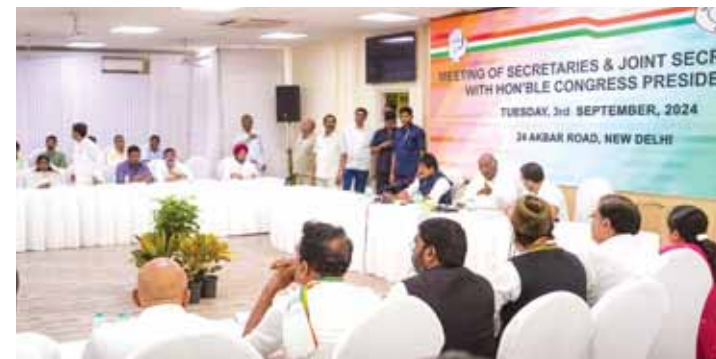
Leader of Opposition in Lok Sabha and Congress MP Rahul Gandhi with party president Mallikarjun Kharge and party MP KC Venugopal during meeting with party secretaries and joint secretaries, in New Delhi, on Tuesday

Ironically, the State Congress leaders in Haryana have rejected the possibility of any alliance with AAP in the State. Recently, senior