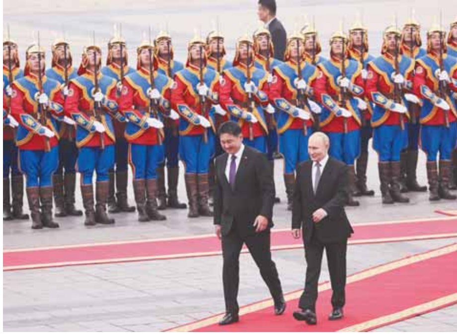
Russian President Vladimir Putin, right, walks with Mongolian President Ukhnaagiin Khurelsukh, left, during welcoming ceremony at Sukhbaatar Square in Ulaanbaatar, Mongolia, Tuesday.

The warrant puts the Mongolian government in a difficult position. After decades under communism with close ties to the Soviet Union, it transitioned to democracy in the 1990s and has built relations with the United States, Japan and other new partners. But it remains economically dependent on its two much larger and more powerful neighbours, Russia and China. Russia supplies the landlocked country with most of its fuel and a sizeable