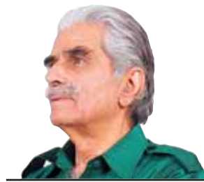
ASHOK K MEHTA

The recent visit of a bipartisan delegation of U S lawmakers to New Delhi and Dharamshala marks a significant moment in the US diplomacy in the region