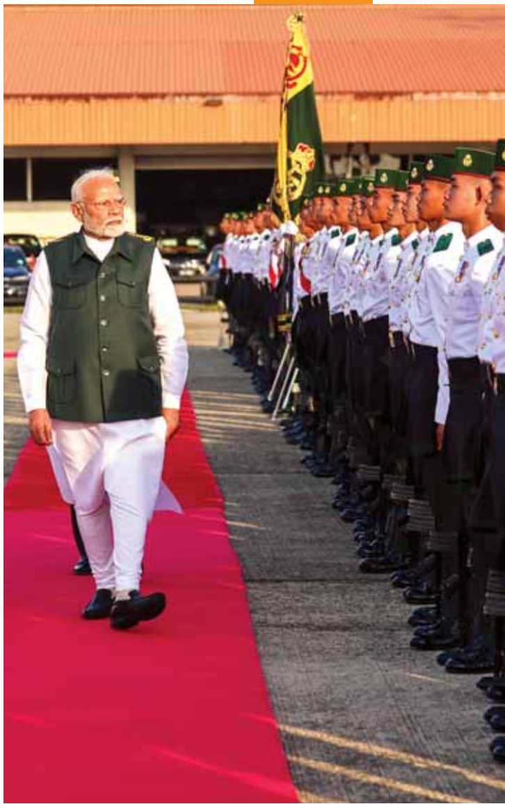
PM receives a ceremonial welcome in Brunei on Tuesday