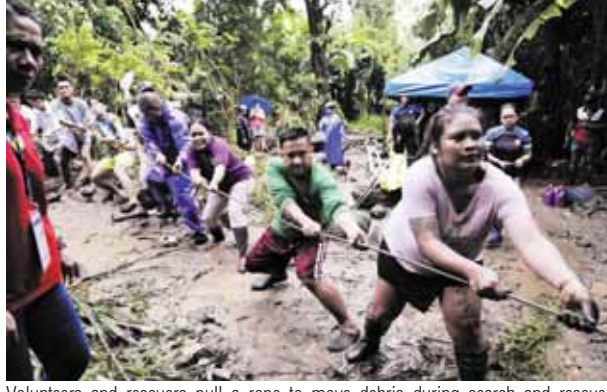
Volunteers and rescuers pull a rope to move debris during search and rescue operations for missing residents after a landslide caused by Tropical Storm Yagi, locally called Enteng, hit their village at San Luis, Antipolo city, Rizal province, Philippines on Tuesday.

It was forecast to strengthen into a typhoon as it barrels north-westward over the sea toward southern China. Storm warnings remained in most northern Philippine provinces, where residents were warned of the lingering danger