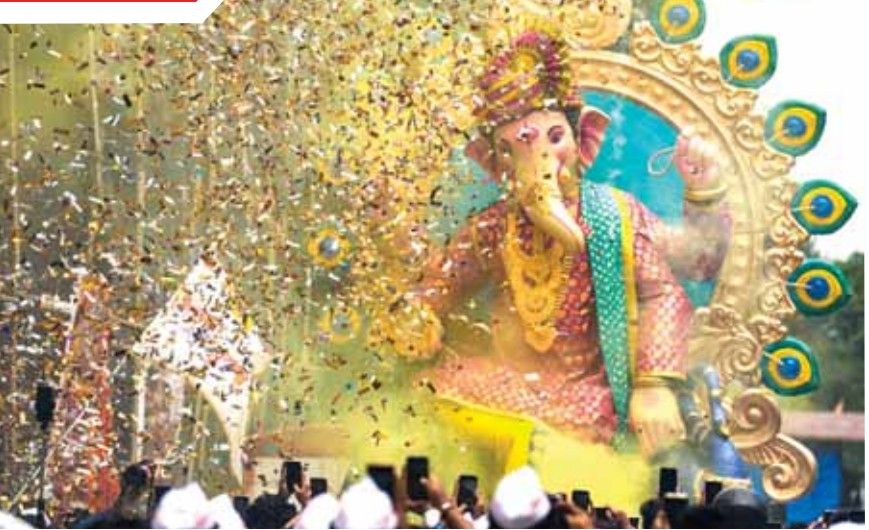
Devotees carry an idol of Lord Ganesha ahead of the Ganesh Chaturthi festival, in Mumbai