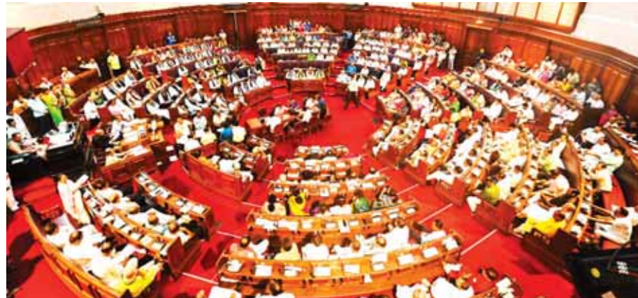
West Bengal Chief Minister Mamata Banerjee speaks during a Session of the State Legislative Assembly, in Kolkata, on Tuesday. The Aparajita Woman and Child (West Bengal Criminal Laws and Amendment) Bill 2024 was passed during the Session

Apart from prescribing life imprisonment until death, the Bill, christened 'Aparajita Woman and Child Bill (West Bengal Criminal Laws and Amendment) 2024, provides for death penalty for a repeat