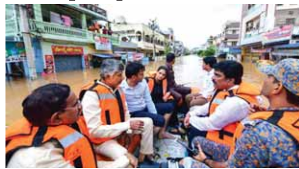
Andhra Pradesh Chief Minister N Chandrababu Naidu with others during a visit to a flood-hit area in Vijayawada