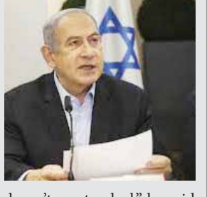
doesn't want a deal," he said. Critics in Israel have accused Netanyahu of dragging his feet in cease-fire talks — a charge he denies.

Jerusalem: Israeli Prime Minister Benjamin Netanyahu has expressed sorrow over the deaths of six hostages, saying the killings prove that Hamas does not want a cease-fire deal. Netanyahu said Sunday that he was heartbroken to hear the news of the hostages' deaths. He accused Hamas of killing them in "cold blood" and said Israel would hold the group accountable. He also accused the group of scuttling ongoing cease-fire efforts. "Whoever murders hostages