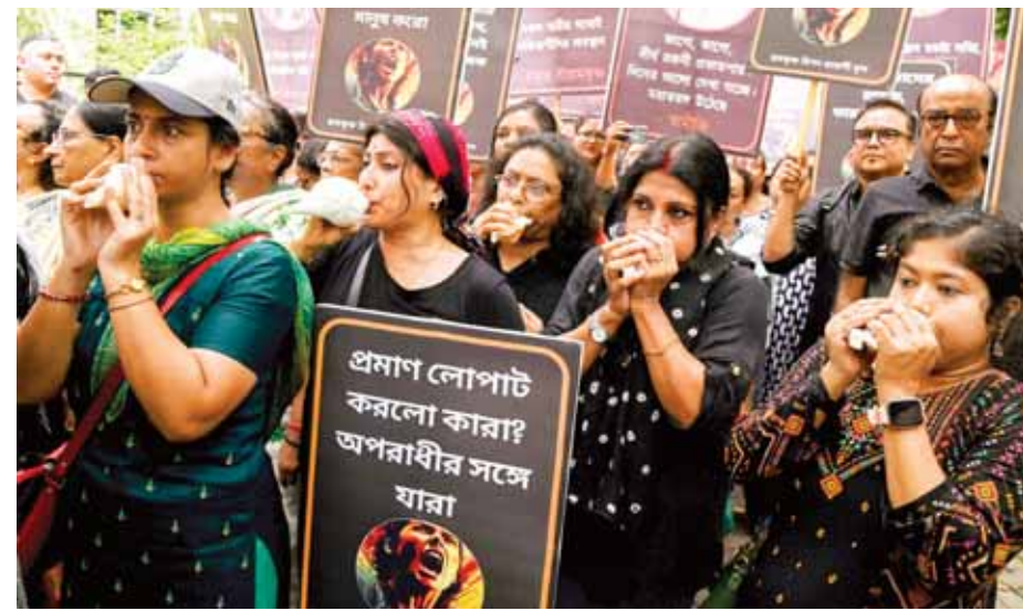
Ramkrishna Mission alumni wearing black dresses blow conches during a protest rally demanding justice for the victim of R G Kar Medical College and Hospital incident, in Kolkata, on Sunday