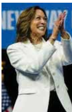
be clear: the former president disrespected sacred ground, all for the sake of a political stunt," Harris said, calling Arlington a "solemn place where we come together to honour American heroes ...

US Vice President Kamala Harris said former President Donald Trump "disrespected sacred ground" in his recent appearance at Arlington National Cemetery, where the Republican nominee took and distributed images despite a federal prohibition on campaign activity on the grounds. Harris, in a statement posted Saturday on the social media platform X, cited reports that Trump's campaign aides created an altercation with a cemetery staffer and proceeded to take photographs and film the former president, including at the graves of Afghanistan war veterans, after being warned about rules at the site. "Let me