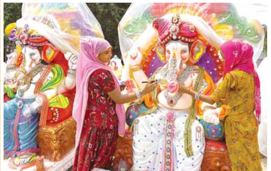
Artists give final touches to an idol of Lord Ganesha ahead of Ganesh Chaturthi festival at a roadside stall in New Delhi on Sunday