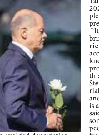
and avoided deportation. In recent days, Chancellor Olaf Scholz's government has announced new restrictions on knives and new measures to ease deportations. On Friday, it deported Afghan nationals to their homeland for the first time since the

German leaders paid tribute on Sunday to the three people killed in the August 23 knife attack by a suspected Islamic extremist, which has pushed immigration back to the top of the country's political agenda. Eight people also were wounded in the attack at a "Festival of Diversity" marking the 650th anniversary of the city of Solingen in western Germany. President Frank-Walter Steinmeier said at a memorial event in a city theatre that he was "relieved and thankful" that none of them is now in serious danger. The 26-year-old Syrian suspect, who was arrested a day after the attack, was supposed to be deported to Bulgaria last year but reportedly disappeared for a time