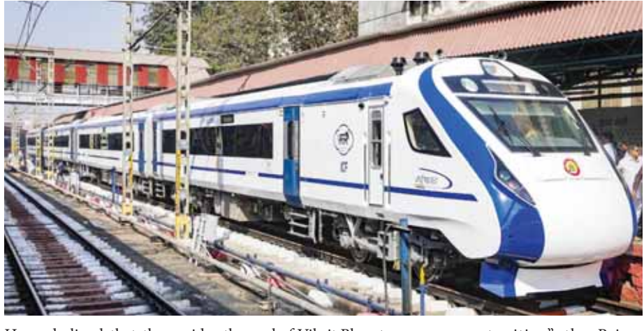
He underlined that the rapid development of southern States was imperative to accomplish the goal of Viksit Bharat. "Southern India is the land of immense talent, resources and opportunities," the Prime Minister said adding that the development of Tamil Nadu,

Bengaluru, and Chennai with Nagercoil. "Through its hard work over the years, the railways have made big strides in addressing long-standing issues and offered new hopes and solutions. We will not stop until the Indian Railways becomes a guarantee of comfortable travel for everyone," Modi said. The Prime Minister said modern rail infrastructure was a strong pillar of the vision of Viksit Bharat. He said more than Rs 2.5 lakh crore was allocated to the railways in this year's Budget and the Government was connecting Indian Railways with high-tech services to transform its old image.