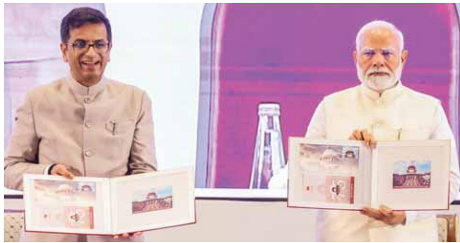
Prime Minister Narendra Modi with Chief Justice of India DY Chandrachud during the inauguration of the National Conference of District Judiciary, in New Delhi, on Saturday

Speaking at the National Conference of District Judiciary in Delhi, the Prime Minister emphasised that atrocities against women and the safety of children were a serious concern in society today. On this occasion, the Prime Minister also unveiled the stamp and coin commemorating 75 years of the establishment of the Supreme Court of India. The two-day conference was organised by the Supreme Court of India to discuss the issues related to the district judiciary such as infrastructure and human resources, inclusive courtsrooms for all, judicial security and judicial wellness, case management and judicial training.