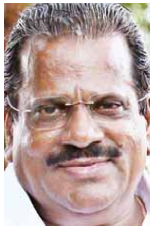
Raja, former flame of the CPI, had demanded the

manner other than saying that the latter was not competent enough to continue as convener of the LDF. But Govindan stated that Jayarajan's meetings with Javadekar was one of the reasons that created a lot of controversy. "I'll react to the decision at the appropriate time," Jayarajan told the media persons. In yet another development, the CPI(M) gave a tight slap on the face of the CPI, its poor cousins, for that party's demand to oust movie actor Mukesh MLA from the party as well as the membership of the legislative assembly. Annie