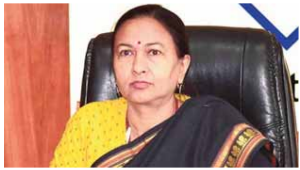
Pensions, Government of India and six-month extension