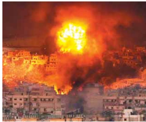
Flames rise after an Israeli airstrike in the southern suburbs of Beirut, Lebanon, Saturday