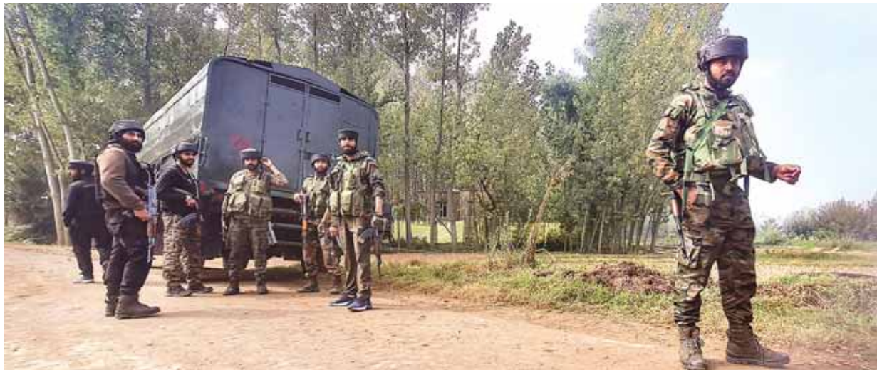
Security personnel stand guard after an encounter broke out between terrorists and security forces during cordon and search operation at Adigam village, in Kulgam district, Saturday