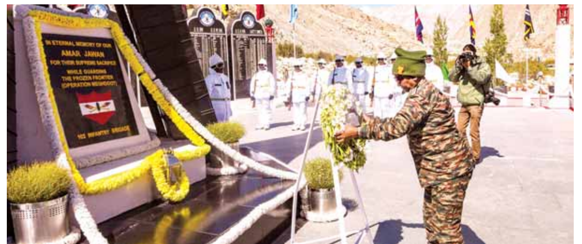
President Droupadi Murmu pays tribute at the Siachen War Memorial during a visit to Siachen Base Camp, on Thursday