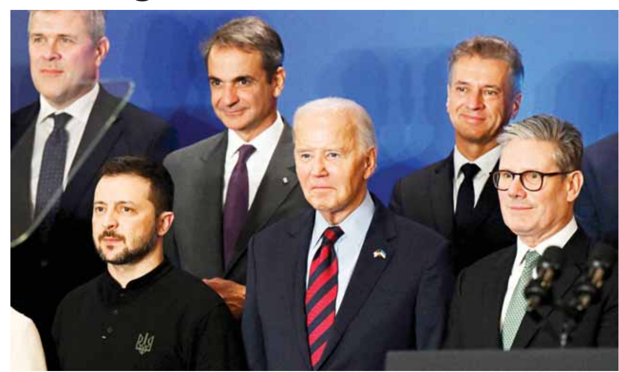
U.S. President Joe Biden, center, with Ukraine's President Volodymyr Zelensky, left, Britain's Prime Minister Keir Starmer, right, and other world leaders pose for a family picture of the launching of a Joint Declaration of Support for Ukrainian Recovery and Reconstruction, Wednesday in New York.