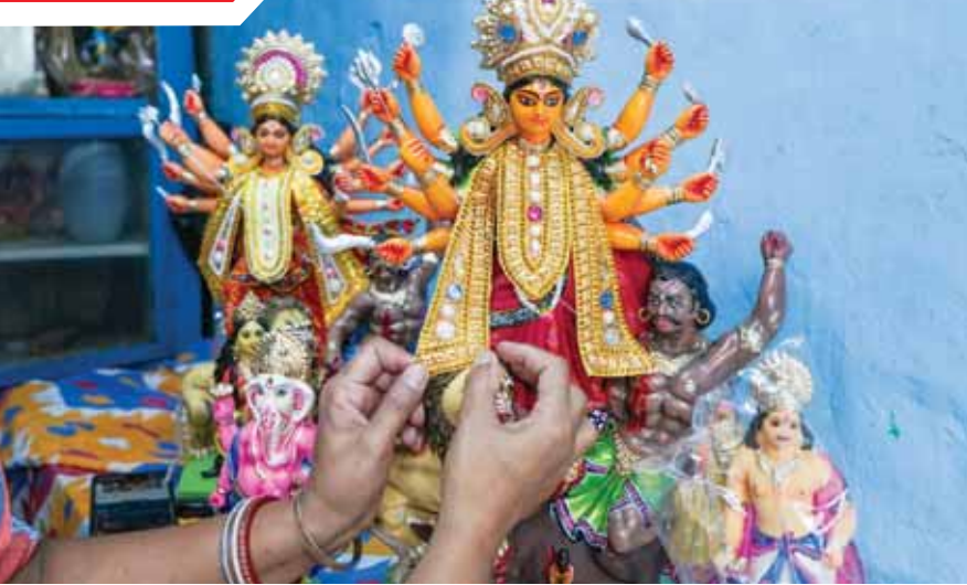
An artist gives finishing touches to a clay idol of Goddess at artisans' village Kumartuli, in Kolkata.