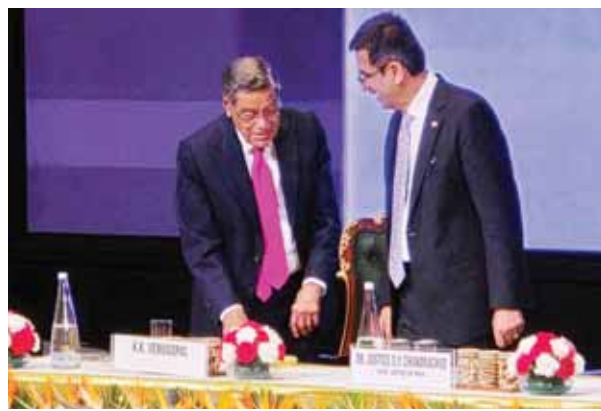
Former Attorney General KK Venugopal and CJI DY Chandrachud sharing lighter moments at MK Nambyar Memorial lecture

the garb of advisories. "Now, the IMF says India is the most-favoured global destination for investments and opportunity, and the World Bank calls India a role model on digitisation," he said. Dhankhar said the 1990s were also an era of middlemen on the corridors of power, corruption was rampant and only a person with pedigree could get access to opportunities. "Now, the power corridors are fully sanitised. The middleman has disappeared.... All transactions take place digitally, without a human interface. That is the change I never imagined," he said. The vice president expressed satisfaction that recognition for the scientific community has increased significantly. "Soothing to note that in the last few years, recognition for the scientific community has gone up. It has gone up in several ways, including the government being very serious about it, and the prime minister's heart and soul are deeply in the scientific community," he said.