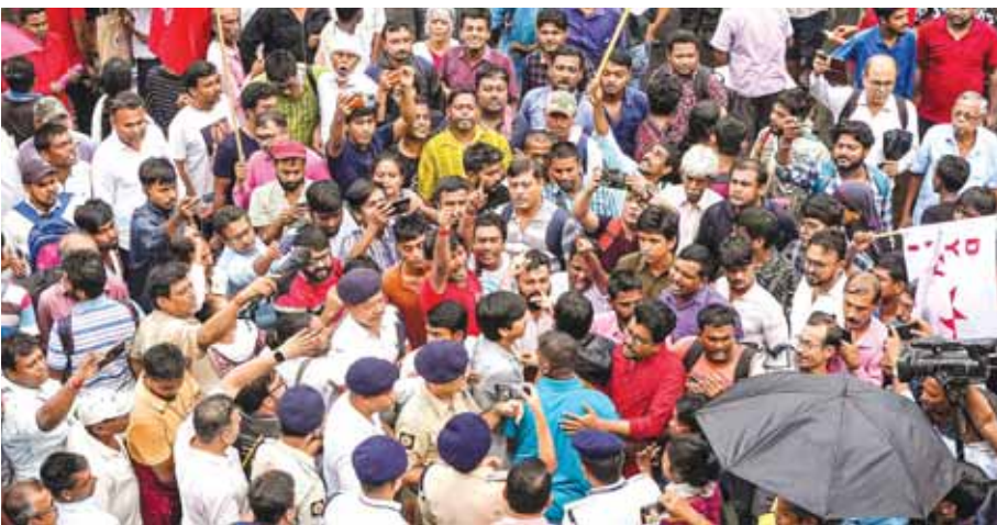
Activists of various left wing parties clash with police personnel during a protest march against the alleged sexual assault and murder of a trainee doctor at RG Kar Medical College and Hospital, in Kolkata, Thursday