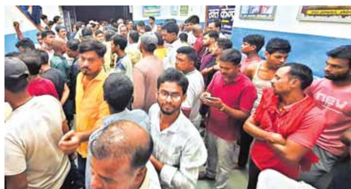
People gather at a government hospital after their family members drowned while taking holy dips in rivers and ponds during the 'Jivitputrika' festival on Wednesday, in Aurangabad district of Bihar, Thursday, Sept. 26, 2024. At least 43 people, including 37 children, drowned and three others went missing in separate incidents in 15 districts of the state, according to officials