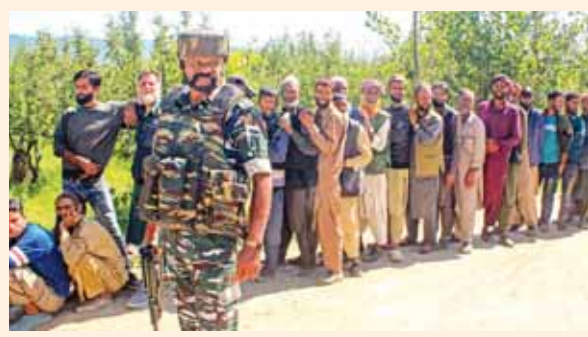
Shopian: Voters wait in a queue at a polling station during the first phase of Assembly elections, in Shopian district of south Kashmir, Wednesday

During the 2014 Assembly polls, Jammu and Kashmir witnessed 65.91 per cent voter turnout. PK Pole said the overall polling percentage may witness marginal correction as several polling parties from remote areas were yet to report to their headquarters. Overall voter turnout of