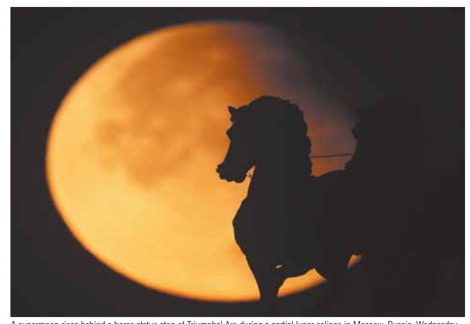
A supermoon rises behind a horse statue atop of Triumphal Arc during a partial lunar eclipse in Moscow, Russia, Wednesday