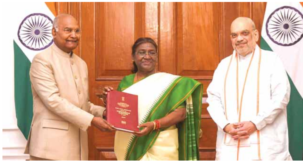
President Droupadi Murmu being presented a report on simultaneous elections in the country by former President Ram Nath Kovind who heads High-Level Committee (HLC) on 'One Nation, One Election', and Home Minister Amit Shah, at Rashtrapati Bhavan in New Delhi

Among the national parties, the Congress, Aam Aadmi Party (AAP), the Bahujan