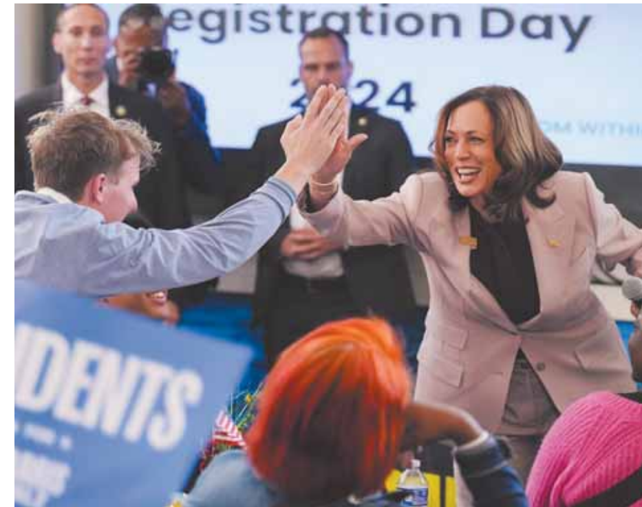
Democratic presidential nominee Vice President Kamala Harris is greeted as she during an unscheduled stop to make remarks at Community College of Philadelphia, Tuesday in Philadelphia.

evacuees, but Portuguese state broadcaster RTP has shown charred houses in rural villages and local residents trying to battle flames with buckets of water, hoses, and even large tree branches. Other televised images showed visibility reduced to a few metres as orange smoke enveloped the terrain. Three firefighters died in their vehicle on Tuesday, while another had succumbed to what authorities called a "sudden illness" while on duty over the weekend. Three civilians have also perished, according to civil protection authorities. Portugal was devastated by massive fires in 2017 that killed over 120 people. Experts link the fires to both climate change and the abandonment of traditional farming and forestry professions that helped keep rural areas clear of underbrush that is now fuel for fires.