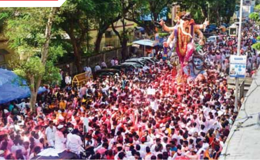
Devotees take part in a procession to immerse an idol of Lord Ganesha at the end of the Ganpati festival, in Mumbai.