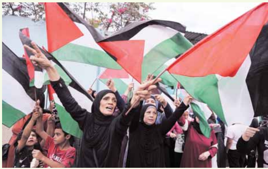
Palestinians in Lebanon wave their national flags during a protest in front of the United Nations Relief and Works Agency (UNRWA) headquarters in Beirut, Lebanon, Tuesday.

The announcement on Lebanon came after Israel's security Cabinet met late into the night. It said the Cabinet has "updated the objectives of the war" to include safely returning the residents of the