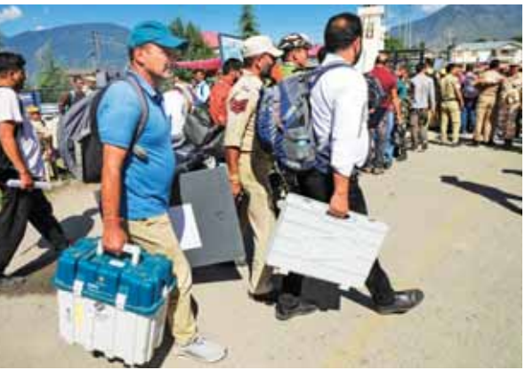
Polling officials leave for their respective polling stations on the eve of first phase of the Jammu and Kashmir Assembly election, in Kishtwar district, Tuesday.