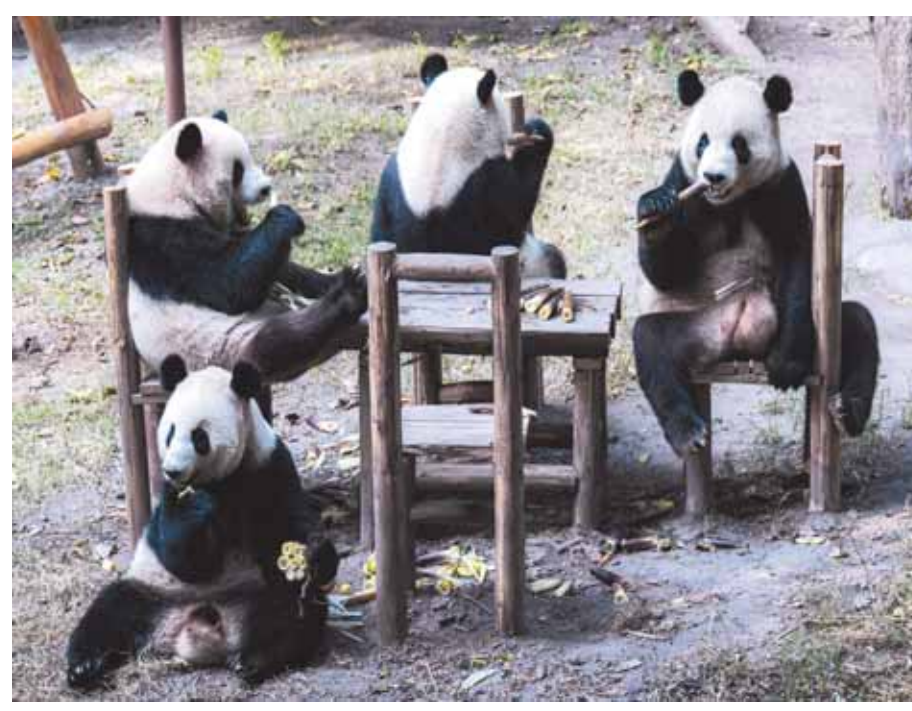
Giant pandas eat bamboo shoots around a table at a zoo in southwest China's Chongqing Municipality, Monday.