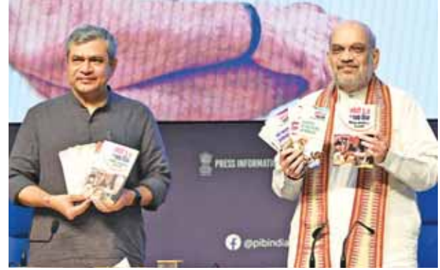
Union Home Minister Amit Shah with Minister of Railways, Ashwini Vaishnav at the release of a special booklet on achievements of first 100 days.

Union Home Minister Amit Shah on Tuesday said the Government is talking to both the Meitei and Kuki communities in Manipur to ensure lasting peace and has begun fencing the country's border with Myanmar to check infiltration. He also said the BJP-led NDA Government will implement the 'one nation, one election' within its current tenure. Addressing a press conference here on the achievements of the 100 days of the Modi 3.0 Government, Shah said barring three days of violence last week, the overall situation in Manipur has been calm and the Government has been working to restore peace in the restive Northeastern State. Shah, flanked by Information and Broadcasting Minister Ashwini Vaishnav, said apart from the three days of violence, no major incidents were reported in the last three months. Asked about the possible visit of Prime Minister Narendra Modi to Manipur, Shah said,