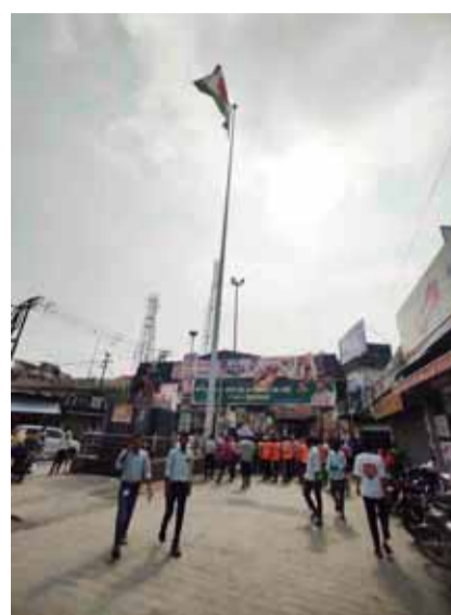
a zero-plastic-waste principle

The Municipal Corporation of Kashipur (MCK) organised a cleanliness awareness rally on the theme of Swabhav Swachhata - Sanskar Swachhata (Behavioural Cleanliness - Cultural Cleanliness) on Tuesday under the Swachhata Hi Seva campaign. The corporation also organised an oath ceremony and a symposium on the occasion.