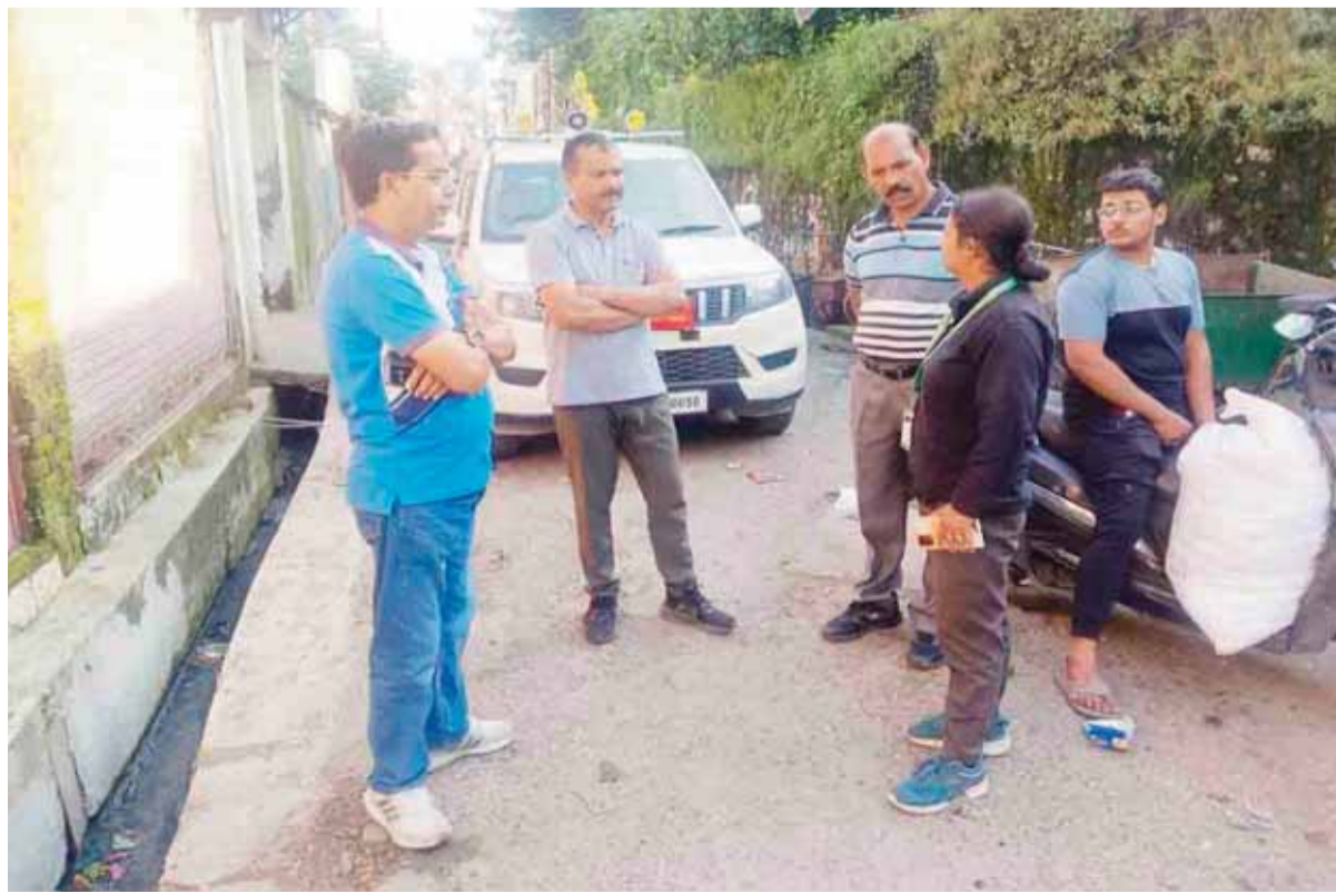
Municipal Corporation of Dehradun officials interact with a local resident while checking sanitation in the city on Monday

negative impacts on flora, fauna, biodiversity and more. Sharma recommended that individuals should take responsibility for environmental health by choosing eco-friendly Ganesh idols made from materials like cow dung and clay. Moreover, he urged the State government to impose restrictions on the sale of Ganesh idols made from harmful materials to protect water bodies. Sharma also stressed the need for collaboration between NGOs and the government to educate the public about the significance of preserving water bodies.