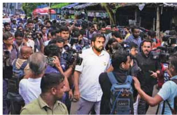
A delegation of junior doctors moves to board a bus from their dhama site near Swasthya Bhawan for a meeting with West Bengal Chief Minister Mamata Banerjee at her Kalighat residence, in Kolkata, West Bengal, Monday