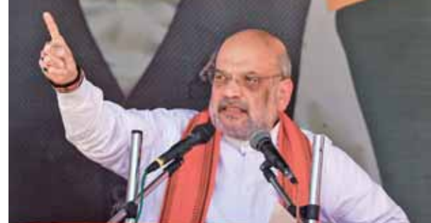
Union Home Minister Amit Shah speaks during a public meeting ahead of J&K Assembly elections, in Kishtwar district, Jammu & Kashmir, Monday

Launching a frontal attack on the pre-poll alliance partners, Congress and the National Conference on the last day of campaigning in Kishtwar, Union Home Minister Amit Shah on Monday appealed to the voters in the region to punish these parties by voting in favour of the BJP as they (Congress-National Conference) have always "nurtured and nourished" terrorism. Shah vowed to "bury terrorism deep into the earth so that it would not be able to rear its head again." Addressing three back-to-back election rallies in the region Shah said there is a clear fight between the Congress-National Conference alliance and the BJP — one wanting to bring back Article 370, and the other committed to stopping it. Shah reiterated the Constitution's Article 370, which gave special status to J and K, is history and will never come back. The Home Minister also paid tributes to all those who have been killed in terror-related incidents, and specially referred to the deaths of BJP leaders Anil Parihar, Ajit Parihar and RSS leader