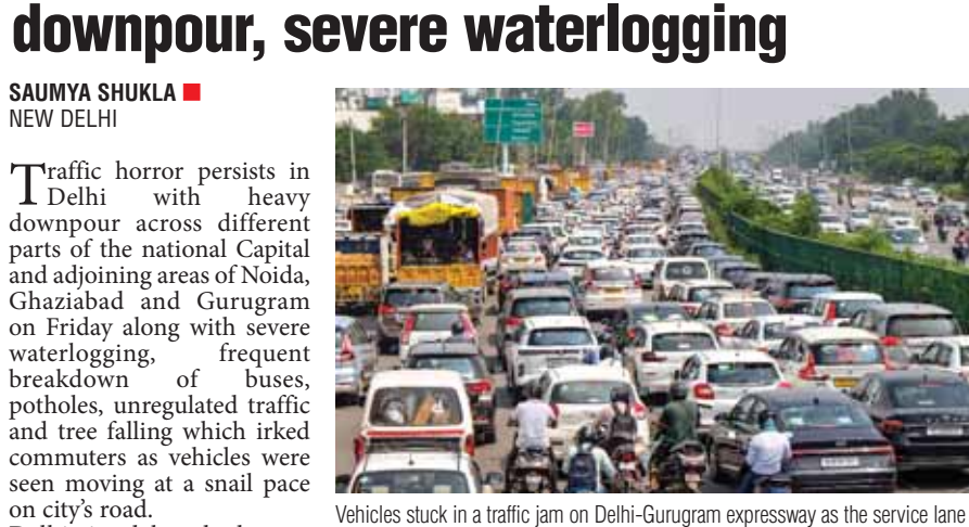
is closed due to construction work of the underpass between Rajokari (Delhi) to expressed his displeasure

places due to waterlogging in different areas of the city Mehrauliincluding Badarpur road, Mathura Vihar, road, Sangam Vihar, Aurobindo Marg, Madhu Vihar road, Delhi Gate, Sainik Farms, India Gate, Janpath Road, Kalindi Kunj,