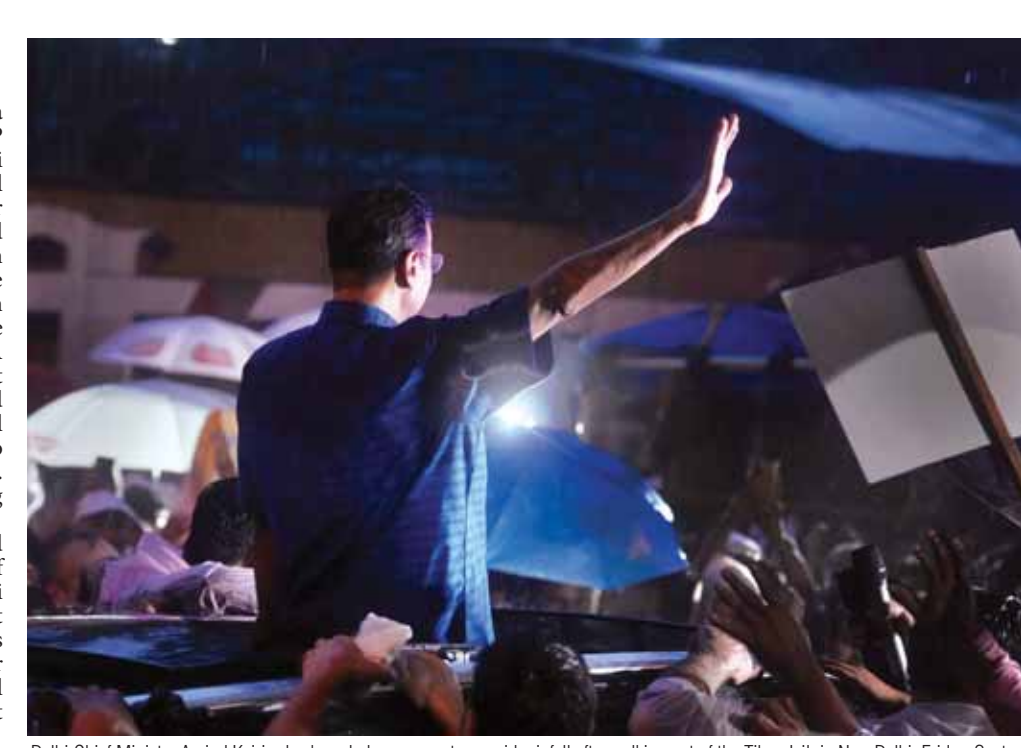
Delhi Chief Minister Arvind Kejriwal acknowledges supporters amid rainfall after walking out of the Tihar Jail, in New Delhi, Friday, Sept. 13, 2024. The Supreme Court (SC) on Friday granted bail to the AAP convener in a corruption case lodged by the Central Bureau of Investigation (CBI) in connection with the excise policy 'scam'

It also restrained him from commenting on his role in the money-laundering case against him and asked him not to interact with witnesses and / or have access to official files connected with the case. With bail conditions that do not give him complete freedom to perform his duties as Chief Minister, including that he cannot visit the Secretariat or the CM Office therein or sign any files other than those that have to be cleared by the Lieutenant Governor, officials said that the AAP Government