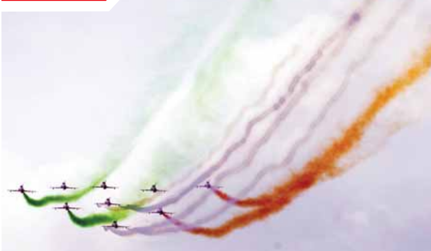
Indian Air Force aerobatics team Surya Kiran performs at exercise 'Tarang Shakti,' in Jodhpur