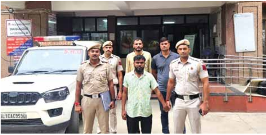
A 30-year-old man was arrested after four men allegedly opened fire outside a night club in Delhi's Shahdara